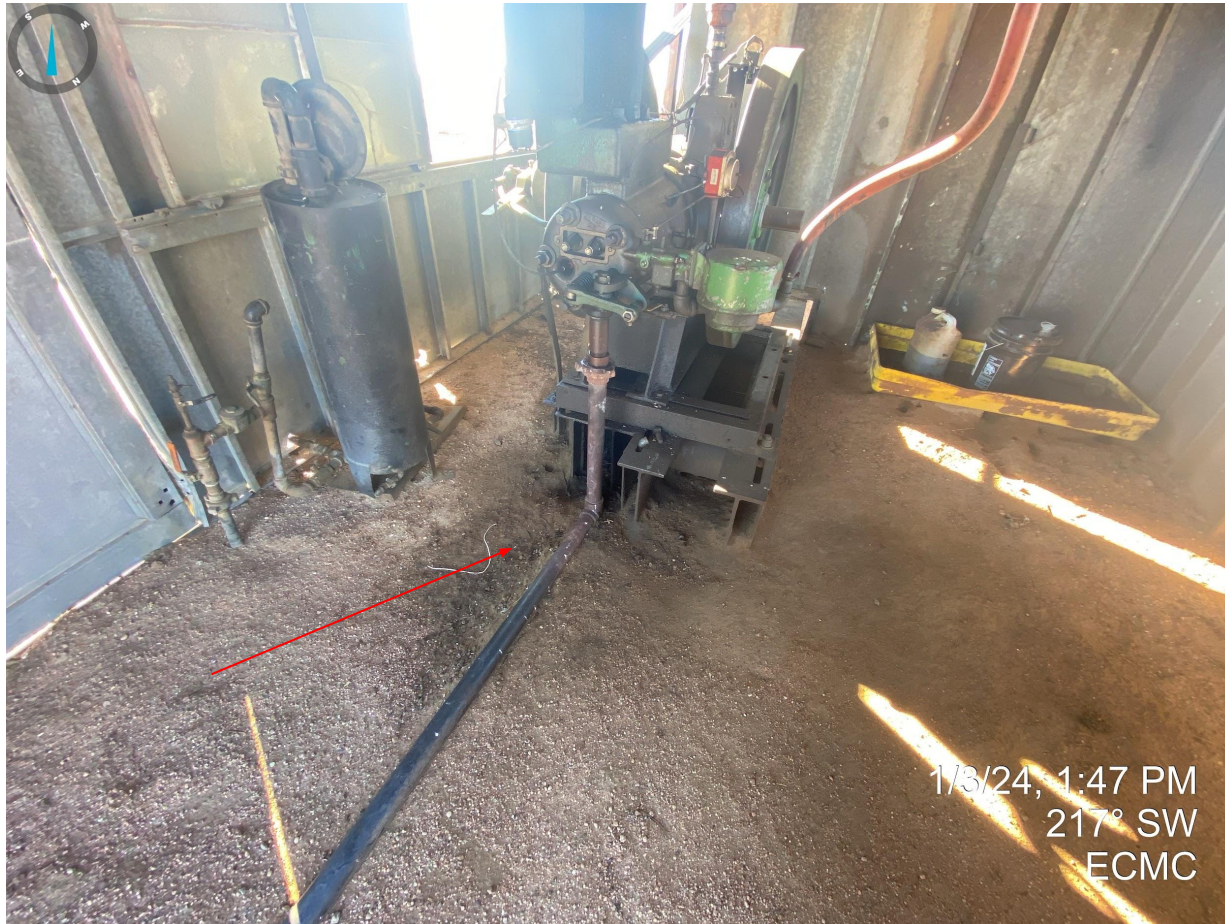
Photo 2. Stained soil observed at the pumpjack motor.