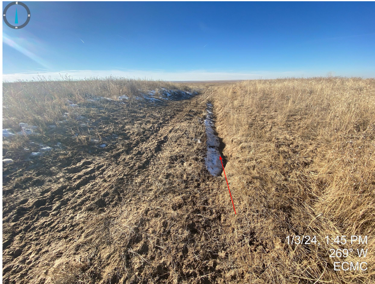
Photo 1. Erosion degradation (e.g. gullyng) occurring along the access road.