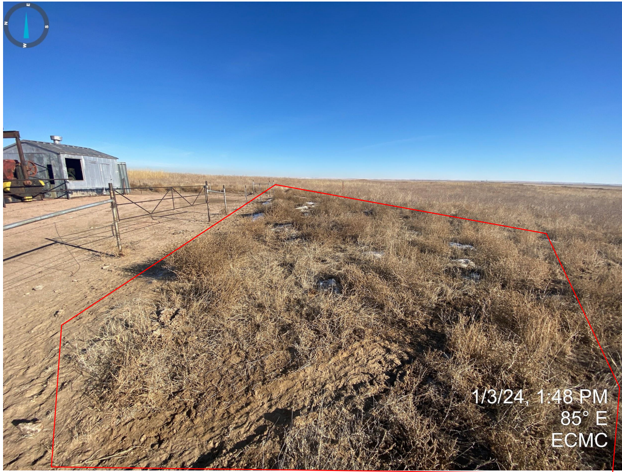
Photo 4. Southern interim areas, undesirable vegetation observed; see comments in Photo 3.