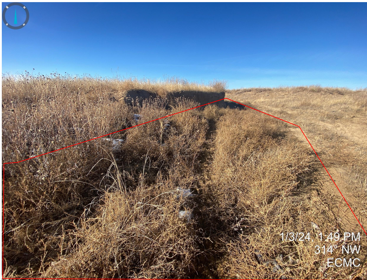
Photo 6. North of pumpjack along the access road; see comments in Photo 3.