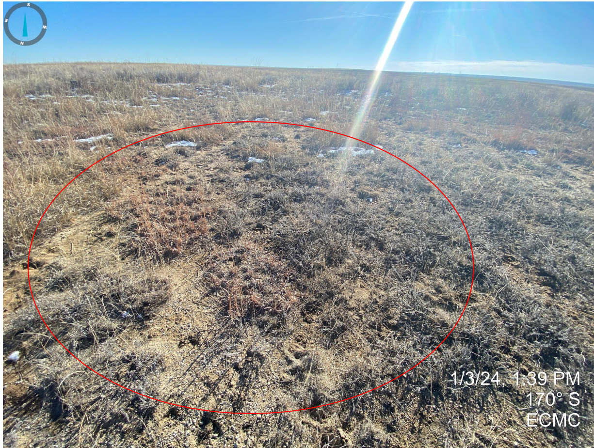
Photo 2. Taken from the northern portion of the location; see comments in Photo 1.