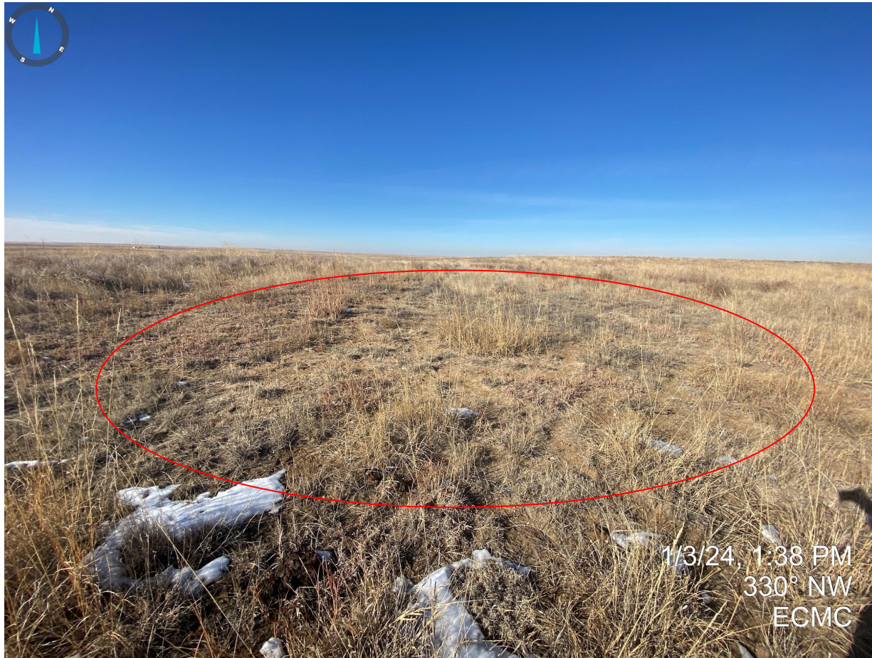
Photo 1. Taken from the southern portion of the location. The location is experiencing areas of bare/exposed soils due to non-uniform vegetation cover.