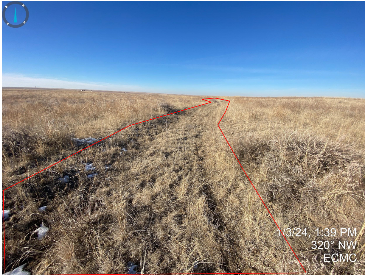
Photo 3. Looking north from the location along the access road. It does not appear that the access road has been contoured/regraded to reflect pre-disturbance levels