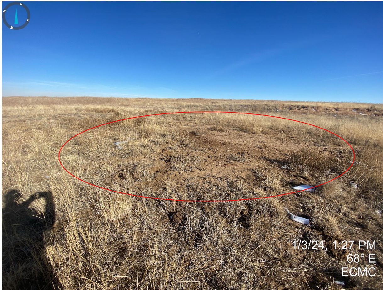
Photo 2. South of the former well location. It does not appear that any reclamation activities have occurred since the previous inspection. The location is still experiencing areas of non-uniform vegetation cover (bare/exposed soils) and undesirable vegetation.