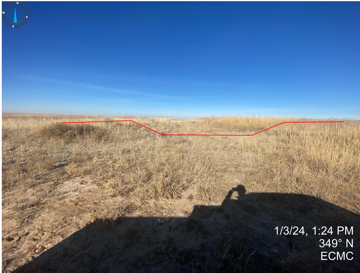
Photo 1. Taken from the location entrance. Photo illustrates that the access road has not been regraded or contoured to reflect adjacent reference areas, or pre-disturbance levels.