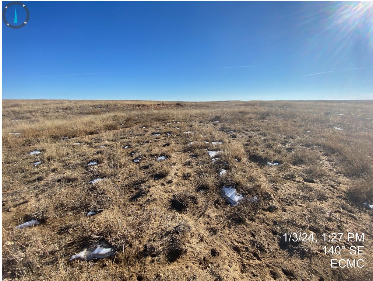
Photo 4. North end of former well location; see comments in Photo 2.