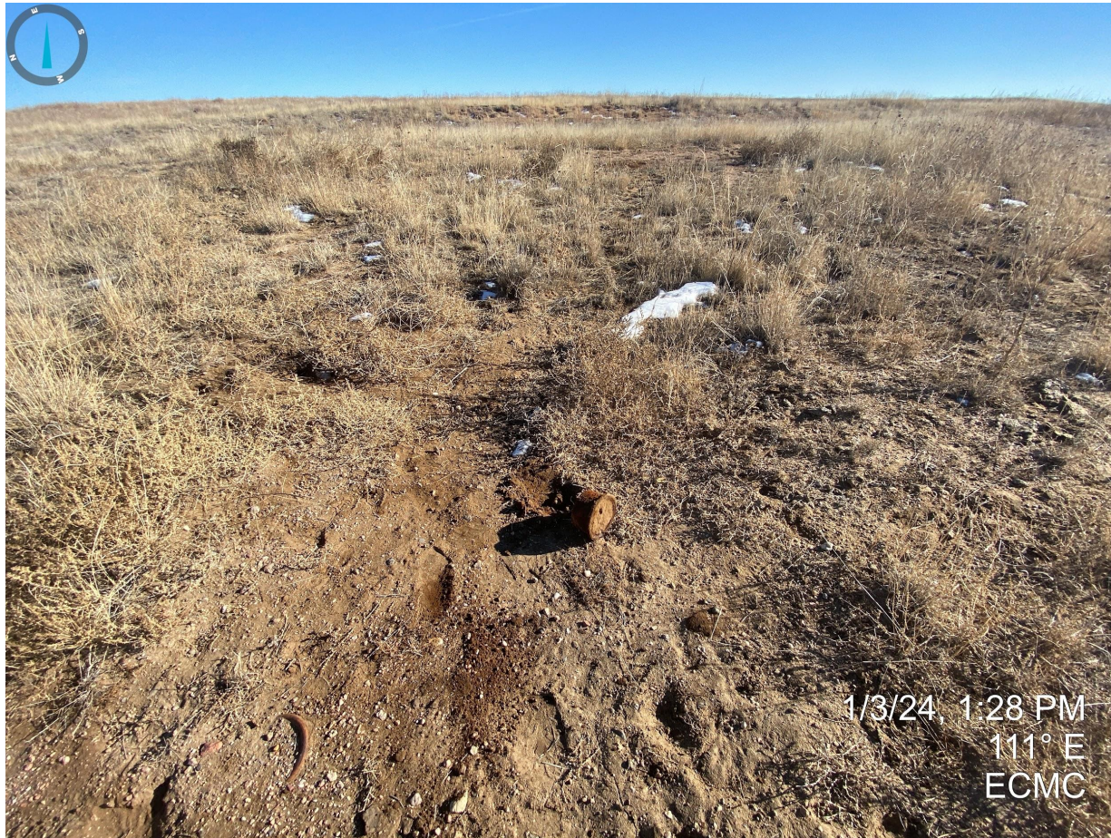
Photo 5. Bare soils, metal debris and undesirable vegetation (e.g. kochia and russian thistle) observed near former wellhead.