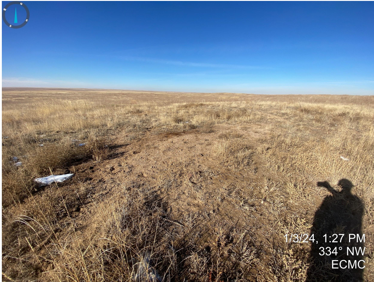
Photo 3. South end of former well location; see comments in Photo 2.