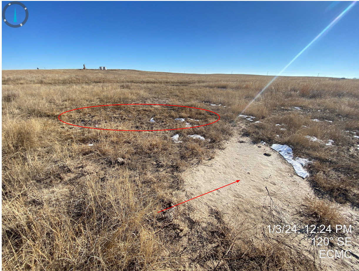
Photo 3. Subsidence (red circle) and bare soil (red arrow) issues at the former wellhead.