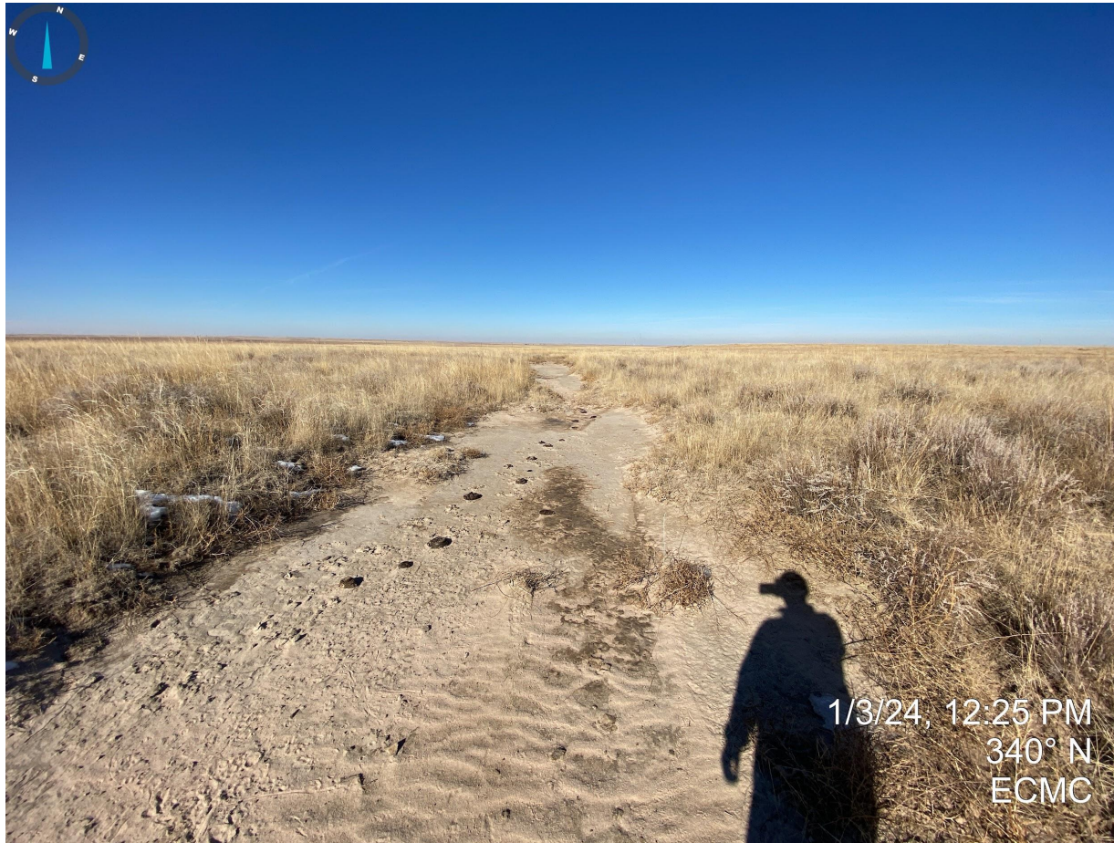
Photo 4. The access road, north of the former well location has not been reclaimed as evidence by bare/exposed soils and contouring/grading issues.