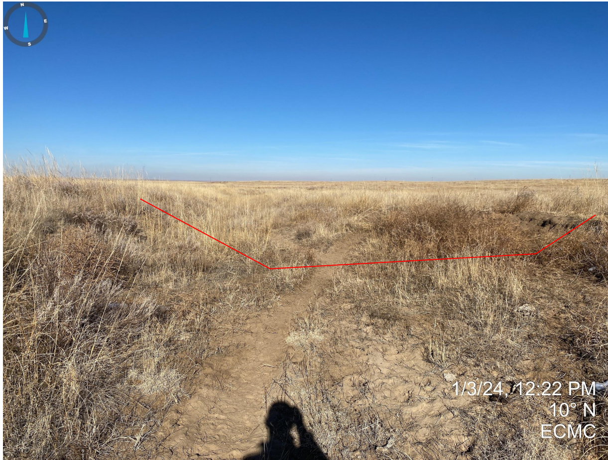
Photo 1. Taken from the start of the southern access road. The access road has not been reclaimed as it has not been regraded and/or contoured to reflect adjacent reference area, or pre disturbance conditions. Red line illustrates contouring issues.