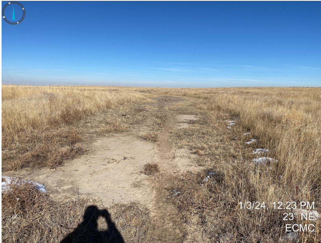
Photo 2. The access road, east of the former well location has not been reclaimed as evidence by bare/exposed soils and contouring/grading issues.