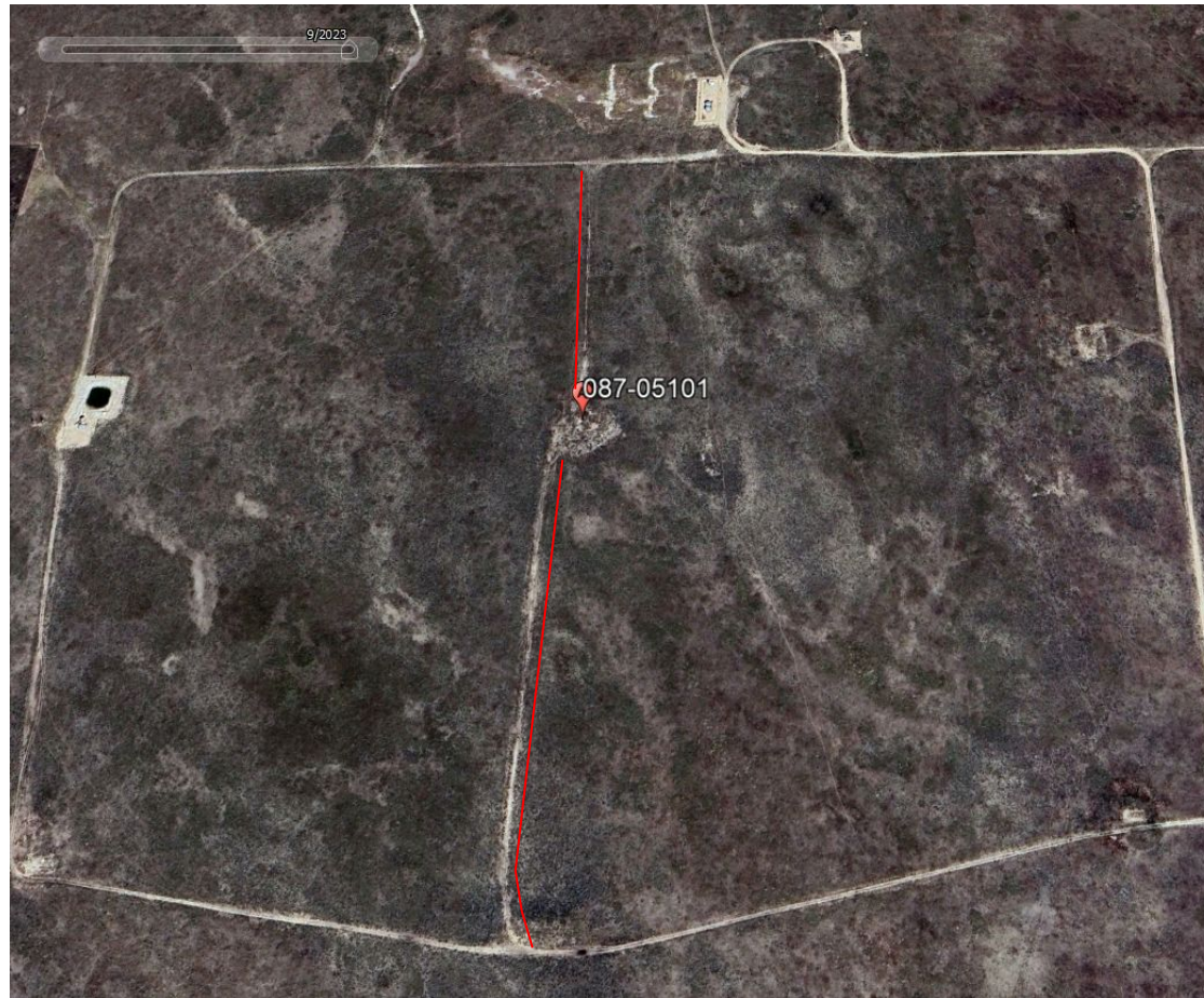
Photo 3. Google Earth aerial imagery taken circa 09/2023. Photo illustrates the access roads, highlighted in red, that require additional reclamation activities (e.g. contouring, regrading, revegetation, etc).