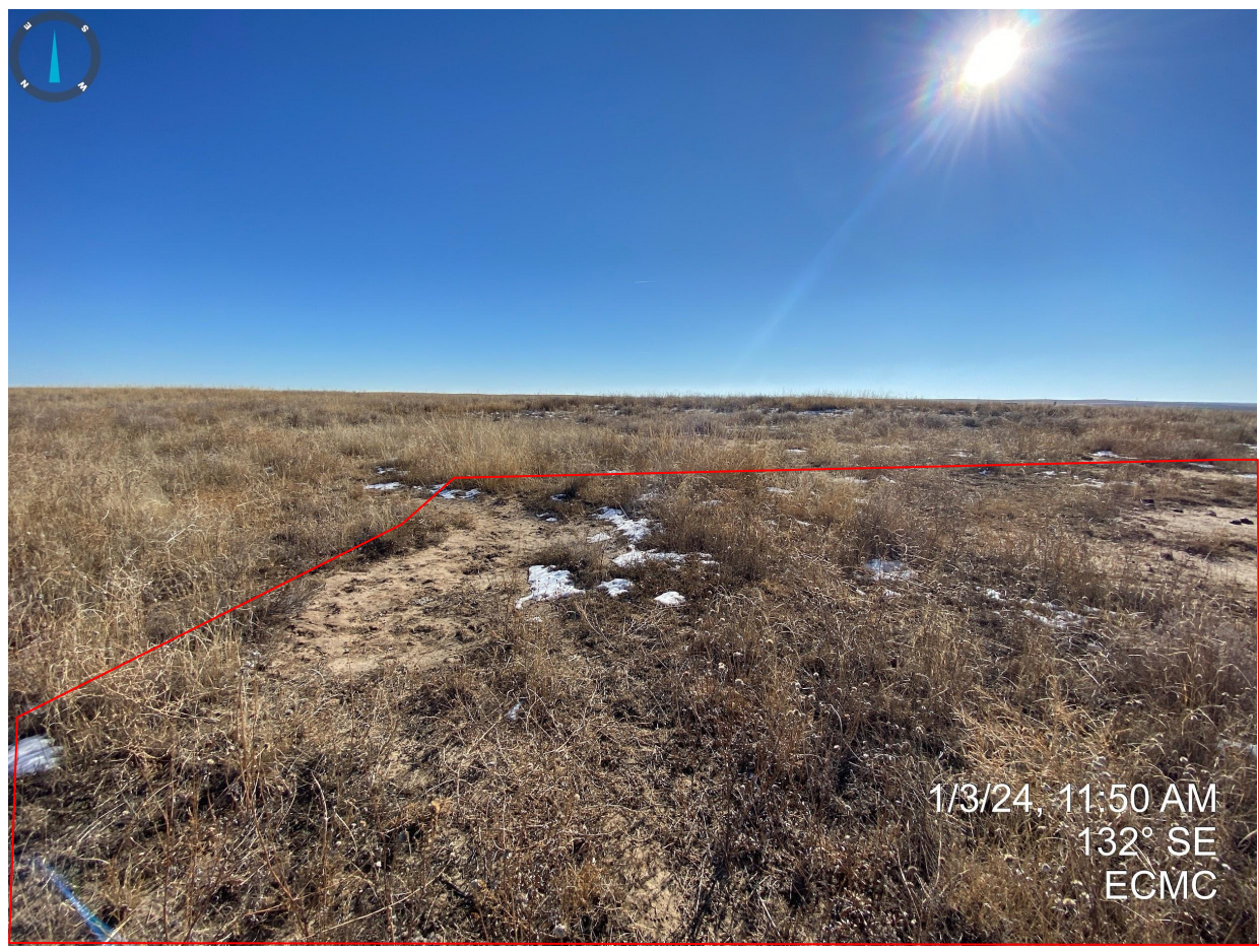
Photo 6. Taken from the northern portion of the location, facing southeast. See comments in Photo 4.