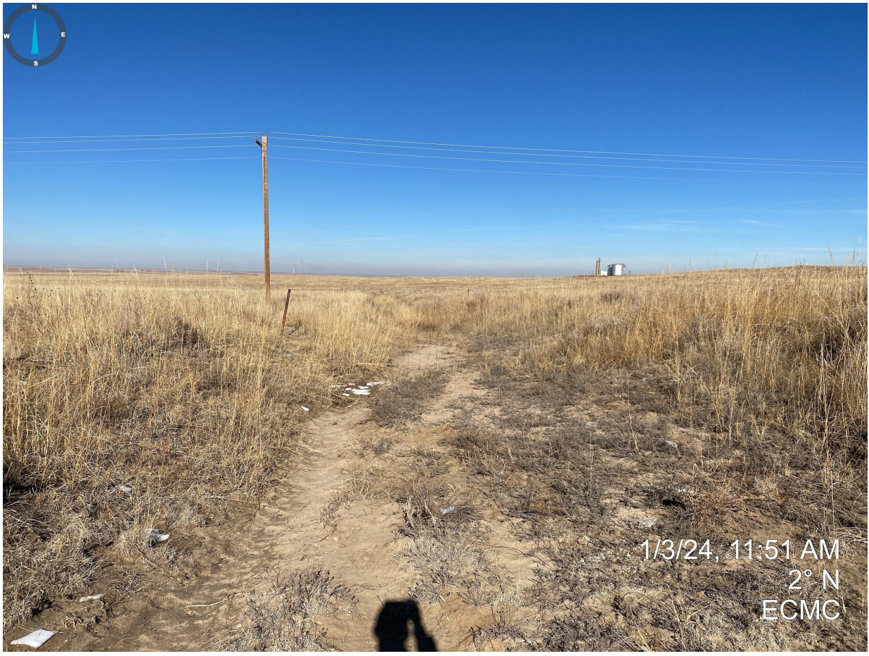
Photo 2. Taken from the access road north of the location. See comments in Photo 1.