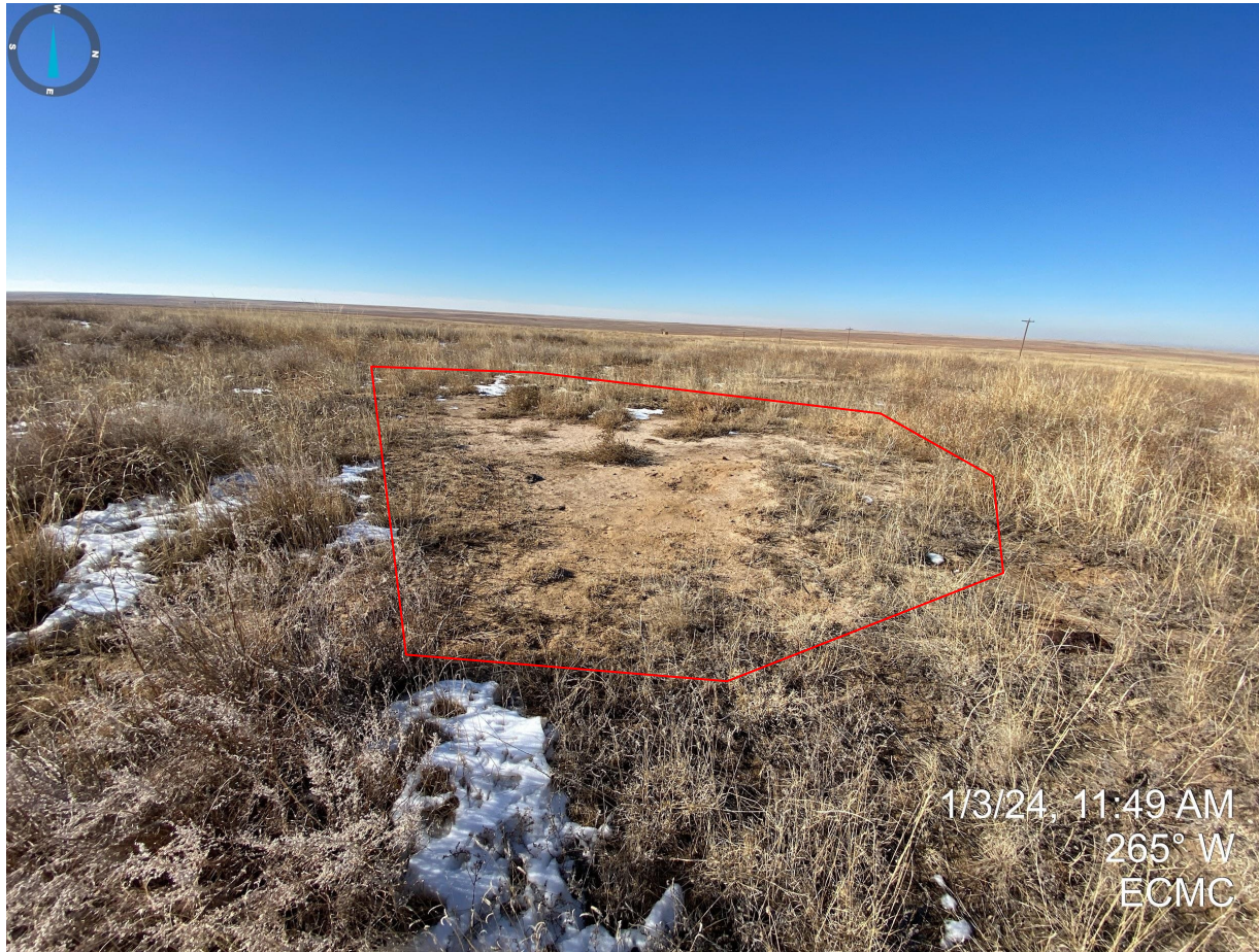
Photo 4. Taken from the eastern portion of the location, facing west. Non-uniform vegetation cover resulting in bare/exposed soils highlighted in red.