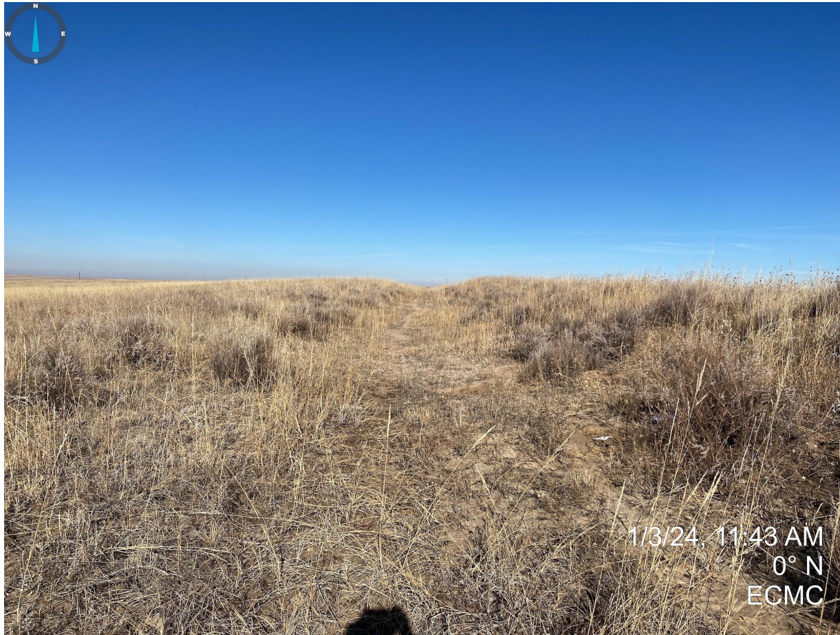
Photo 1. Taken from the access road, south of the location. Photo illustrates that the access road has not been regraded or contoured to reflect adjacent reference areas, or pre-disturbance conditions. Additional reclamation activities are required.