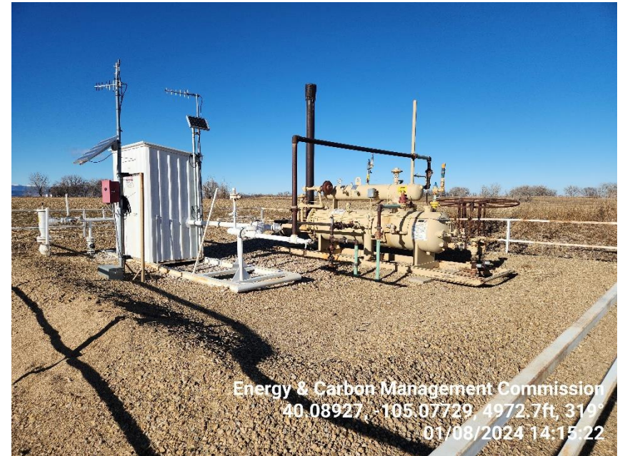
Photo 6 Horizontal Heated Separator & Gas Meter Run, card indicates current calibration.