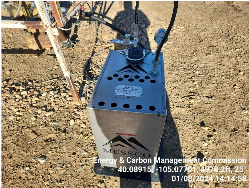
Photo 3 Fugitive gas recovery device.