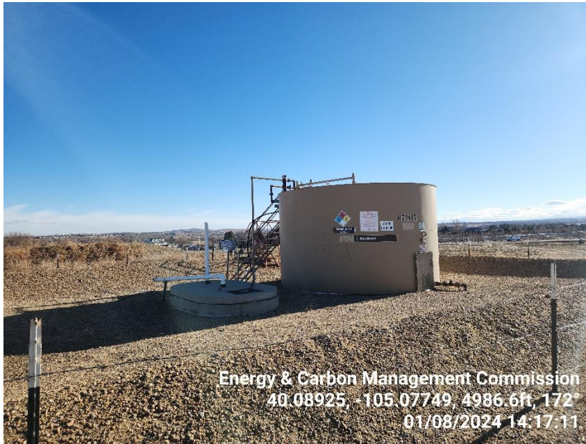
Photo 7 TB.