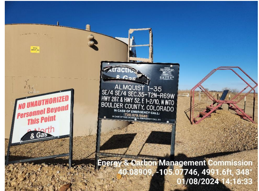
Photo 4 TB sign is peeling.