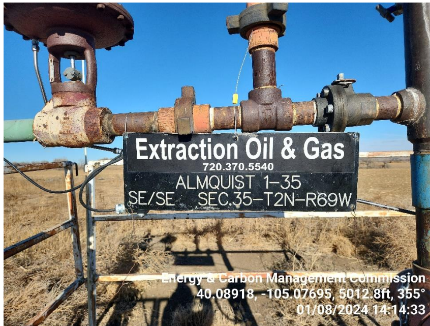
Photo 1 WH Sign.