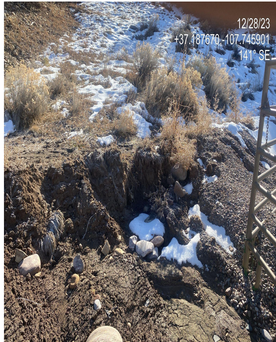
Photo 4. View of erosion on the eastern edge of the disturbance. Erosion is undercutting equipment on location and transporting sediment across the disturbance.