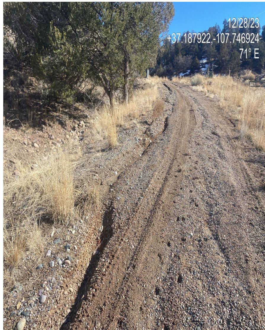
Photo 6. View of rill erosion running down the length of the access road.