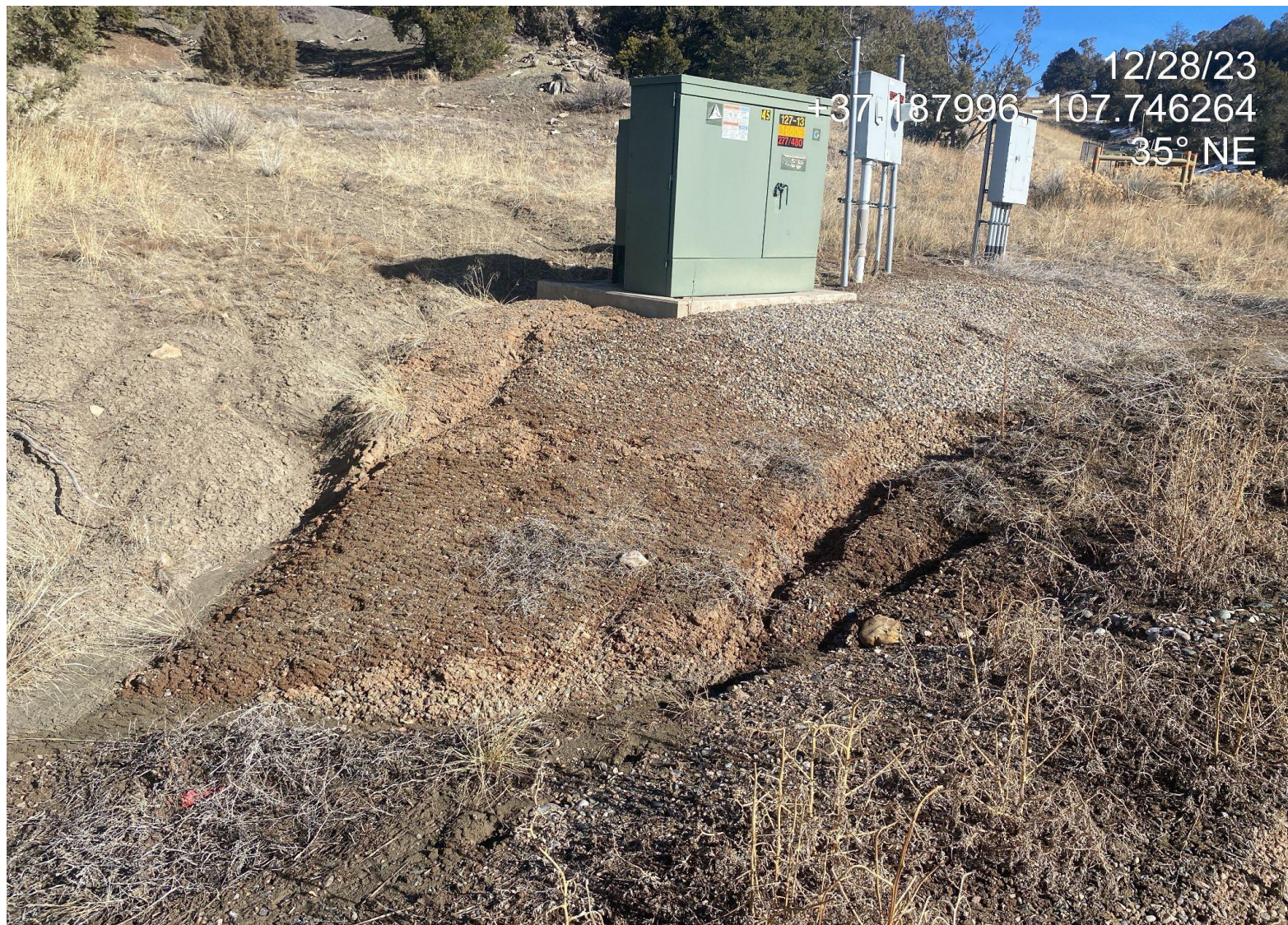
Photo 5. View of additional rill erosion forming on the northern edge of the disturbance.