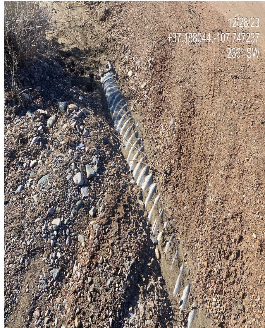
Photo 7. View of culvert at access point that is no longer functioning. Culvert is completely covered and filled with sediment, stormwater is now running over the culvert.