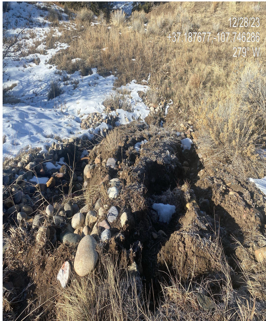
Photo 3. View of rill/gully erosion observed in the southern western interim reclamation area.