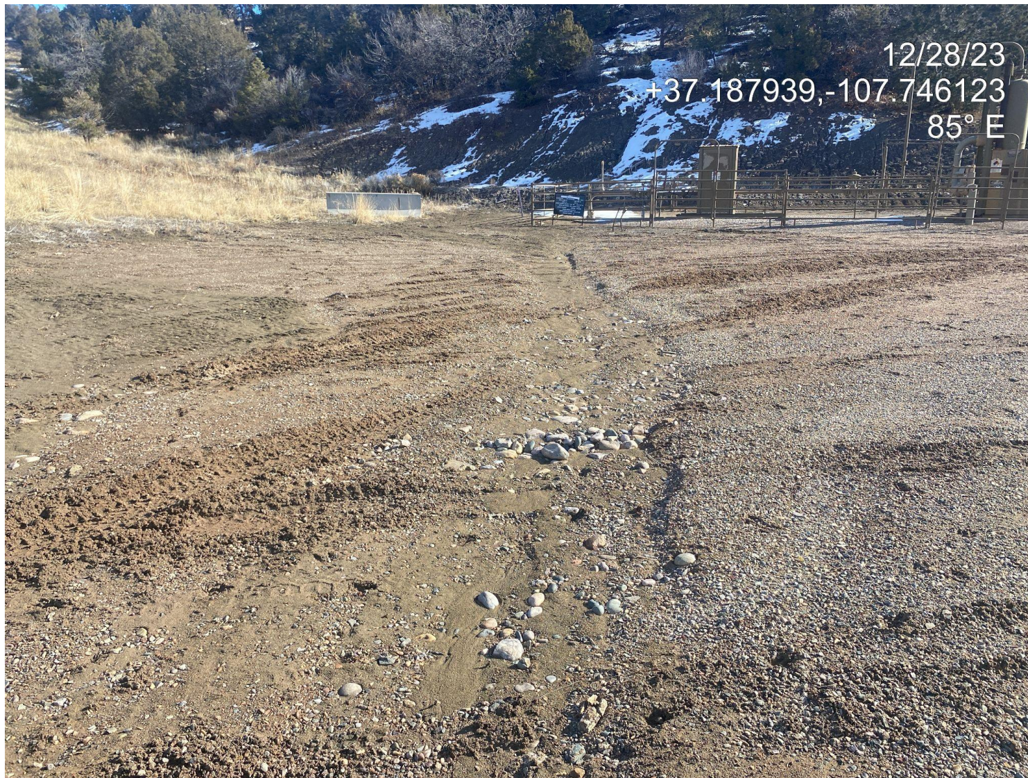
Photo 2. View of sediment transport moving from east to west across the disturbance.