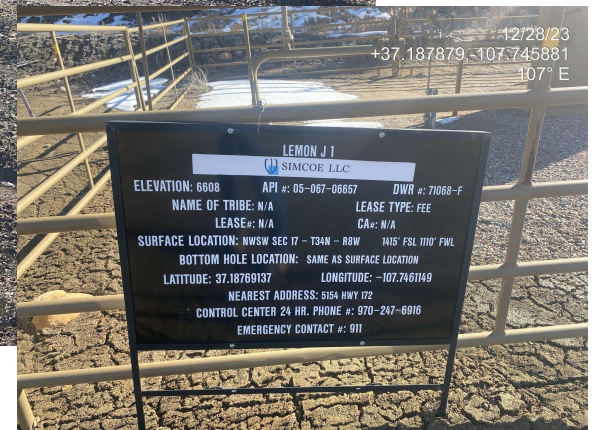
Photo 1. View of the well disturbance from the entrance facing center.