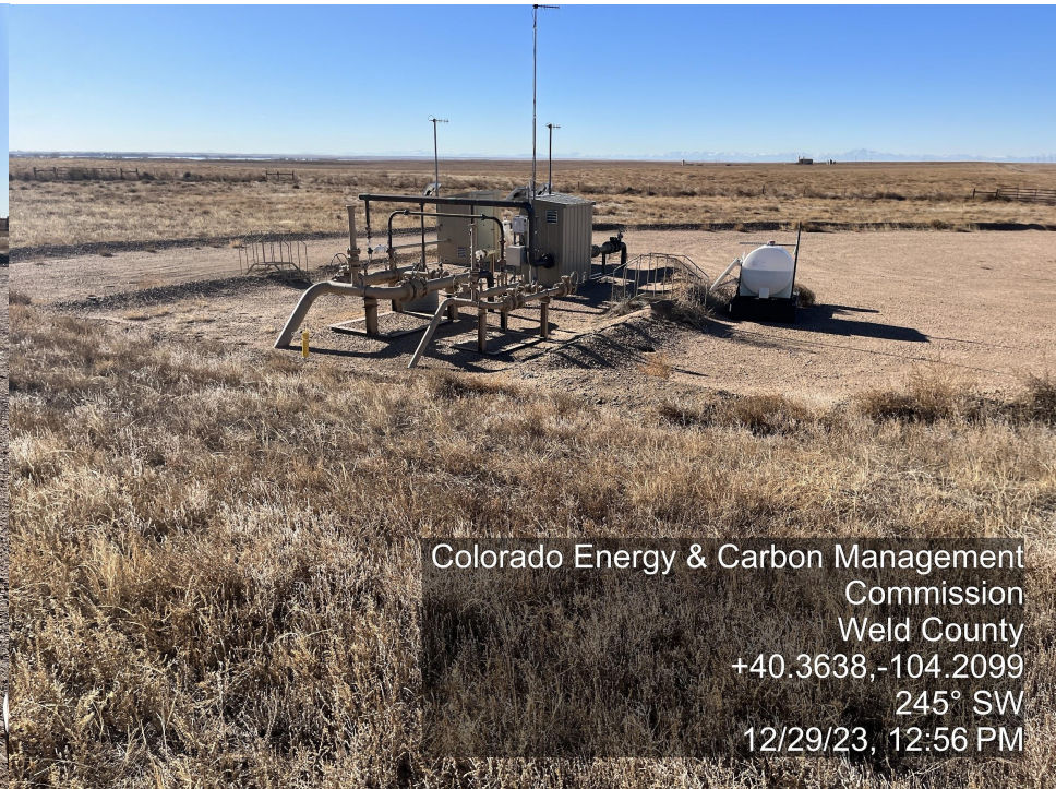
Photo 7. The photo was taken at the well location facing South. Refer to the comment for photo 6.