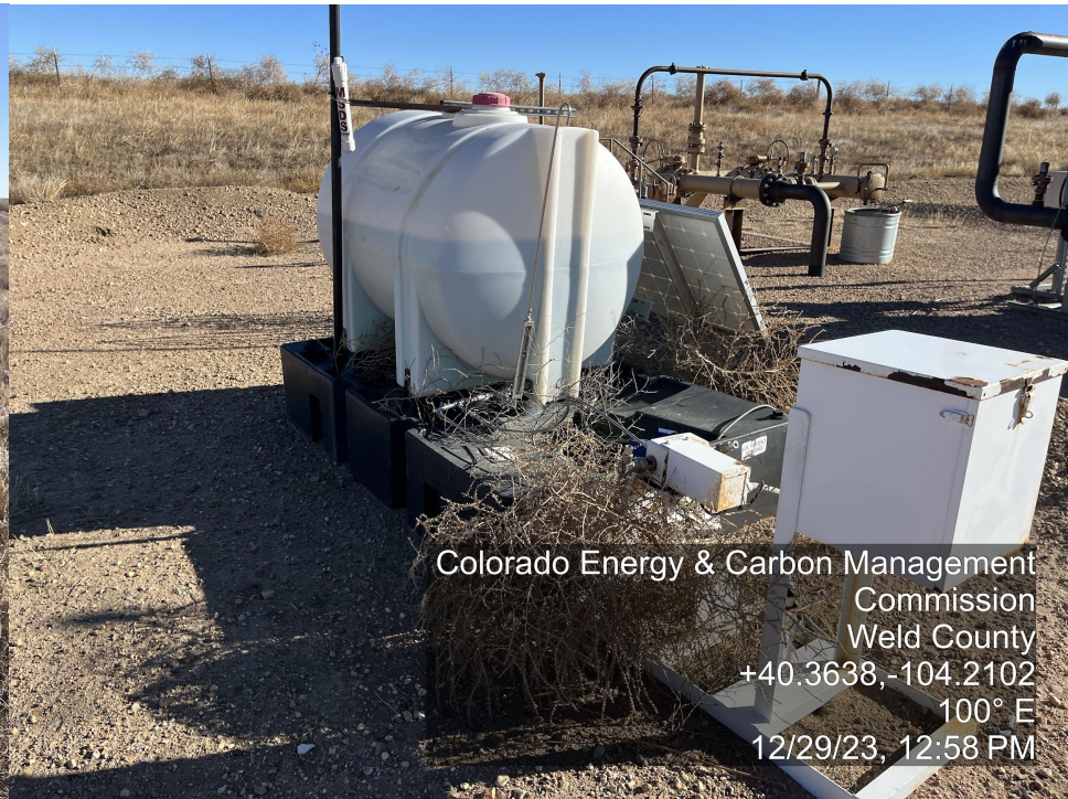
Photo 3. The photo was taken at the well location facing Southeast. The photo illustrates the well pad is intact and the interim reclamation areas are dominated by russian thistle and kochia.