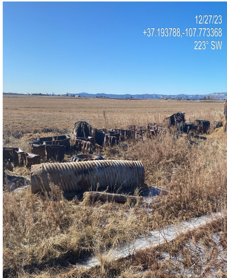
Photo 3. Large pile of gravel and surface owner equipment stored on location.