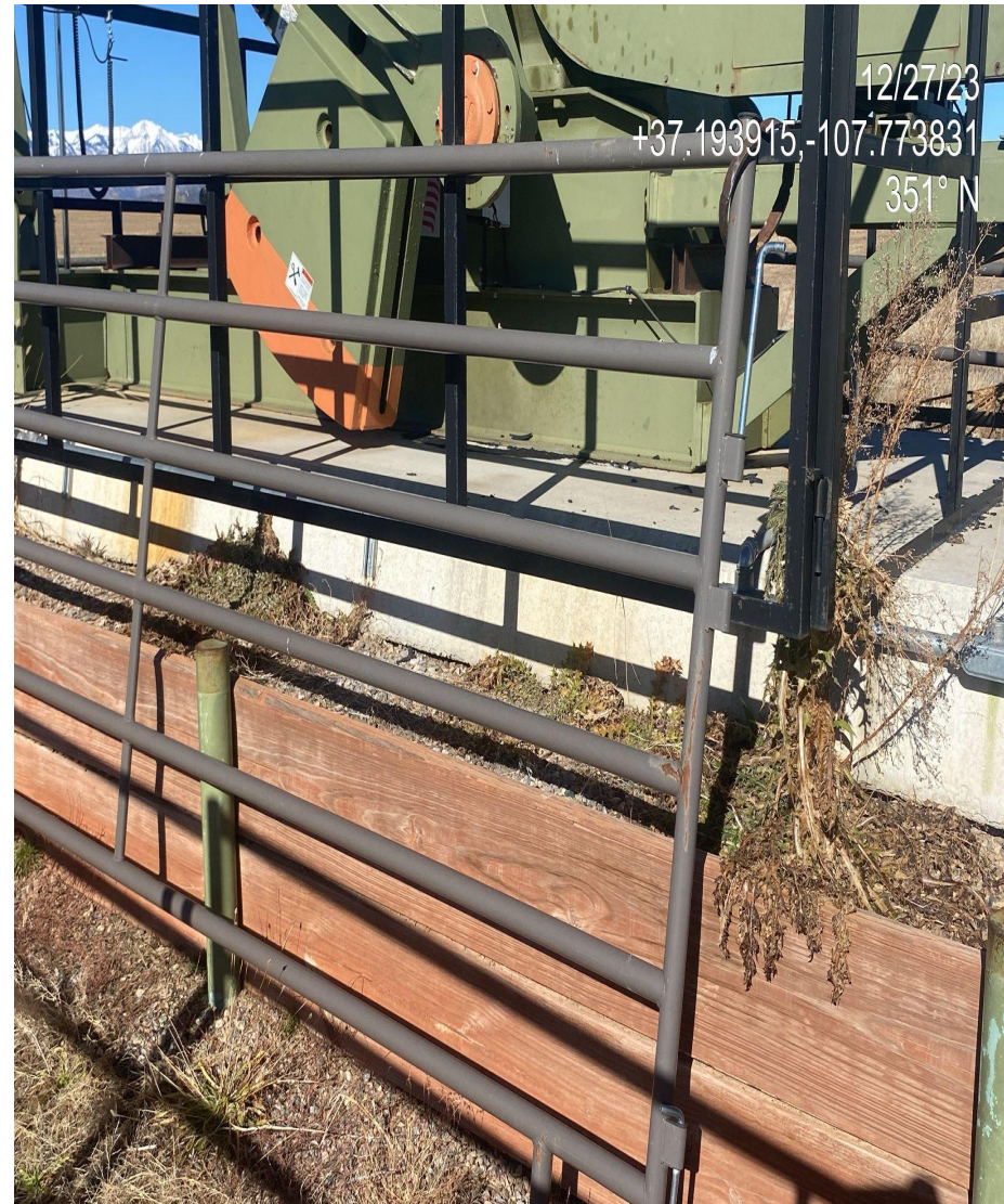
Photo 2. View of musk thistle observed on location and around active equipment.