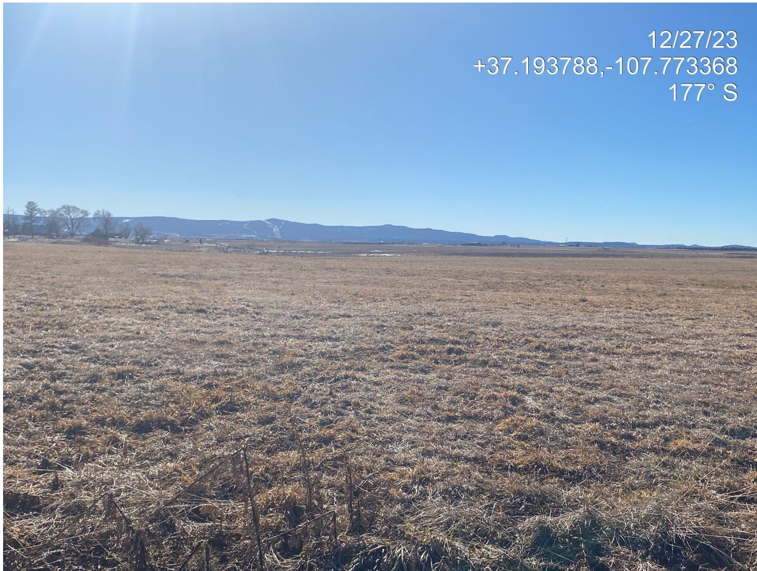
Photo 4. Reference area is a grassy agriculture field.