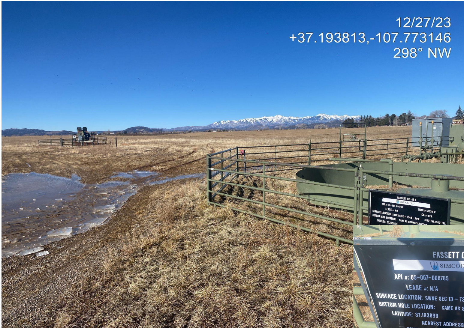
Photo 1. View of the well disturbance from the entrance facing center.