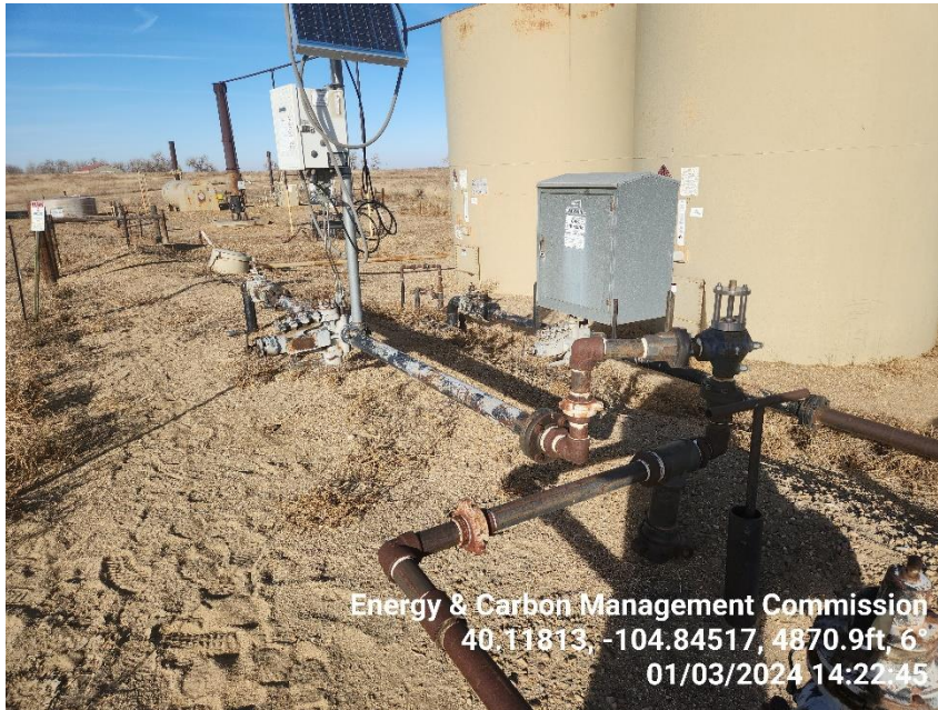
Photo 7 Gas Meter Run card indicates current calibration.