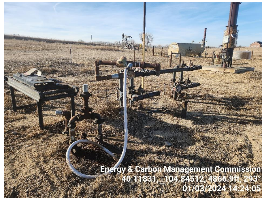
Photo 10 Flow line manifold.