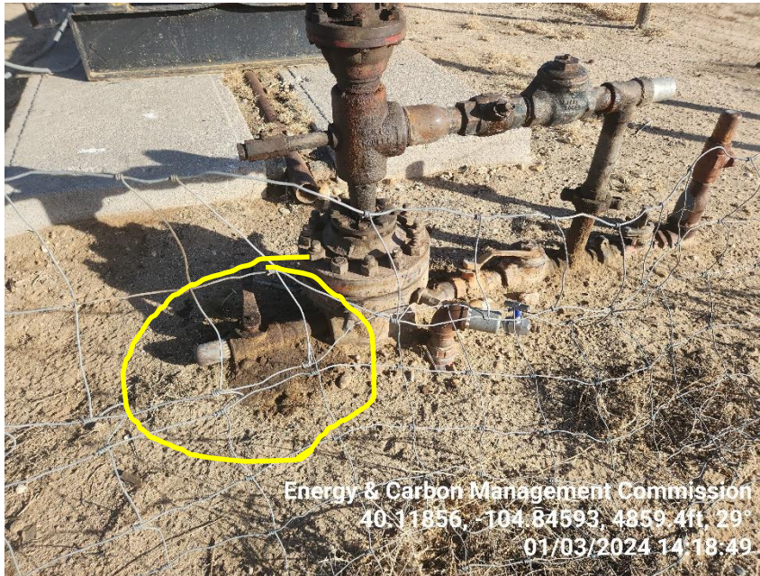
Photo 3 Stained soil by the WH.