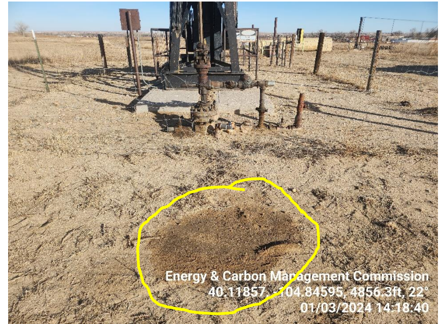
Photo 4 Stained soil to the west of the WH.