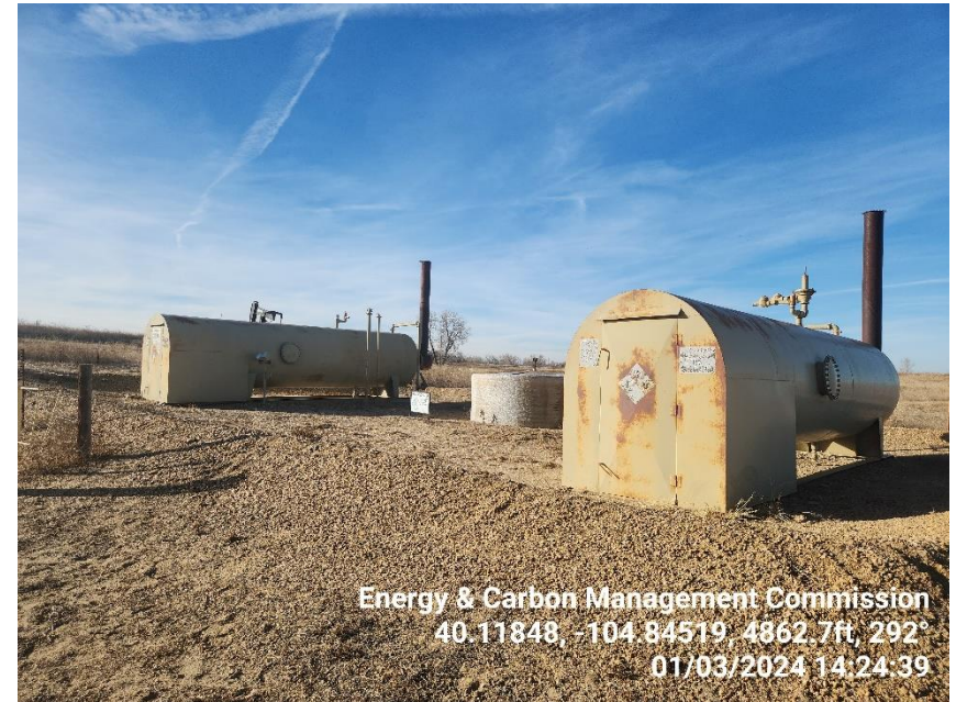
Photo 14 Horizontal Heater Treaters.