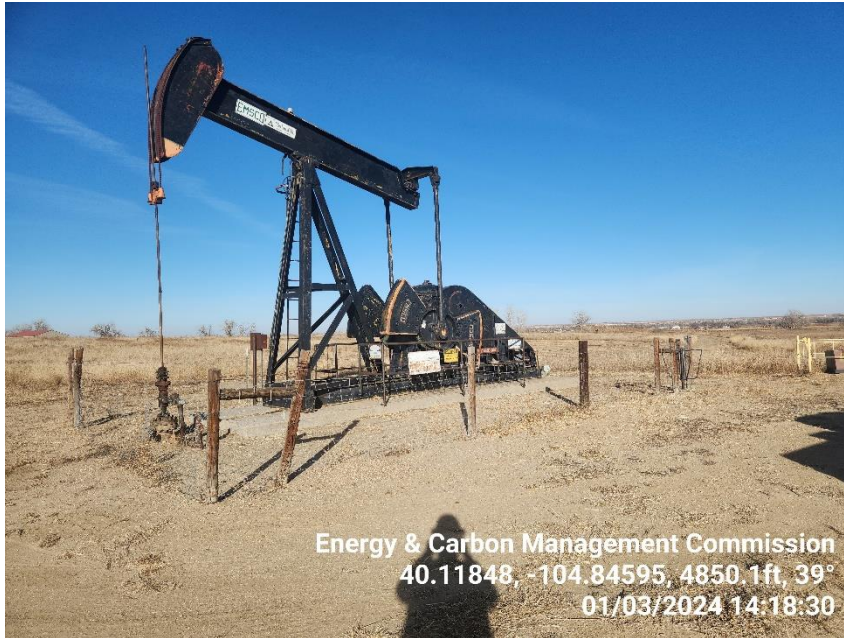
Photo 1 Wellsite.