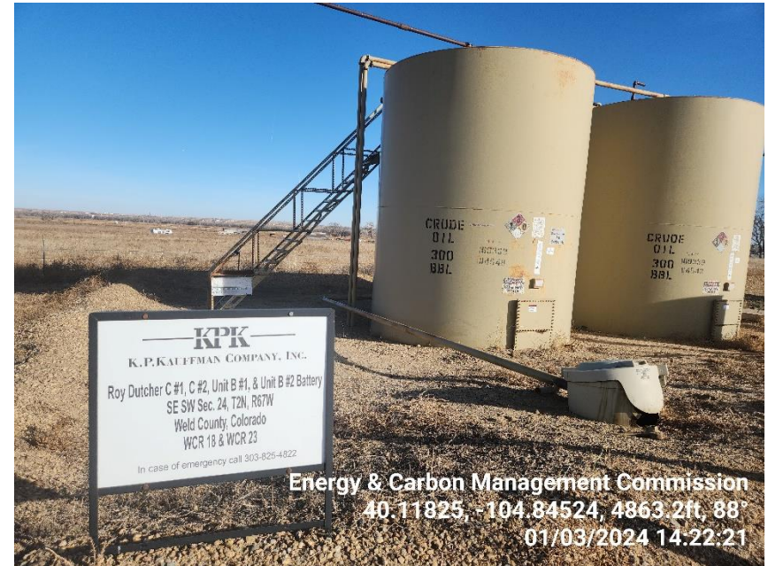
Photo 6 Tank battery/sign.