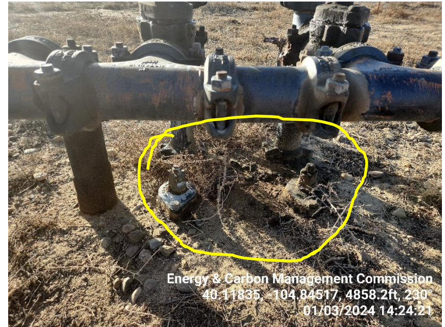
Photo 12 Stained soil by the flow line manifold.