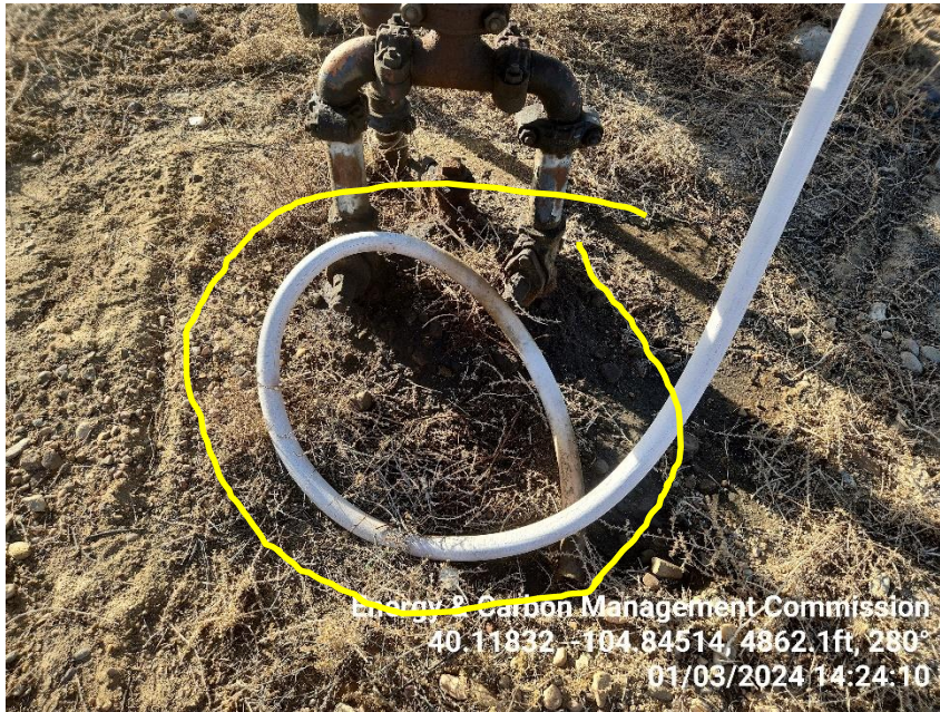
Photo 11 Stained soil by the flow line manifold.