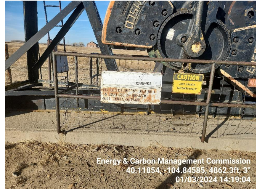
Photo 2 WH sign faded and needs replaced.