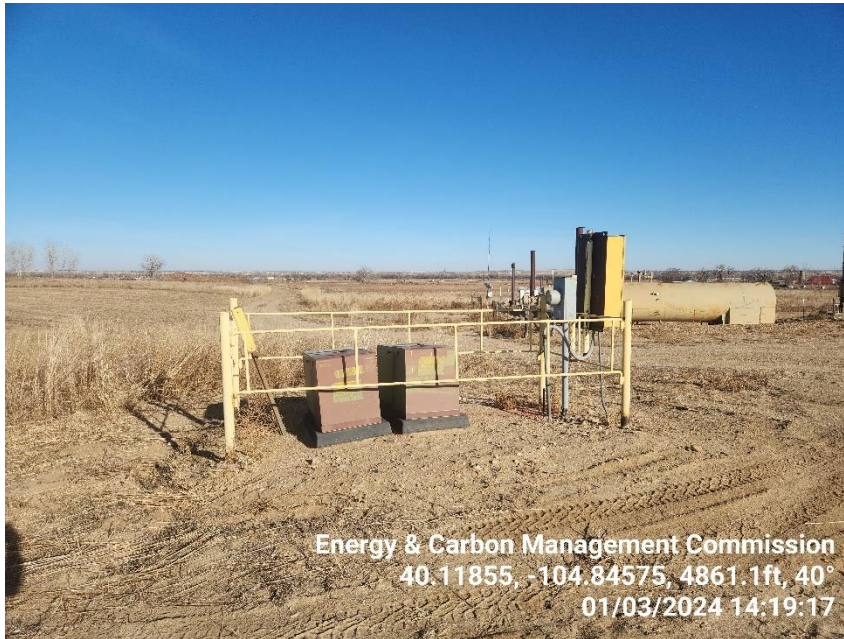
Photo 5 ancillary equipment.