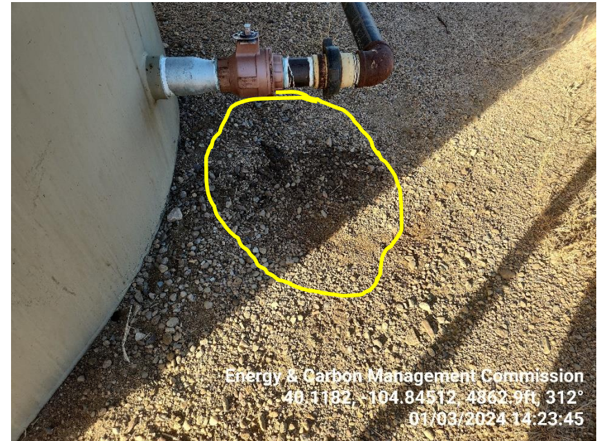
Photo 8 Stained soil by the TB load out valve