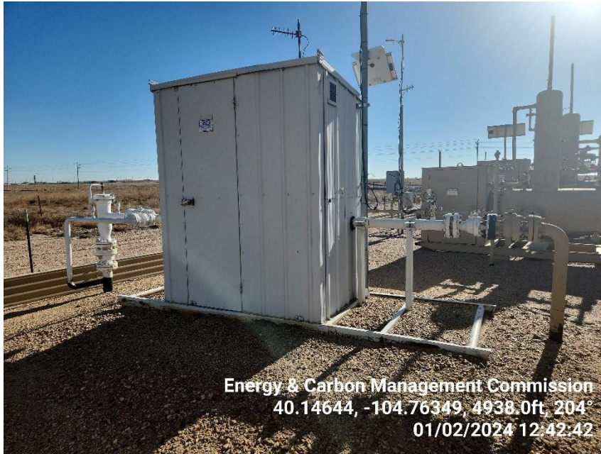
Photo 13 Gas Meter Run, card indicates current calibration.