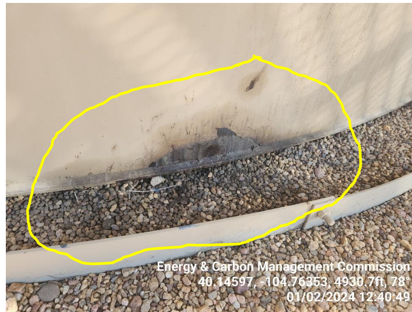
Photo 6 Stained soil on the East side of the condensate tank by the hole in tank.