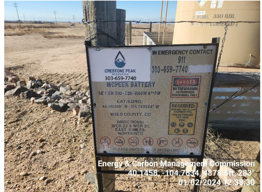
Photo 1 Location.

Energy & Carbon Management Commission 40.1458, -104.7634, 4878.5ft, 283° 01/02/2024 12:38:30