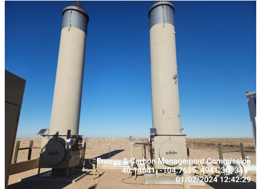
Photo 12 ECDs.