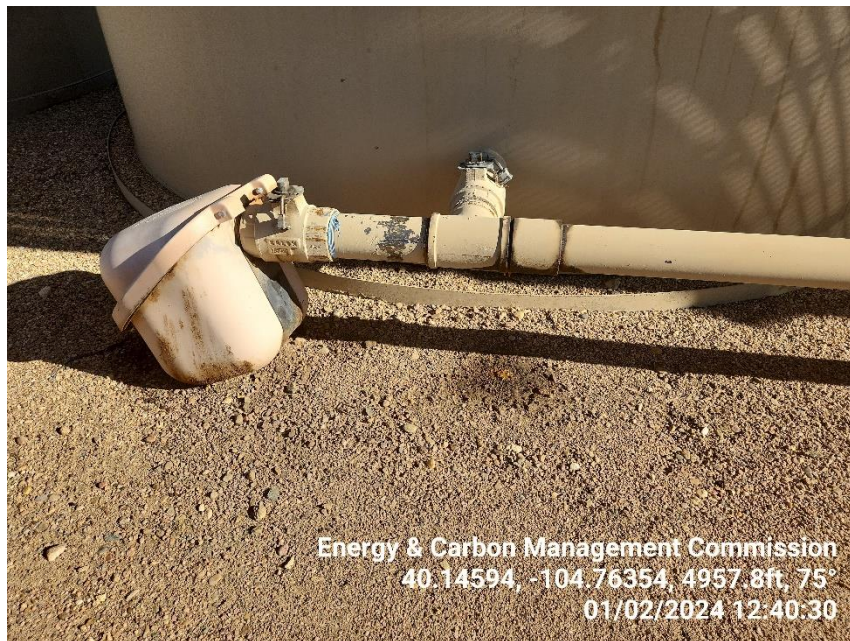
Photo 5 Stained soil on the East side of the condensate tank by the load out line.