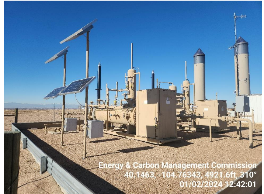
Photo 10 Horizontal Heated Separators.