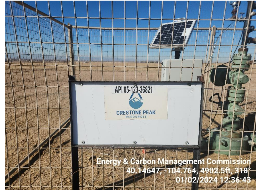
Photo 8 WH sign faded no emergency information.