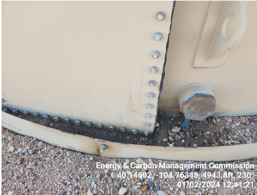
Photo 7 Stained soil on the west side of the condensate tank by the access panel.