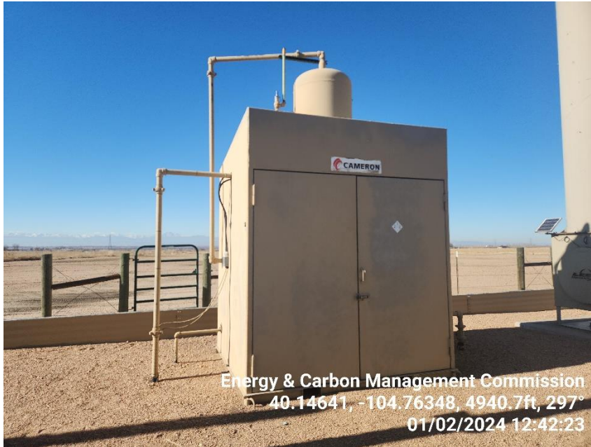
Photo 11 Vertical Separator.