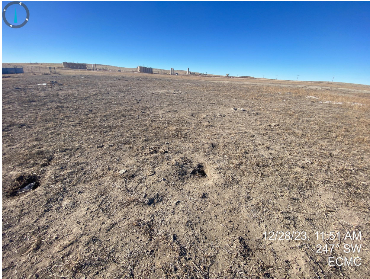
Photo 9. North of production equipment, facing southwest; see comments in Photo 5.