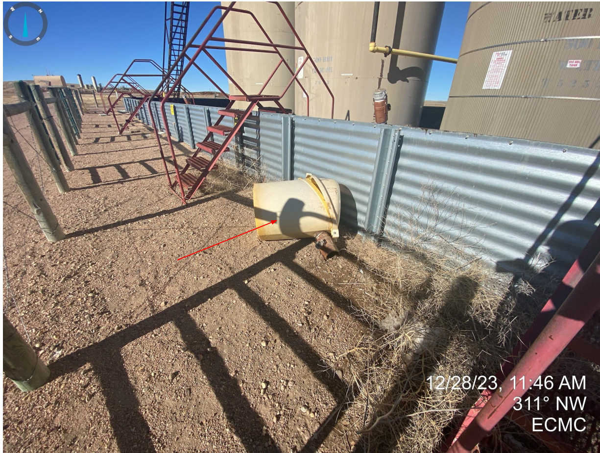
Photo 4. Loadout line collection pot does not appear to be in use; any unused equipment shall be returned to service or removed.