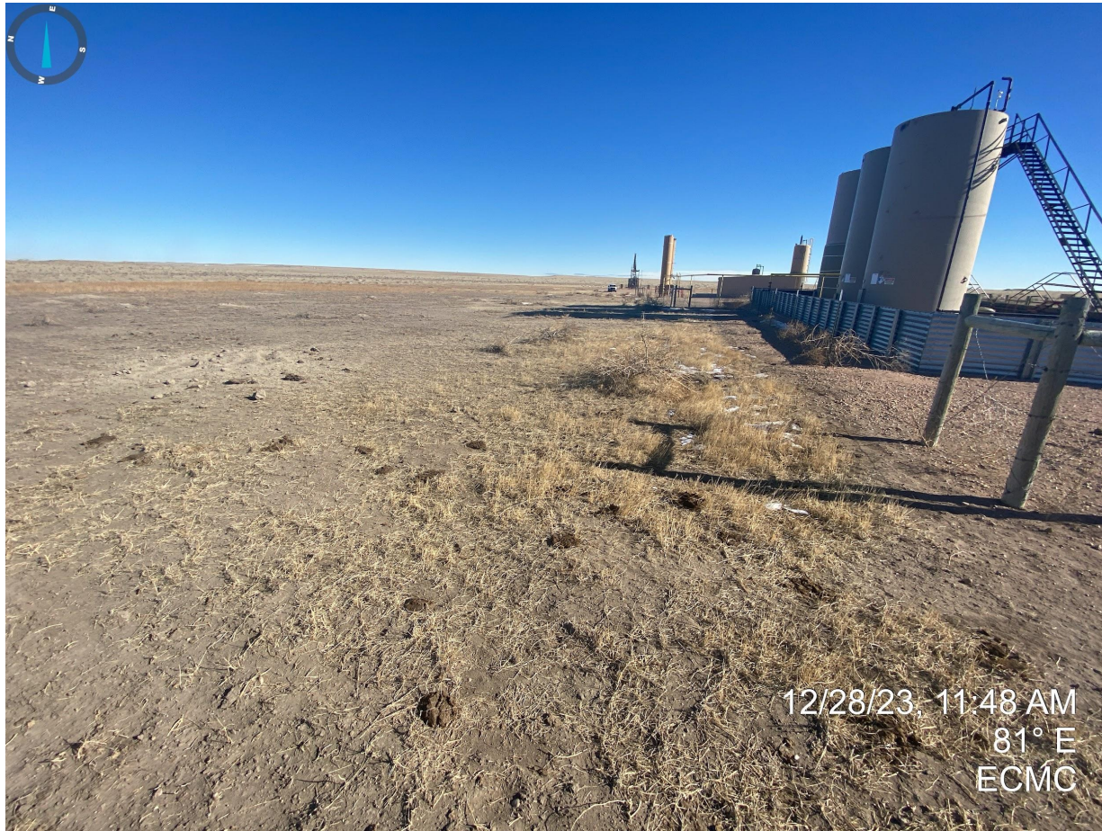
Photo 8. Northwest of production equipment; see comments in Photo 5.