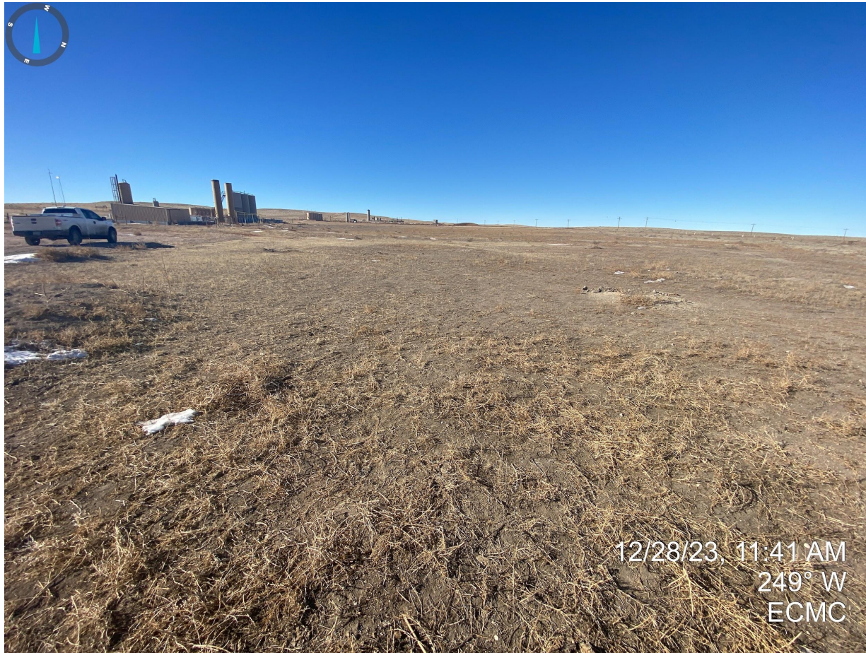
Photo 5. North of wellhead. Interim areas do not appear to be progressing towards Rule 1003 regulations and standards with evidence of bare/exposed soils and undesirable vegetation (e.g. russian thistle and kochia) observed. Additional reclamation activities are required.