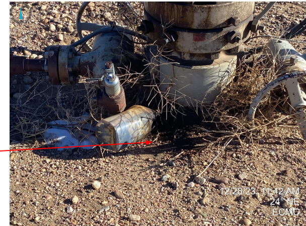
Photo 1. Stained soil and a container with unknown fluid observed near wellhead.