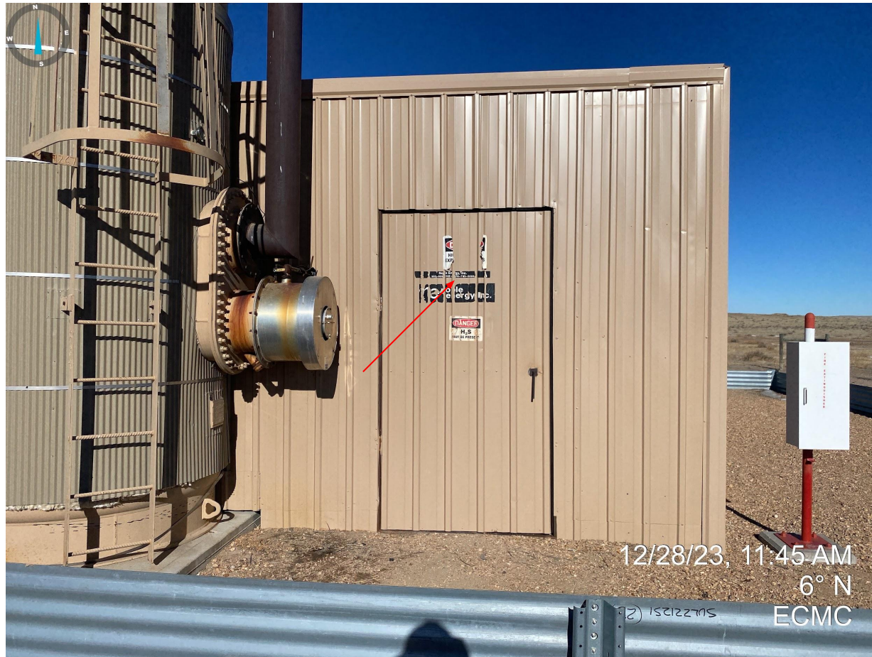
Photo 2. Labels and emergency contact info are not legible and require replacement.