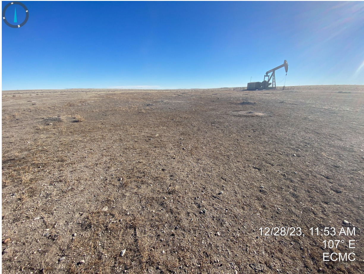
Photo 11. North of production equipment, facing east; see comments in Photo 5.