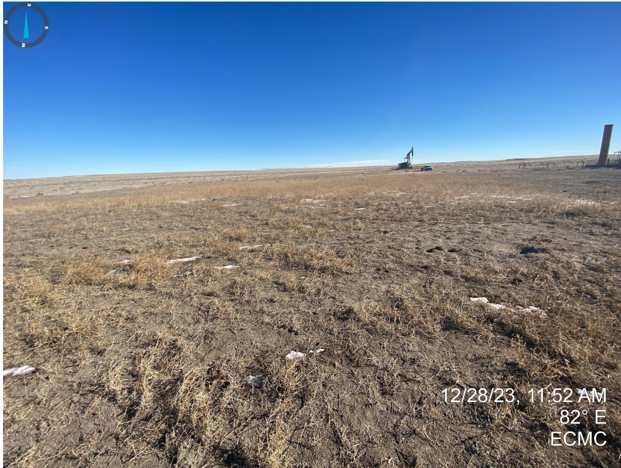
Photo 10. North of production equipment, facing east; see comments in Photo 5.