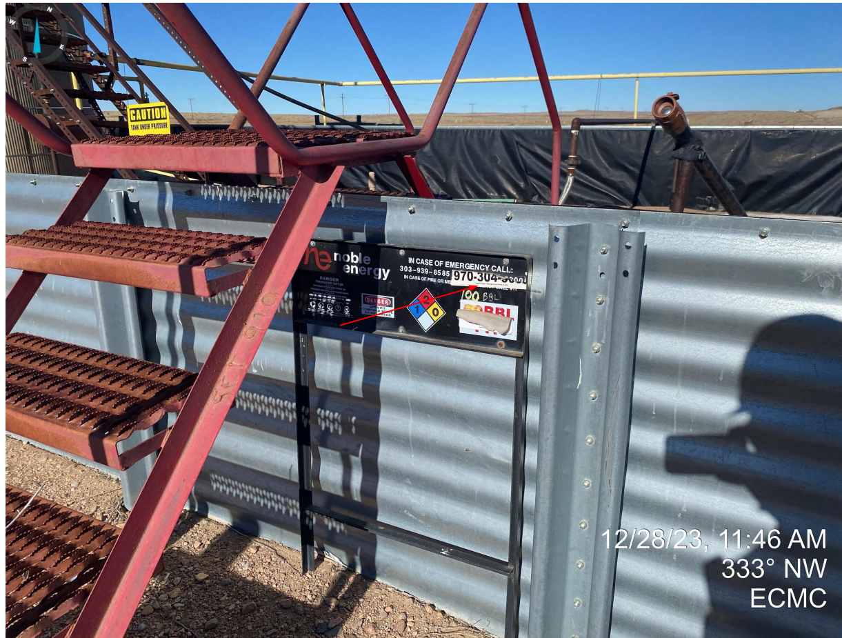
Photo 3. Labels and emergency contact information are not legible and require replacement.