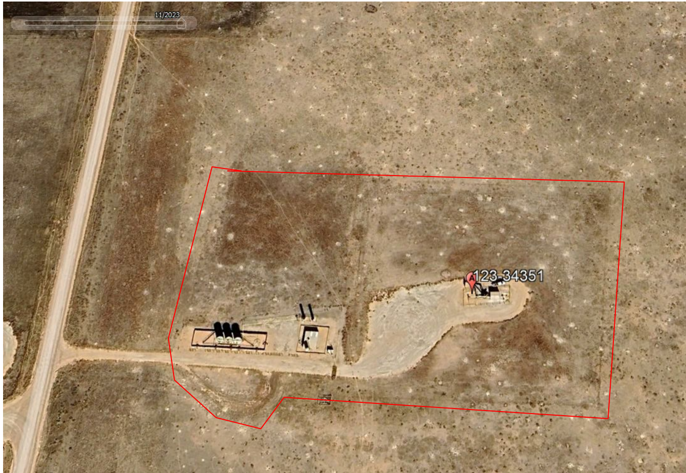
Photo 12. Google Earth aerial imagery taken circa 11/2023. Photo illustrates interim areas that must be reclaimed (red outline). Areas previously used for drilling/completions can be seen inside of the red outline.