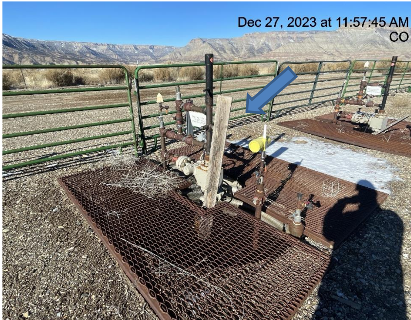
Photo # 889 Wildlife egress on BAT 14B-17-07-95 well cellar ineffective/needs adjustment