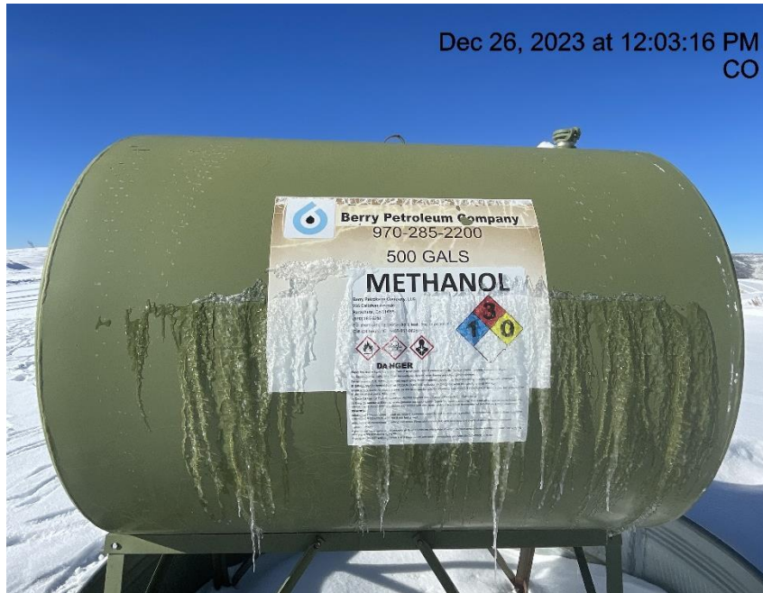
Photo # 790 Methanol tank labeling contains inaccurate /incorrect information