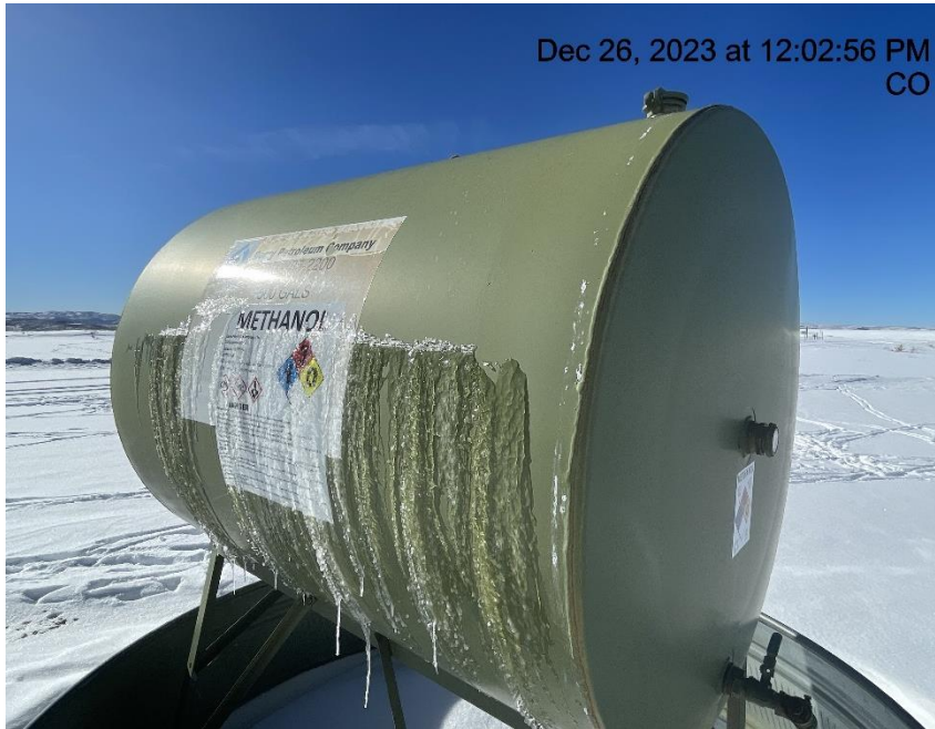
Photo # 788 Methanol tank labeling contains inaccurate /incorrect information