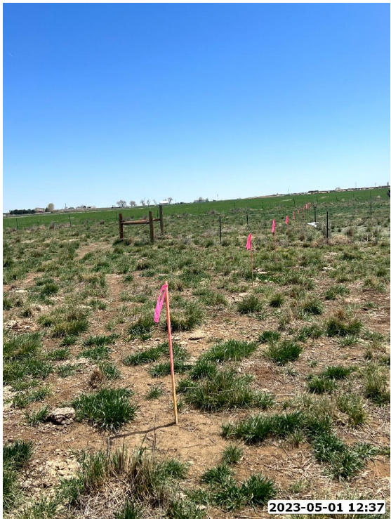
LOCATION PICTURE OF CLOVER 2-29HZ WELL PAD - CAMERA VIEW EAST