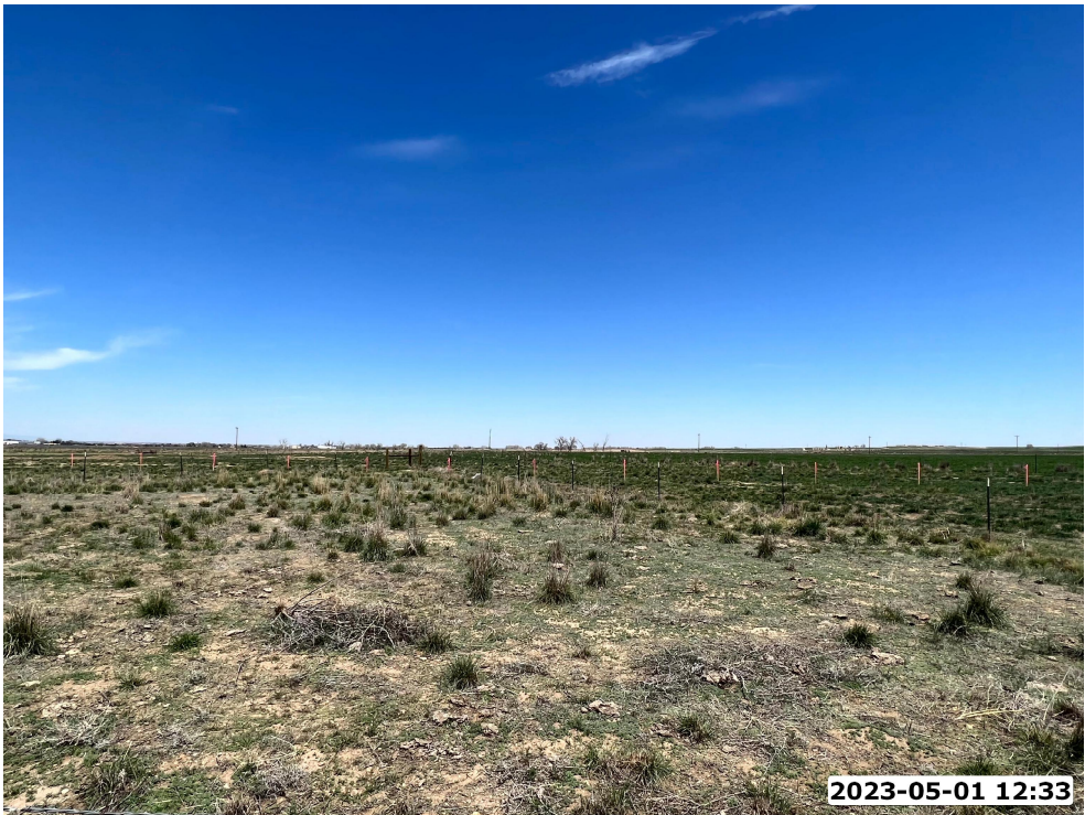
LOCATION PICTURE OF CLOVER 2-29HZ WELL PAD - CAMERA VIEW NORTH

NW1/4 NE1/4 SECTION 29, TOWNSHIP 2 NORTH, RANGE 67 WEST, 6TH P.M., WELD COUNTY, COLORADO