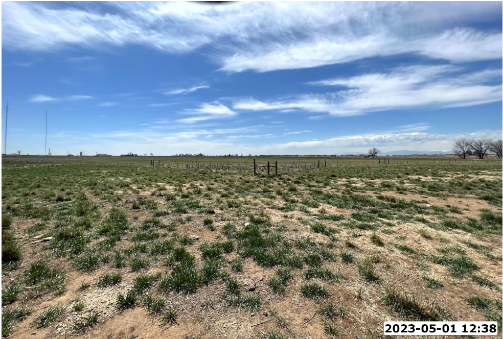
LOCATION PICTURE OF CLOVER 2-29HZ WELL PAD - CAMERA VIEW SOUTH