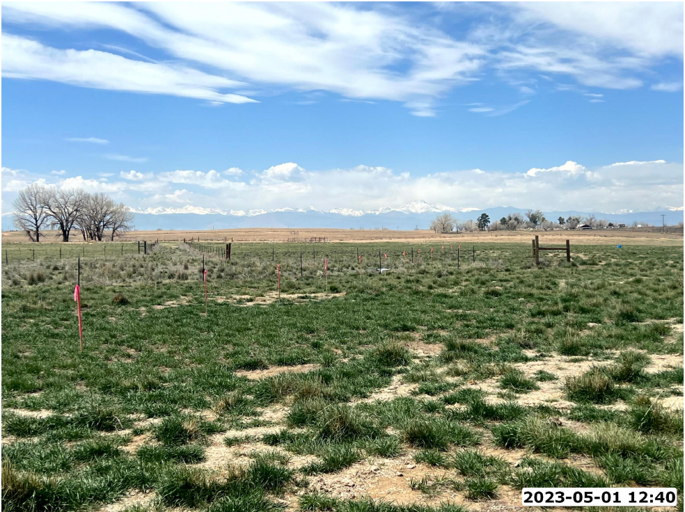
LOCATION PICTURE OF CLOVER 2-29HZ WELL PAD - CAMERA VIEW WEST

K:\ANADARKO\2021-2022_LB_POPPY_T2N_R67W_SEC_29DWG\POPPY_T2N_R67W_SEC_29.dwg, 6/5/2023 2:18:53 PM, sundberg