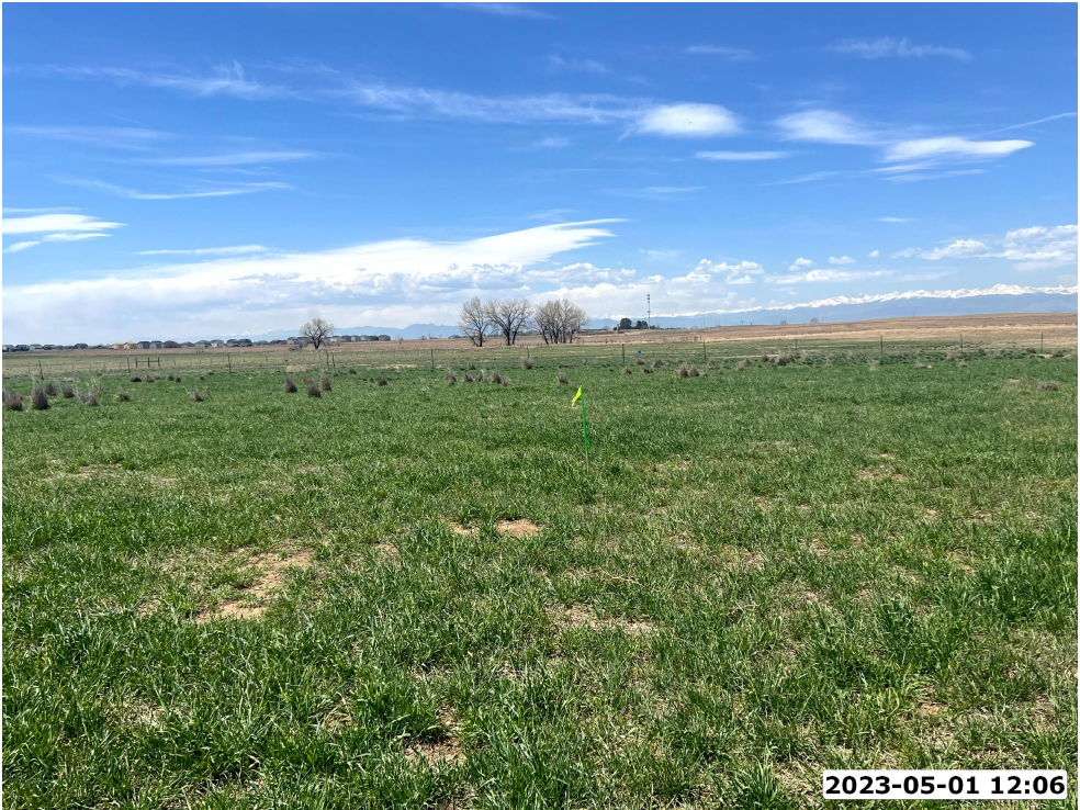
LOCATION PICTURE OF CLOVER 2-29HZ FACILITY PAD - CAMERA VIEW WEST