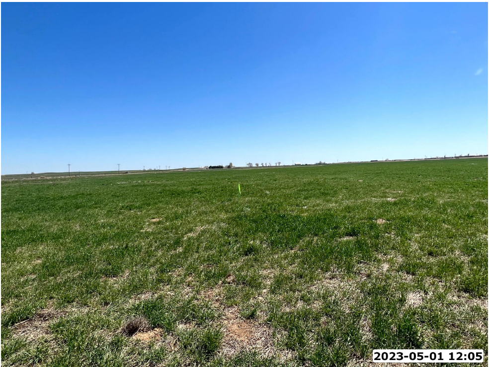
LOCATION PICTURE OF CLOVER 2-29HZ FACILITY PAD - CAMERA VIEW EAST