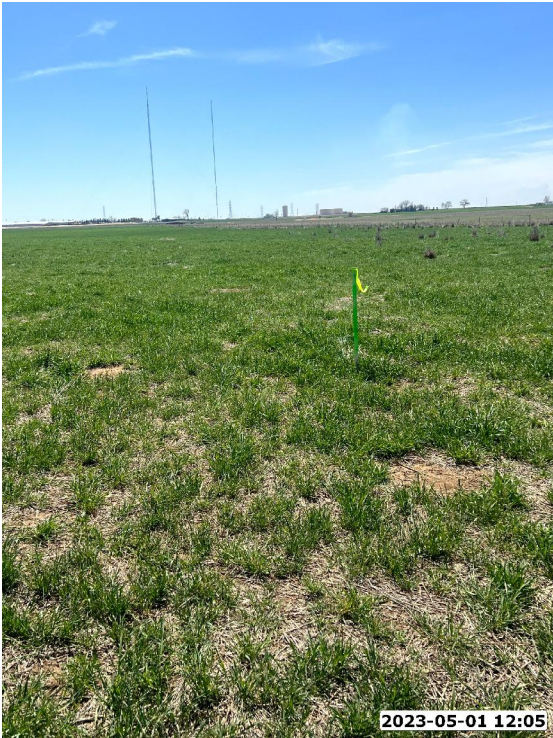
LOCATION PICTURE OF CLOVER 2-29HZ FACILITY PAD - CAMERA VIEW SOUTH