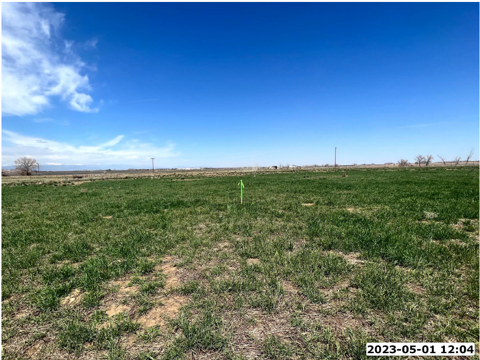
LOCATION PICTURE OF CLOVER 2-29HZ FACILITY PAD - CAMERA VIEW NORTH

NW1/4 NE1/4 SECTION 29, TOWNSHIP 2 NORTH, RANGE 67 WEST, 6TH P.M., WELD COUNTY, COLORADO