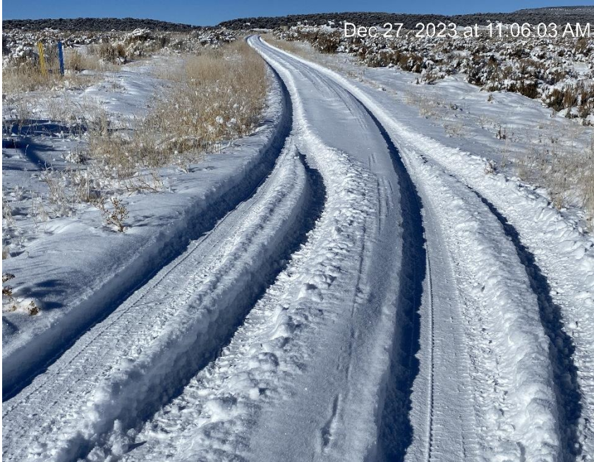
Access road to location