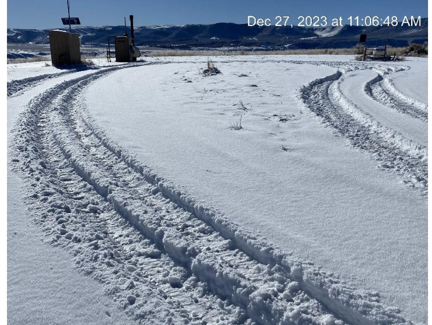
Entrance to locaton