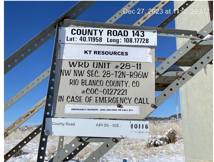
Signs at tank battery