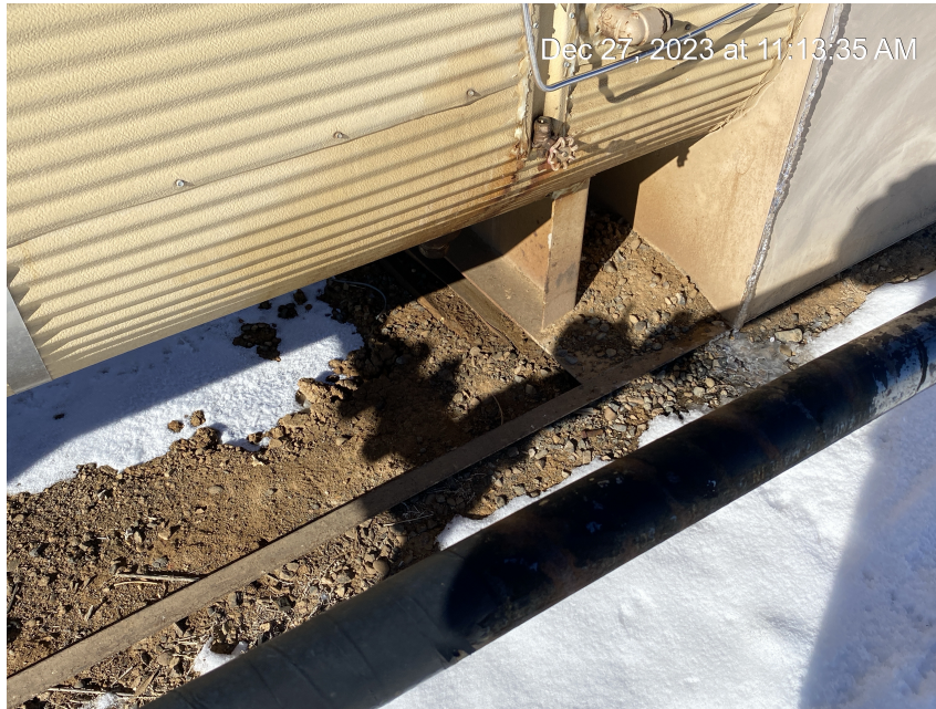
Stained soil below heater treater