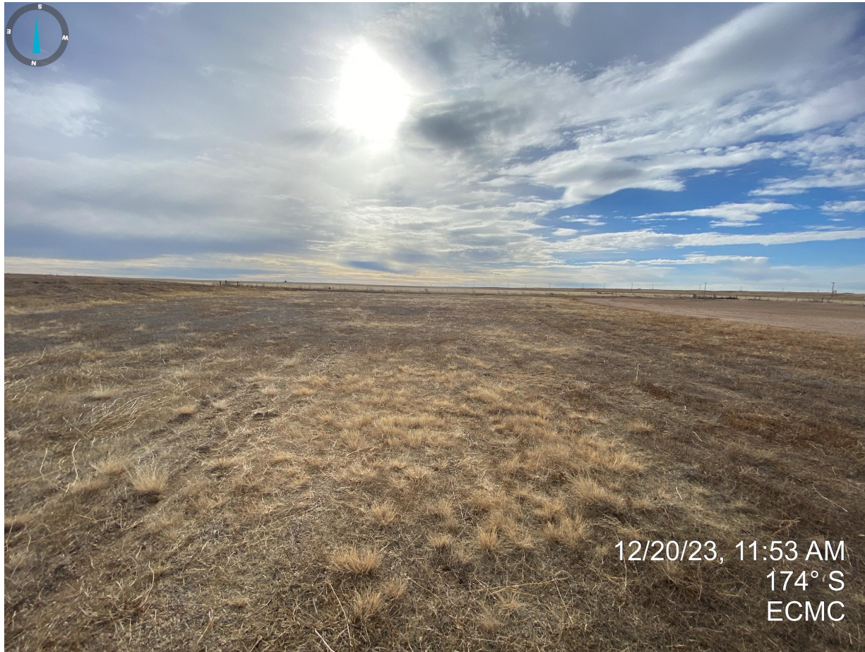
Photo 6. Eastern interim areas, facing south. See comments in Photo 5.