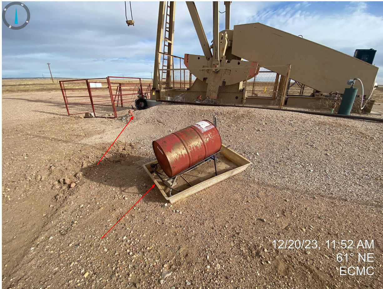
Photo 2. Unused equipment observed near wellhead.