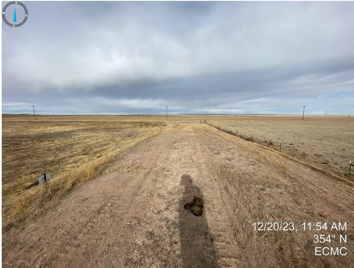
Photo 7. Taken from the center portion of the topsoil stockpile, facing north. The stockpile does not comply with Rule 1002.c as evidenced by bare/exposed soils. Additional BMPs and/or revegetation activities are required in order to comply with Rule 1002.c.