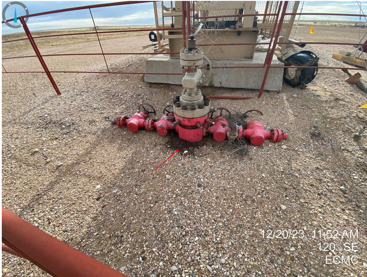
Photo 1. Stained soil observed at wellhead.