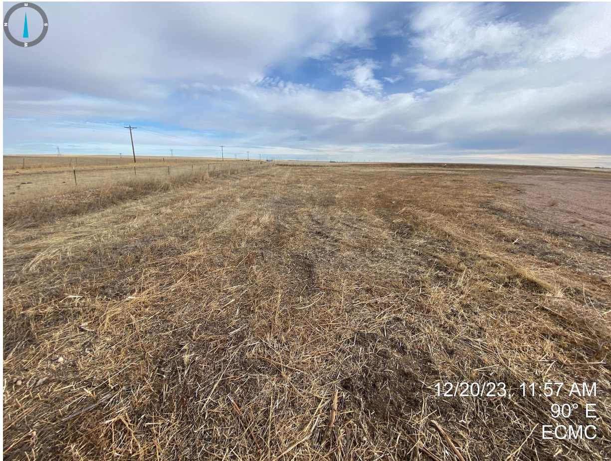
Photo 5. Northern interim areas appear to have been recently mowed. A follow-up inspection will be conducted during the active growing season to verify vegetative compliance with Rule 1003, and is therefore “In-process”.