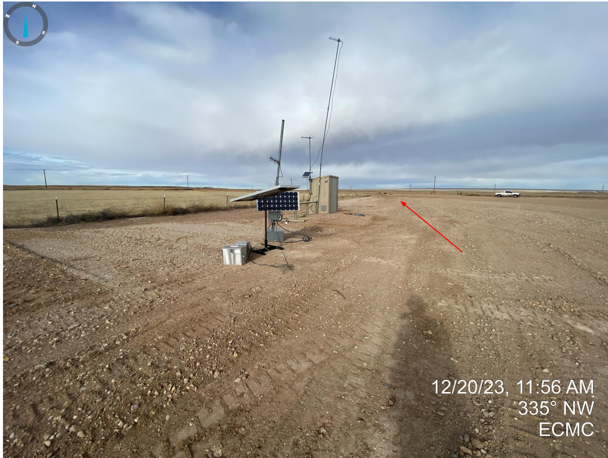
Photo 4. It appears the location is in the process of being decommissioned as the former tank battery equipment has been removed.