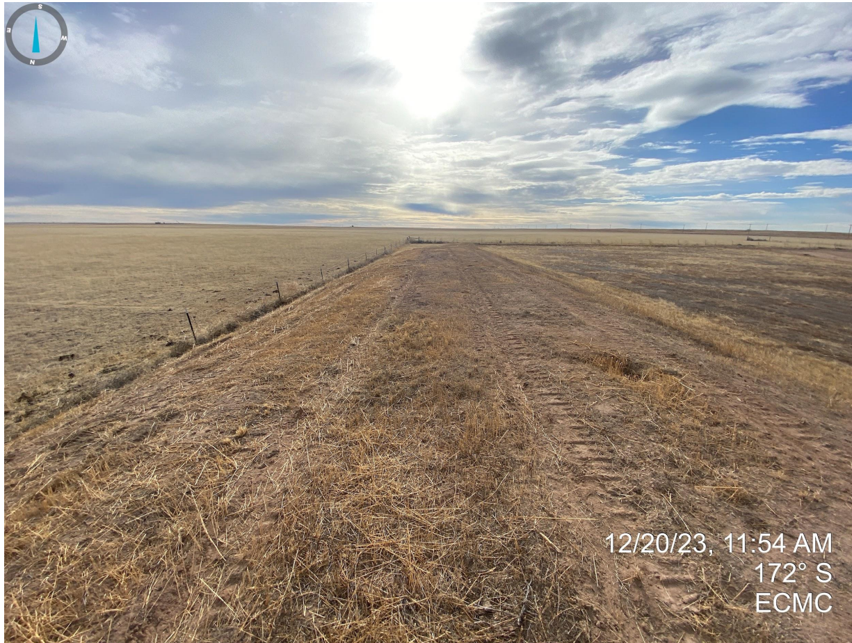
Photo 8. Taken from the center portion of the topsoil stockpile, facing south. See comments in Photo 7.