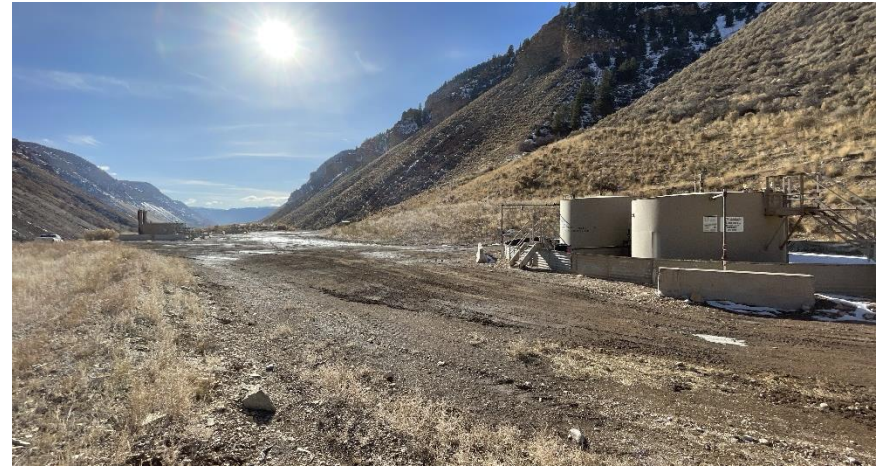
North East corner of location.