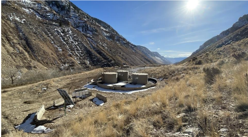
North West corner of location.