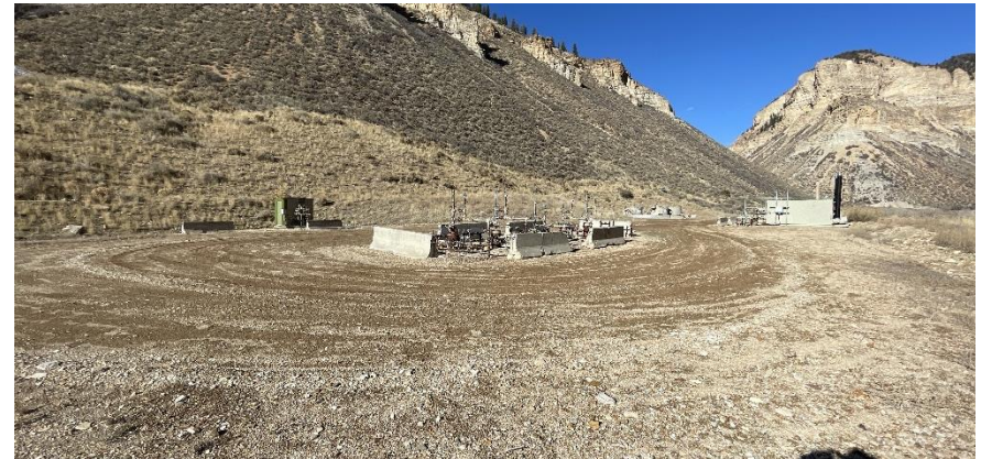
South East corner of location.