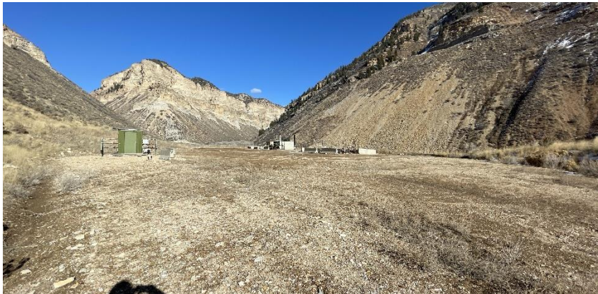
South West corner of location.