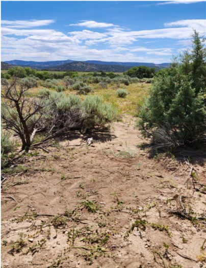
Before Sign removed. After