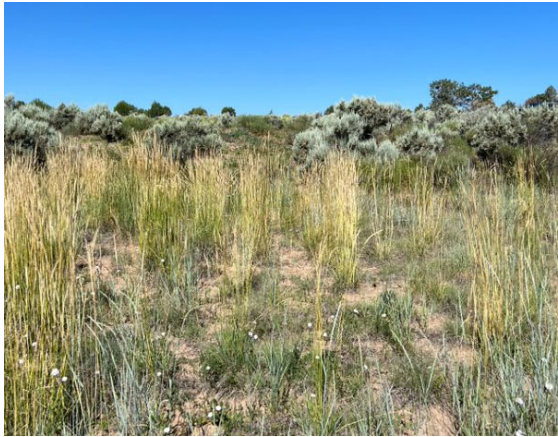
Before T-post removed After