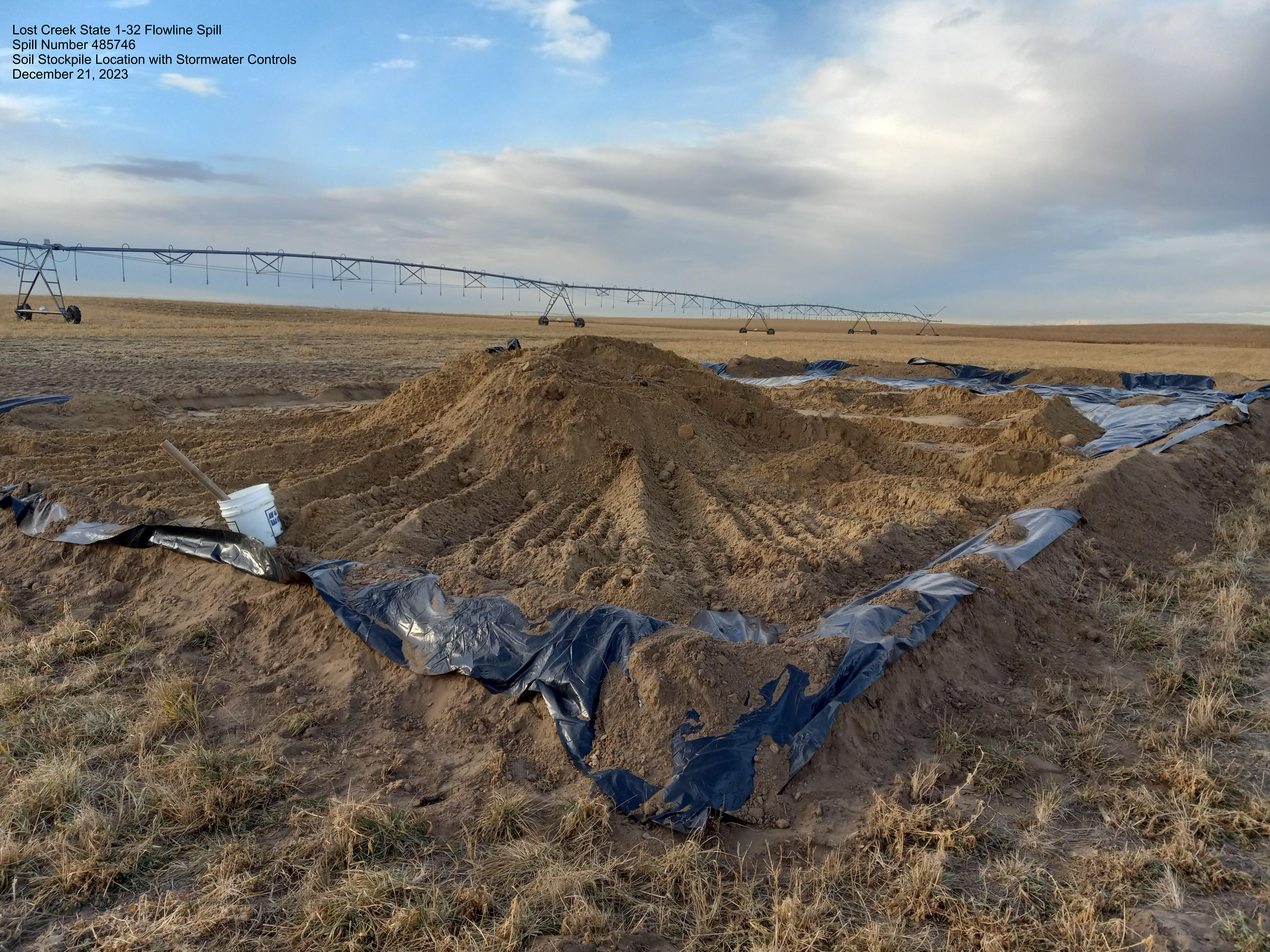
Lost Creek State 1-32 Flowline Spill Spill Number 485746 Soil Stockpile Location with Stormwater Controls December 21, 2023