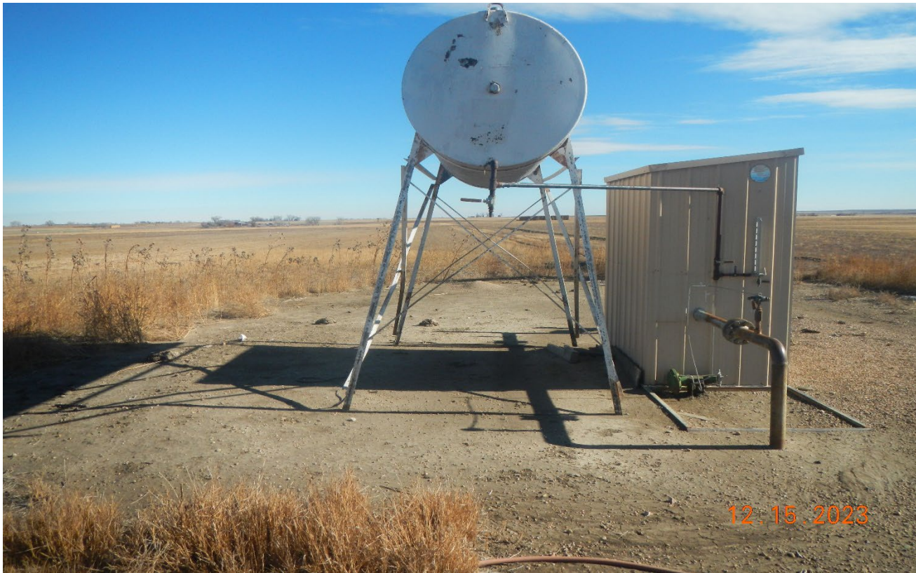
Photo 4. There is no secondary containment of the elevated metal container.