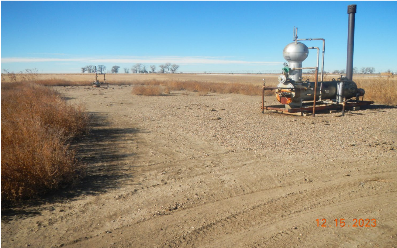
Photo 6. Facing northwest at the location. The weeds around the location need to be controlled.