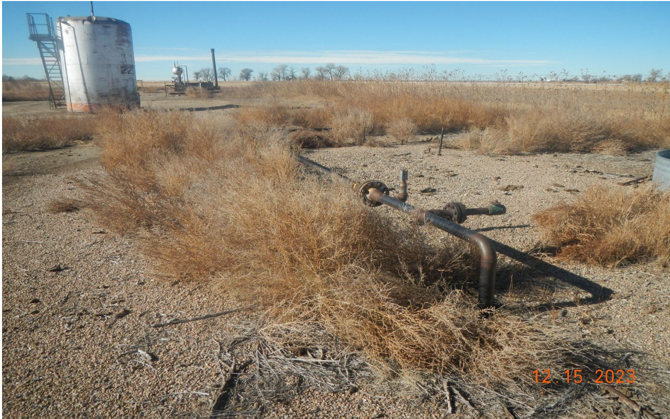
Photo 2. Facing west toward the location. There are tall undesirable weeds at the location that need to be controlled and removed.