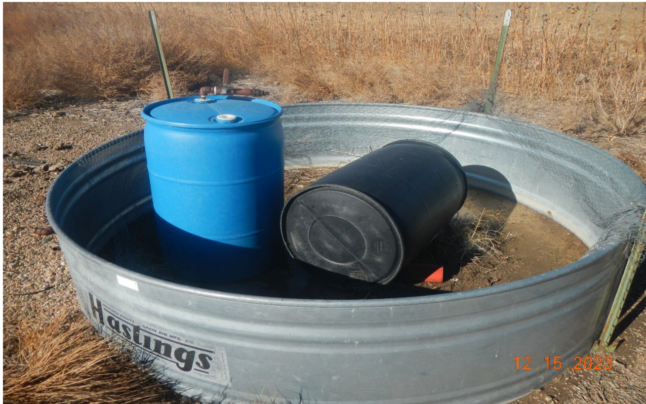
Photo 3. There are plastic drums with no labeling and one appears to be empty and not in use.