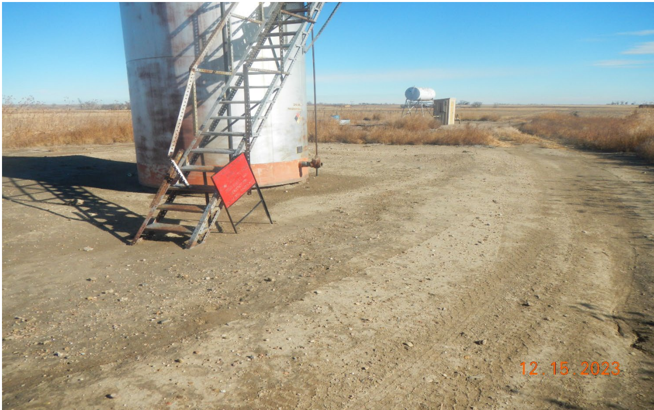
Photo 5. Facing toward the tank battery. There is insufficient secondary containment to contain a spill. The sign at the tank does not reflect the current Operator sand is faded