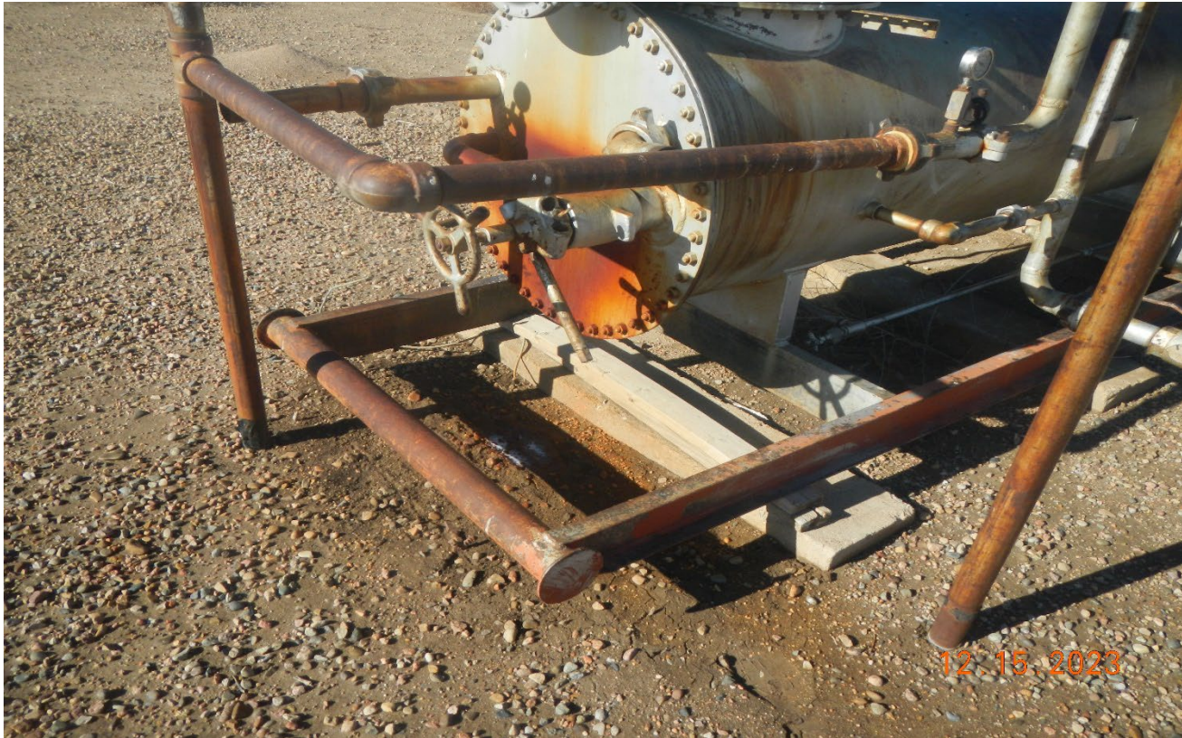
Photo 7. There is a dripping leak at the separator and stained soils.