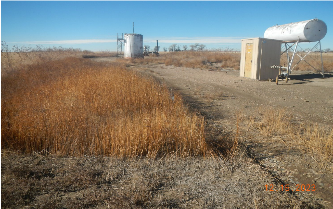
Photo 1. Facing west toward the location. There are tall undesirable weeds at the location that need to be controlled and removed.