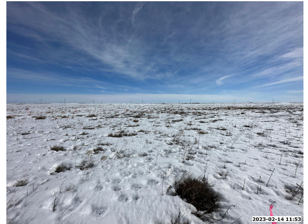
LOCATION PICTURE OF EAST STREET 14-22HZ WELL PAD - CAMERA VIEW EAST