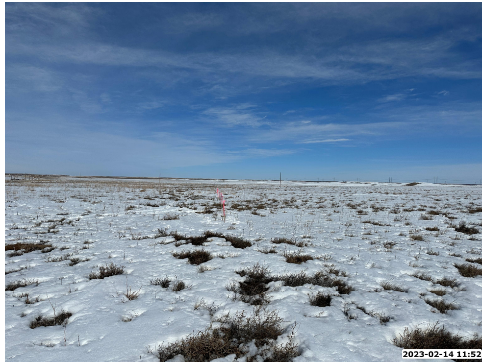
LOCATION PICTURE OF EAST STREET 14-22HZ WELL PAD - CAMERA VIEW NORTH

SW1/4 SE1/4 & SE1/4 SW1/4 SECTION 22, TOWNSHIP 3 NORTH, RANGE 63 WEST, 6TH P.M., WELD COUNTY, COLORADO