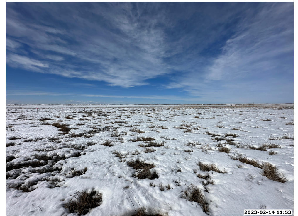
LOCATION PICTURE OF EAST STREET 14-22HZ WELL PAD - CAMERA VIEW WEST

K:\AMDRK\2017\2017_197_CERVL_BANCH_TN_R63W\DWG\09_EAST STREET\09_EAST STREET.dwg, 3/22/2023 11:23:45 PM, sundberg