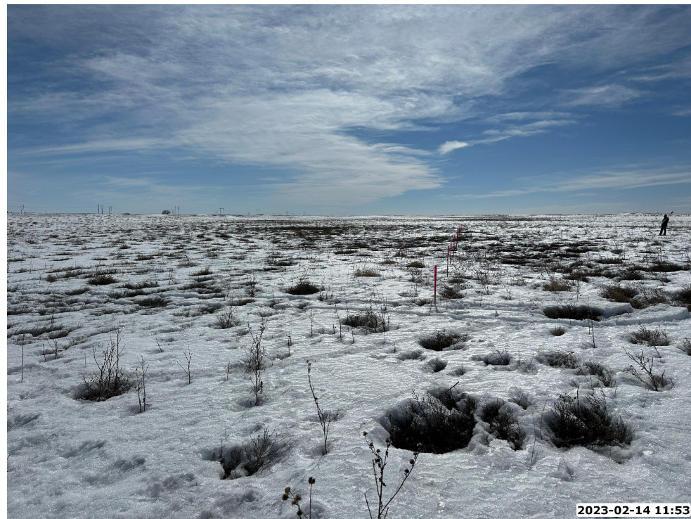
LOCATION PICTURE OF EAST STREET 14-22HZ WELL PAD - CAMERA VIEW SOUTH