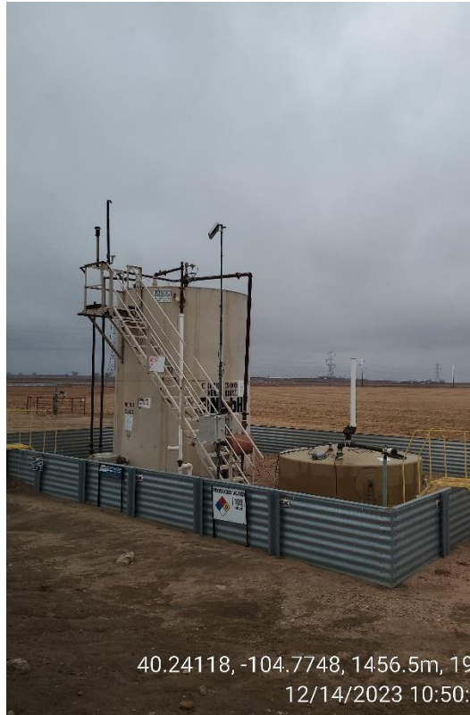
Photo 2 Battery