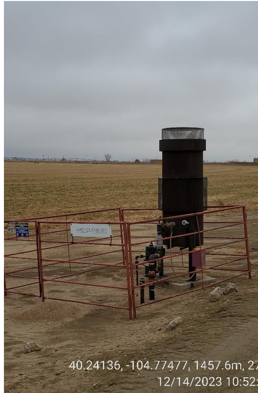
Photo 5 ECD