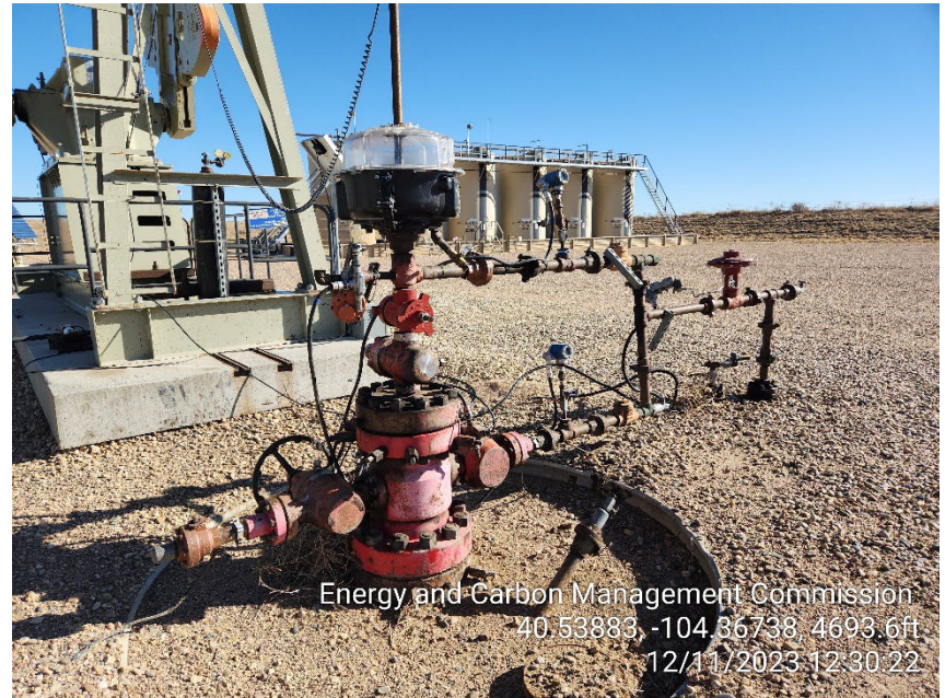
Photo 4 – 7-62-31 2H Wellhead