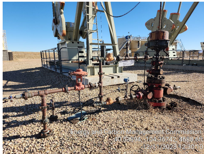
Photo 2 – 7-62-30 2H Wellhead