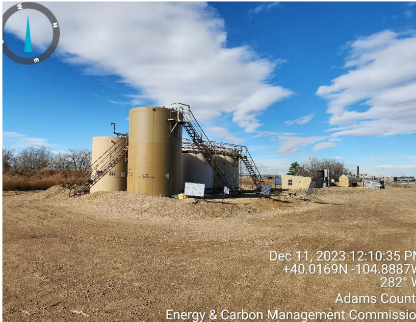
Photo 5 tank battery and equipment