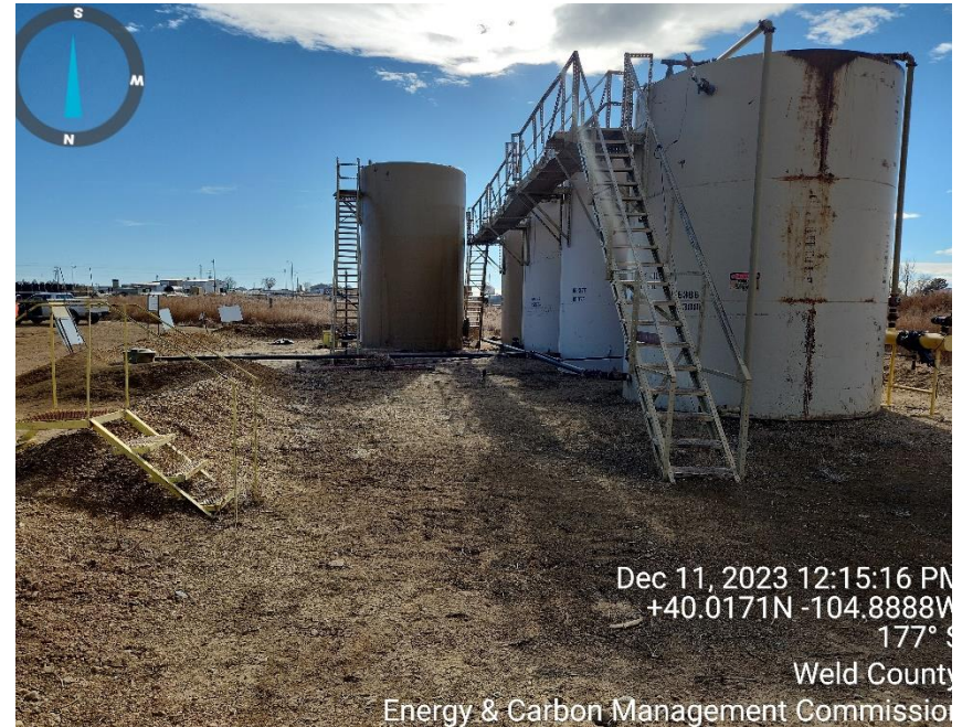
Photo 6 tank battery