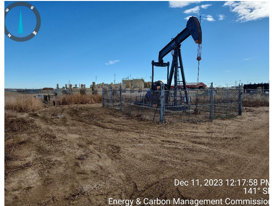
Photo 2 well head and equipment