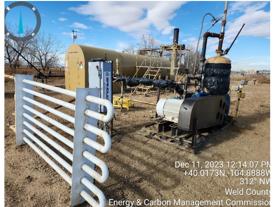
Photo 4 production equipment and compressor