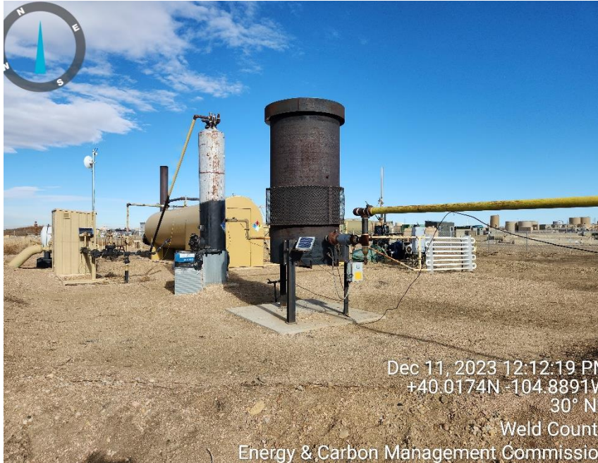
Photo 3 production equipment