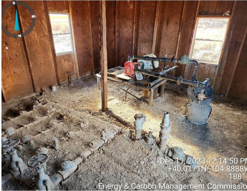
Photo 7 valve manifold and circulating pump equipment