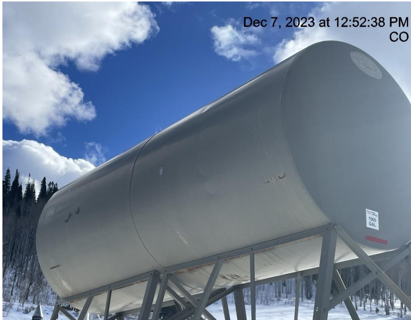
Photo # 8848 Methanol tank improperly labeled/labeled with inaccurate information/lacks required information