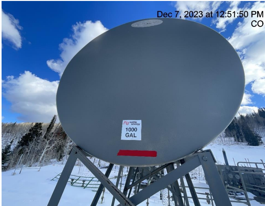
Photo # 8850 Methanol tank improperly labeled/labeled with inaccurate information/lacks required information