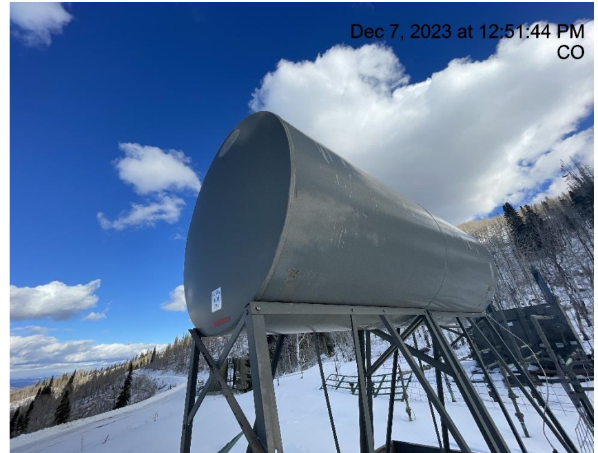
Photo # 8847 Methanol tank improperly labeled/labeled with inaccurate information/lacks required information