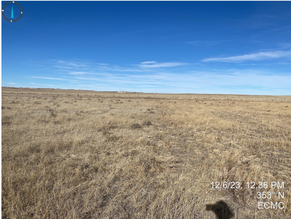
Photo 8. Western portion of the interim areas. The interim areas appear to be progressing towards Rule 1003 standards with evidence of desirable perennial vegetation observed. A follow-up inspection will be conducted at a future date to ensure vegetative compliance during the active growing season.