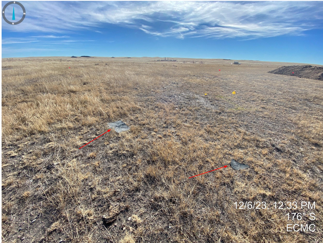
Photo 6. Trash and debris observed within the interim areas, east side of production areas.