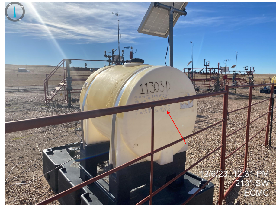
Photos 1 & 2. Day tanks at wellheads do not have adequate signage/labels.