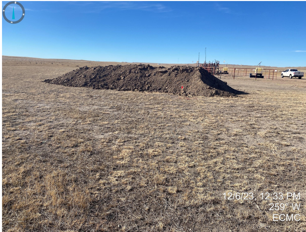
Photo 5. Soil stockpile is not marked/signed and does not have adequate stormwater controls measures as the unconsolidated material is susceptible to wind and water erosion in its current state.