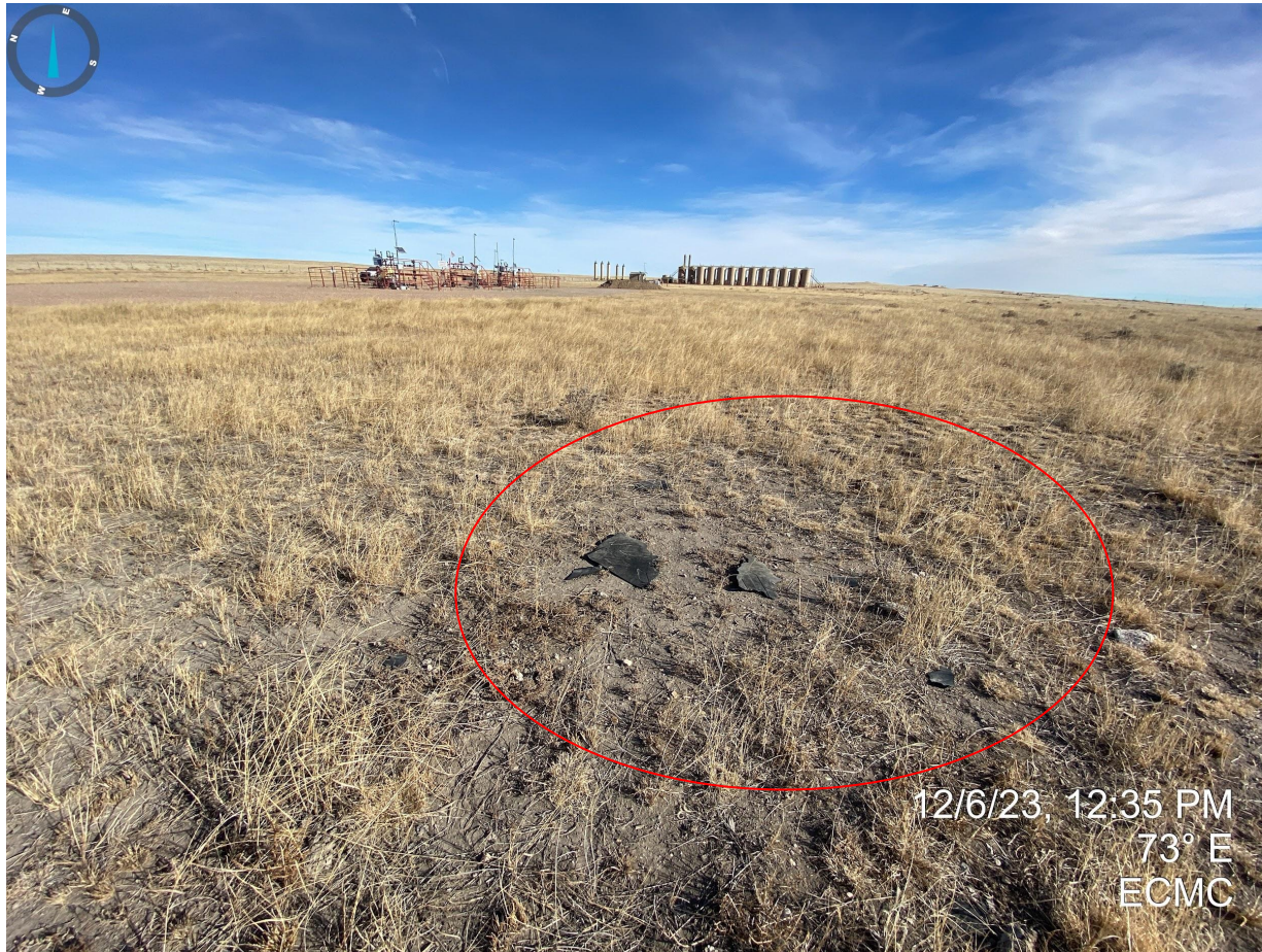
Photo 7. Trash and debris observed within the interim areas, southwest of the wells.