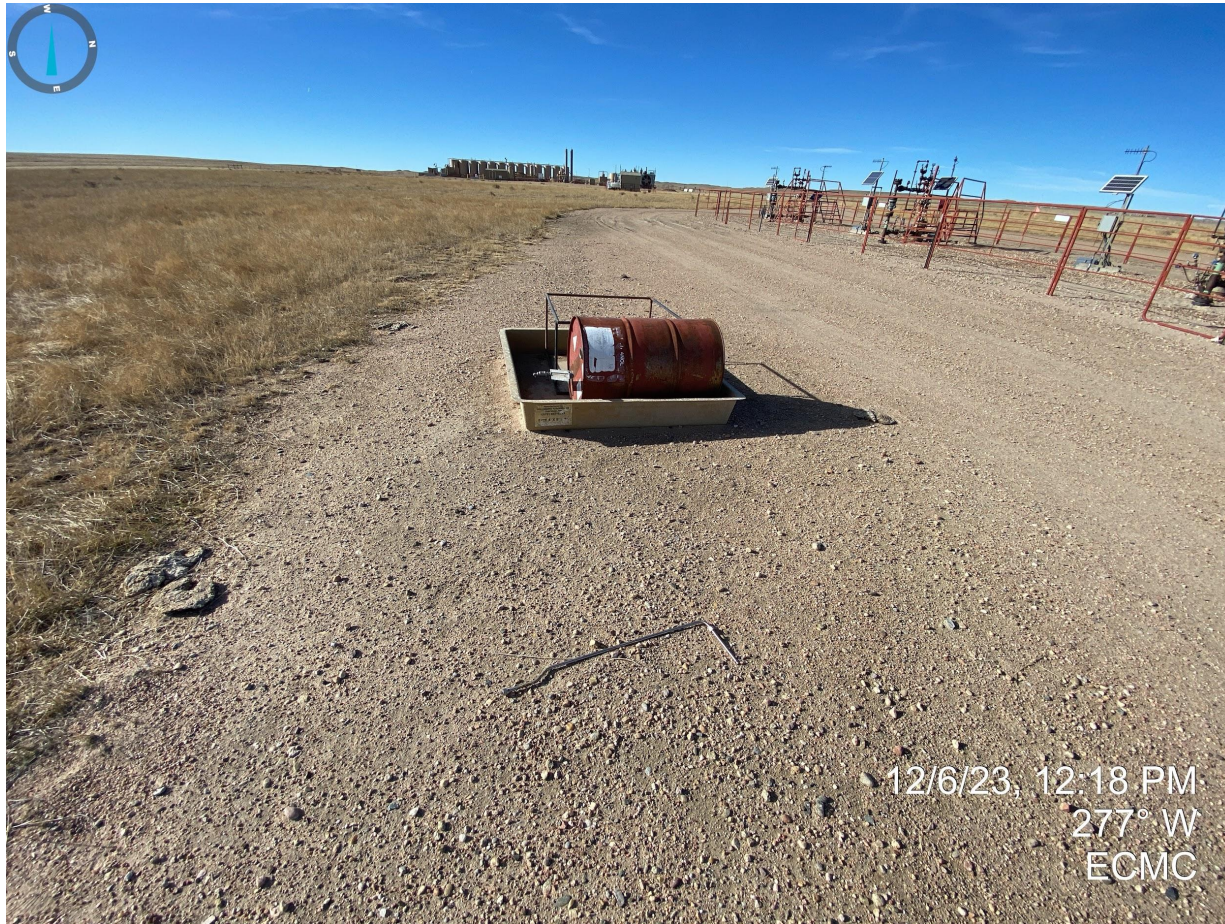
Photo 2. Unused equipment observed on the south side of the production areas.