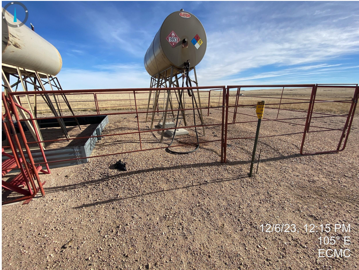
Photo 5. Earthen berms/secondary containment does not appear to be adequate to contain 150% of tank volume and requires repair/replacement.