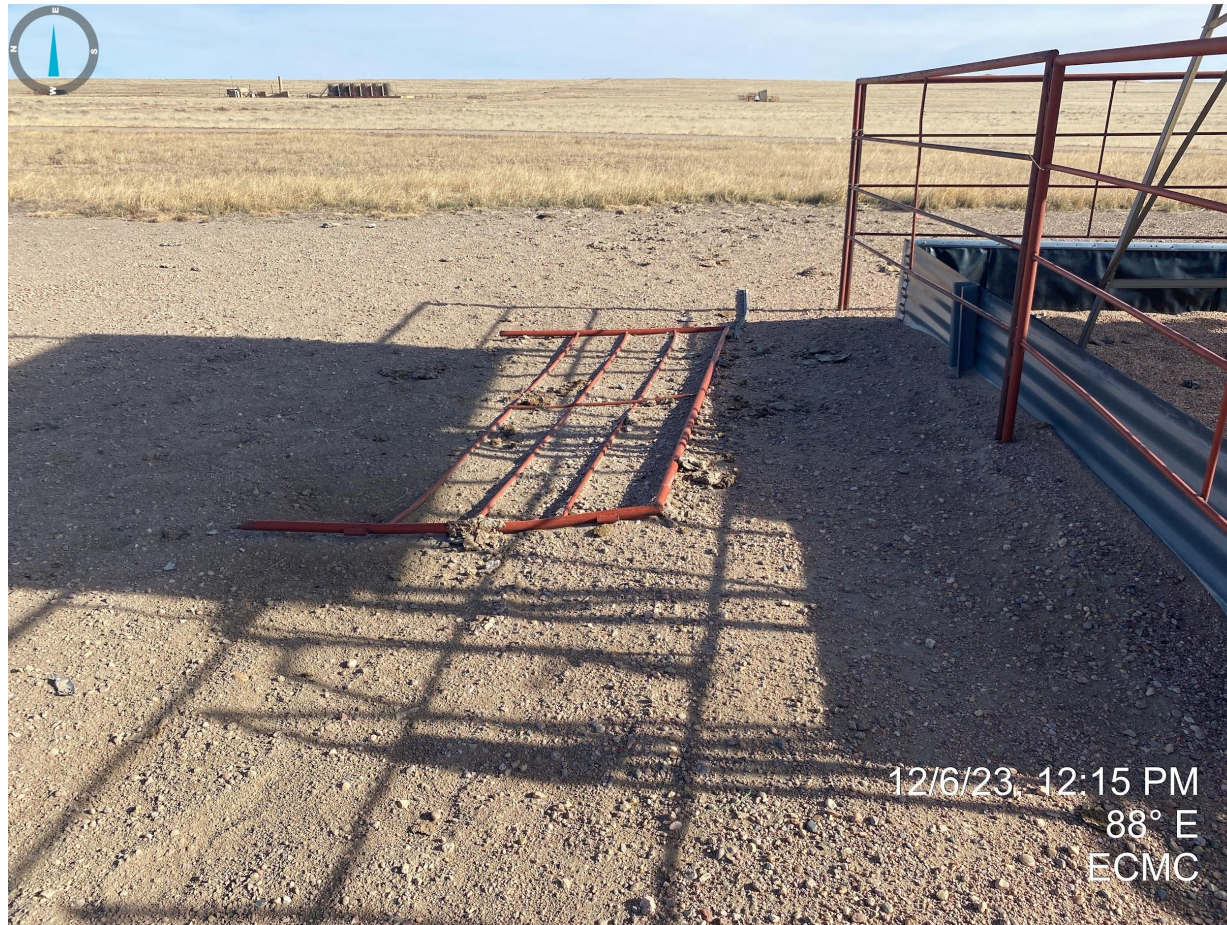
Photo 1. Cattle panel located on the east side of the production areas does not appear to be in use.