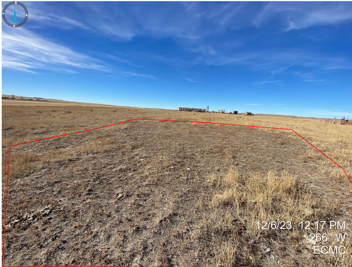
Photo 6. Southern portions of the interim areas are experiencing non-uniform vegetation cover resulting in bare soil and undesirable vegetation (e.g. russian thistle). Additional reclamation activities are required to stabilize the bare soil.