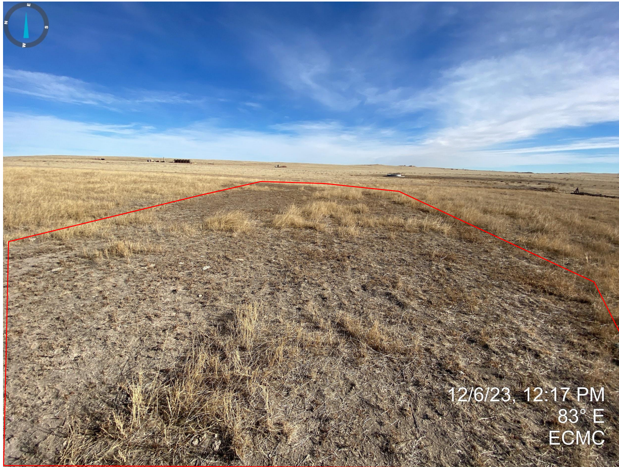
Photo 7. Continued from Photo 6, facing east.