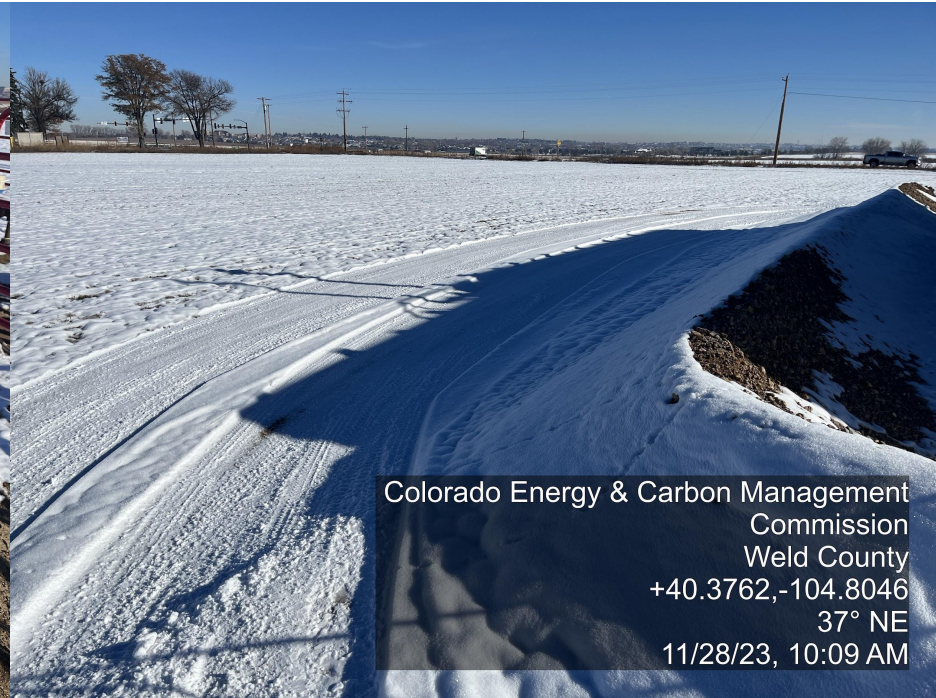
Photo 6. The photo was taken from the North end of the location facing Northeast. The photo illustrates a path being driven