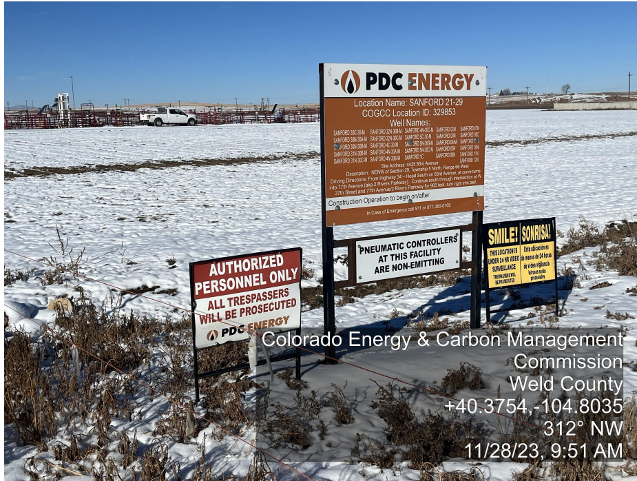
Photo 1. The photo was taken at the entrance to the location facing Northwest. The photo illustrates the operator signage.