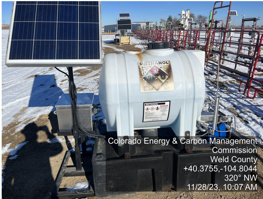
Photo 5. The photo was taken from the well location facing Northwest. The photo illustrates the tank signage needs replacing.