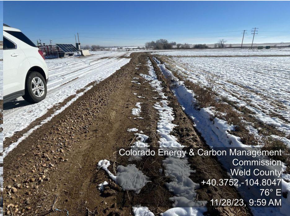
Photo 2. The photo was taken from the well location facing East. The photo illustrates the tertiary stormwater ditch surrounding the well location.