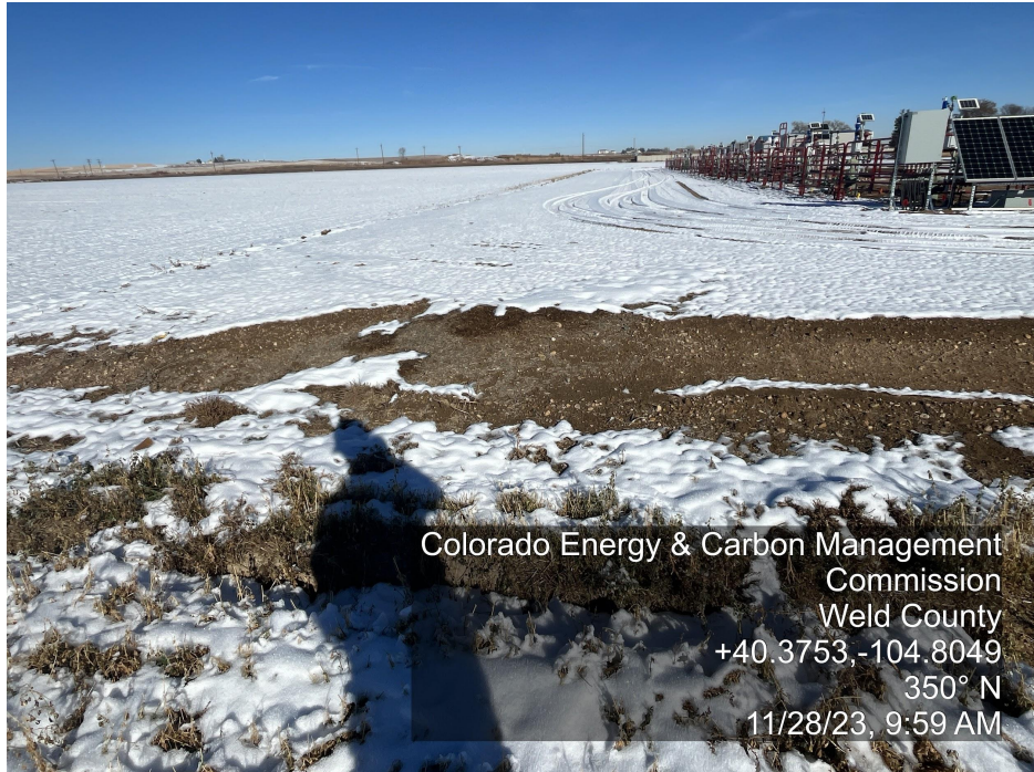
Photo 3. The photo was taken from the well location facing North. The photo illustrates the western string of producing wells.