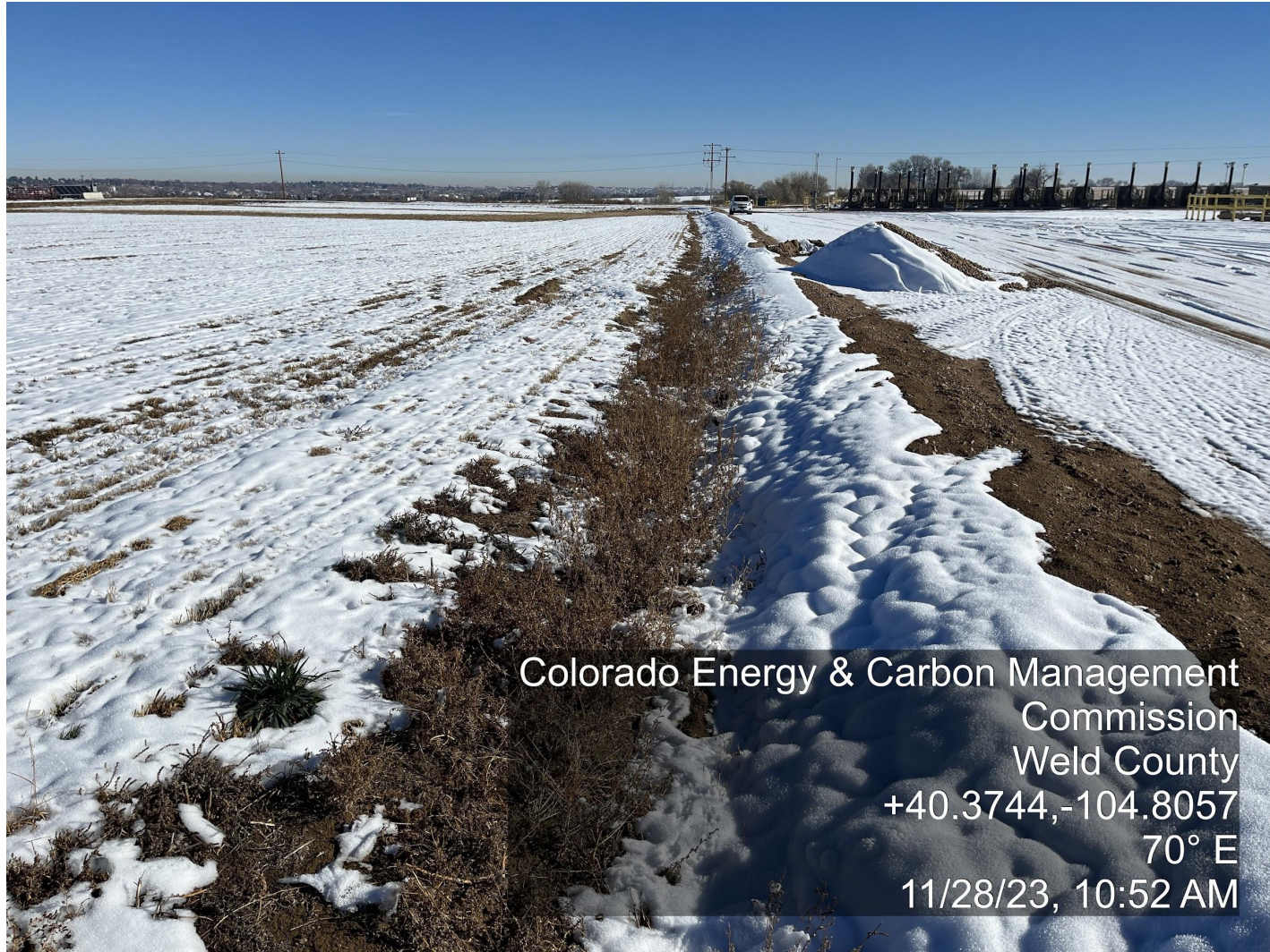
Photo 9. The photo was taken from the production facility facing East. The photo illustrates tumbleweeds growing in the ditch.