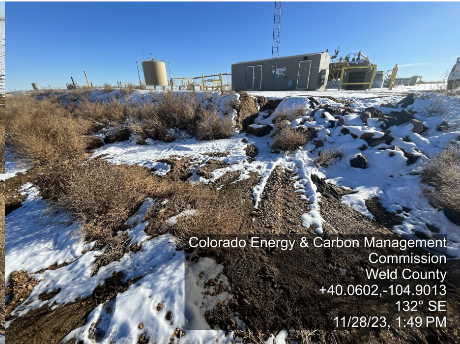
Photo 4. The photo was taken North of the tank battery location facing Southeast. The photo illustrates the erosion issue in photo 3 from the other side.