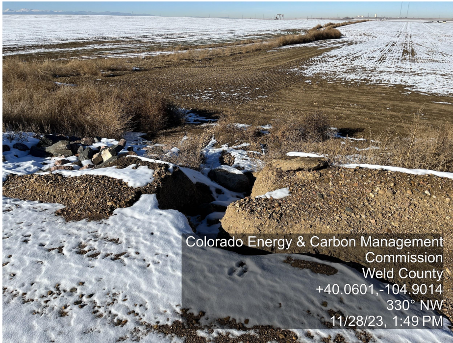
Photo 3. The photo was taken at the tank battery location facing Northwest. The photo illustrates rill erosion carrying sediment offsite.