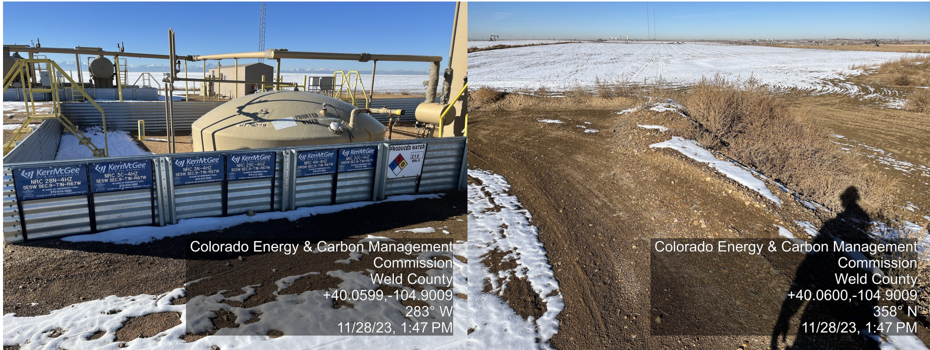
Photo 1. The photo was taken at the tank battery location facing West. The photo illustrates the operator well signs.