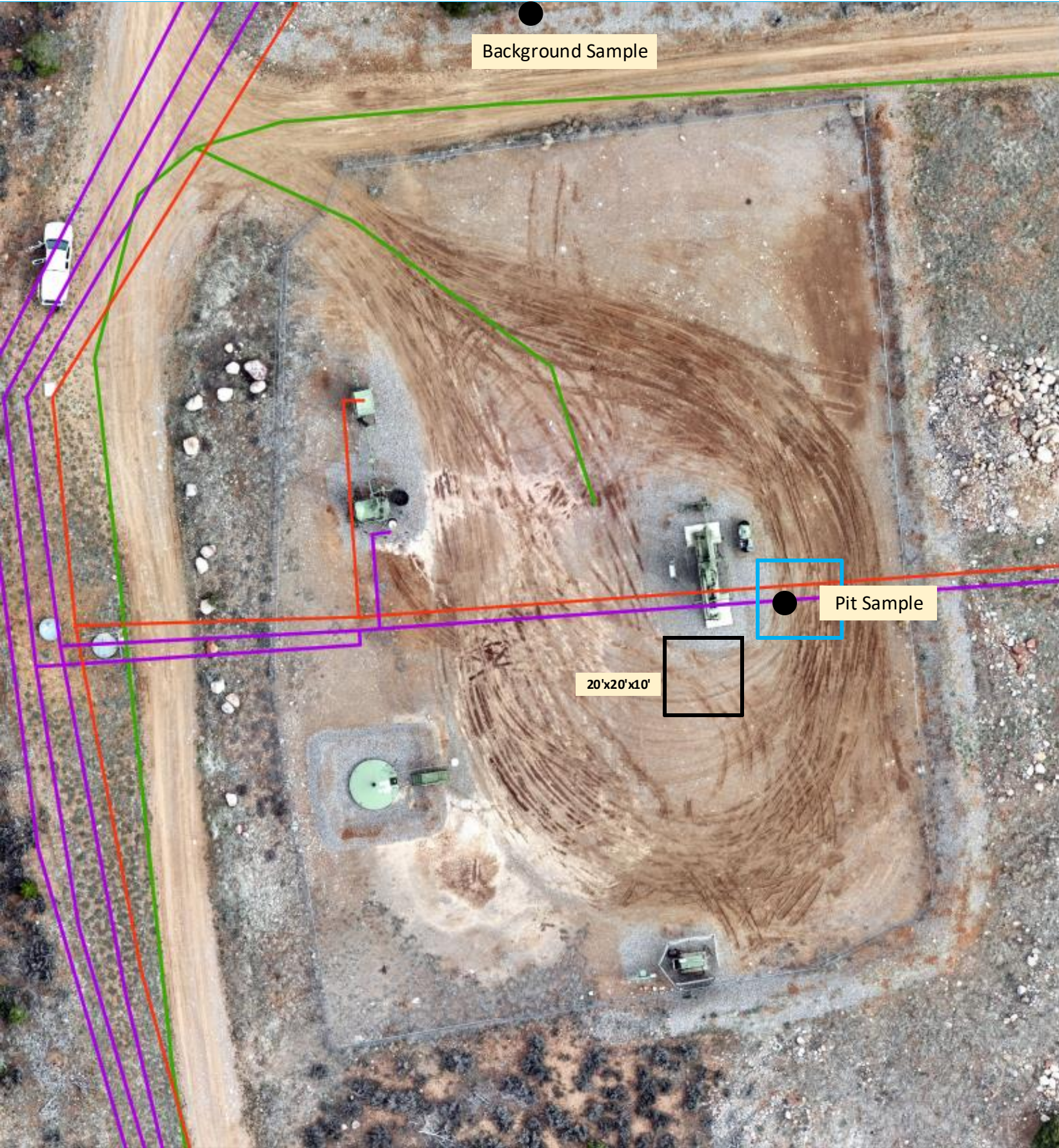
Koshak BU G1 Figure 1 Site Map