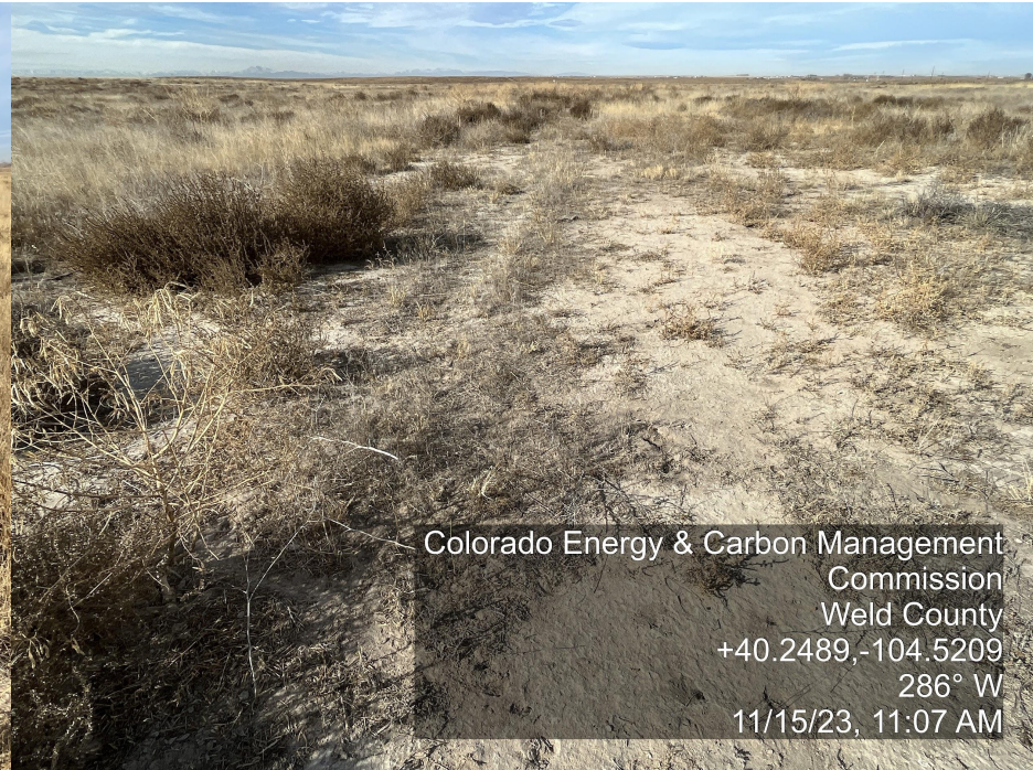
Photo 6. The photo was taken from the access road facing West. The photo illustrates the access road and flowline have large bare patches of soil.