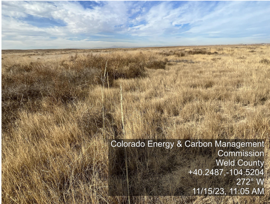
Photo 5. The photo was taken from the well location facing West. The photo illustrates the access road and flowline are dominated by russian thistle.