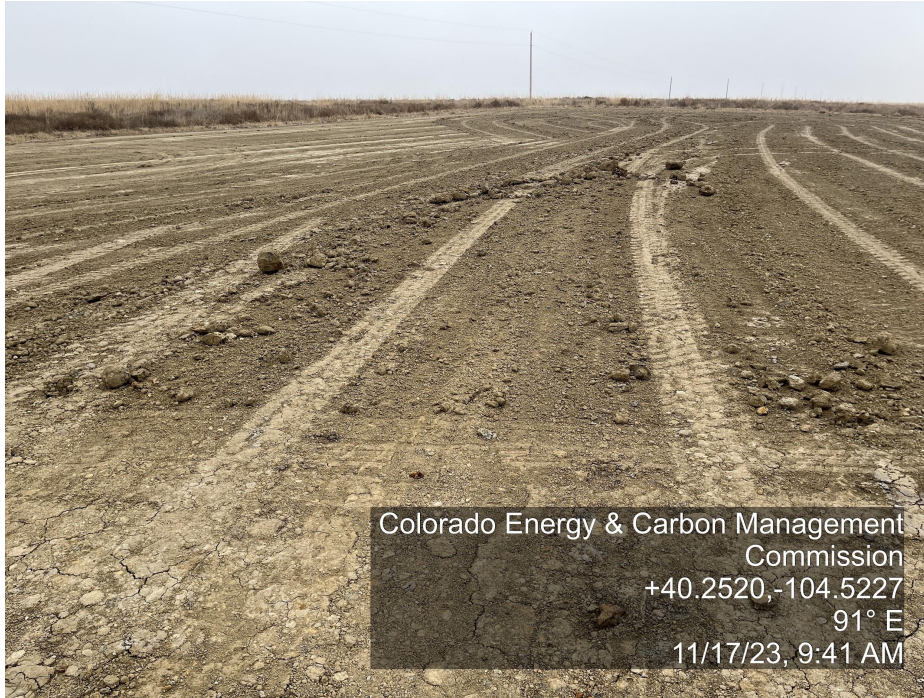
Photo 7. The photo was taken from the tank battery location facing East. The photo illustrates the location has been graded.