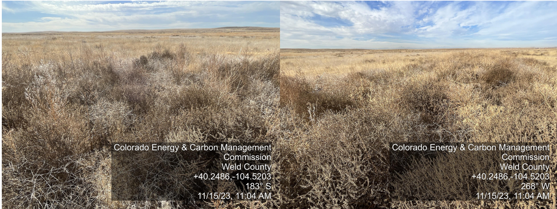
Photo 3. The photo was taken from the well location facing South. Refer to the comment for photo 1.