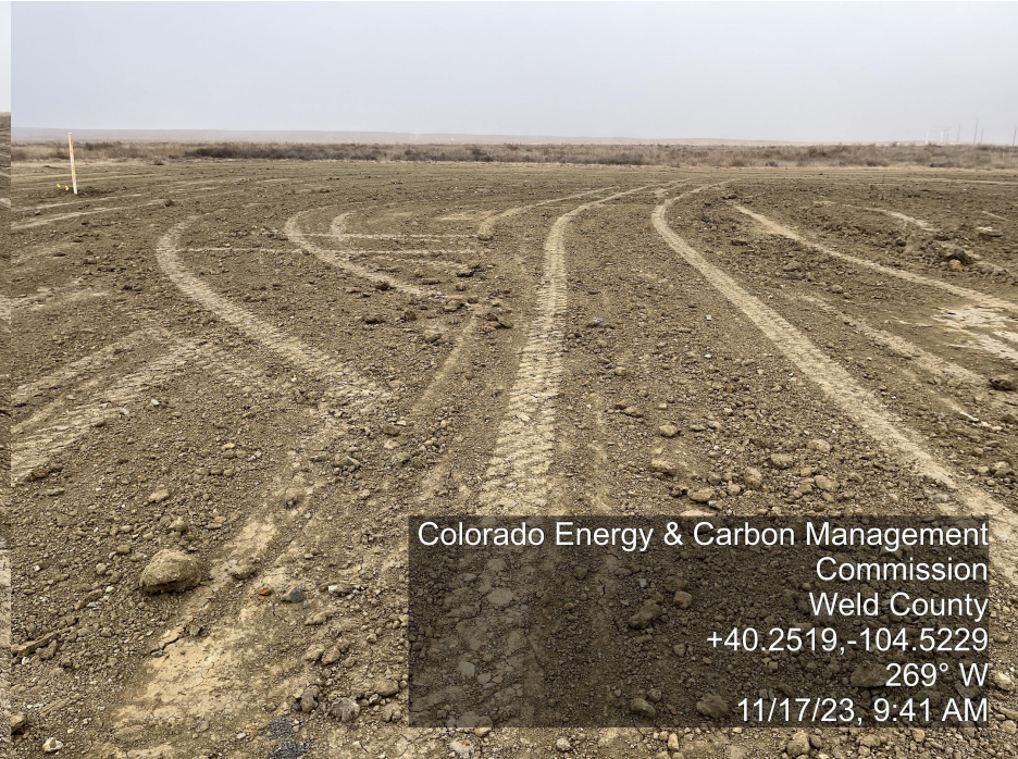
Photo 8. The photo was taken from the tank battery location facing West. Refer to the comment for photo 7.