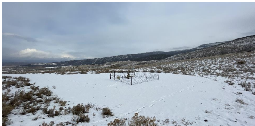
South West corner of location.