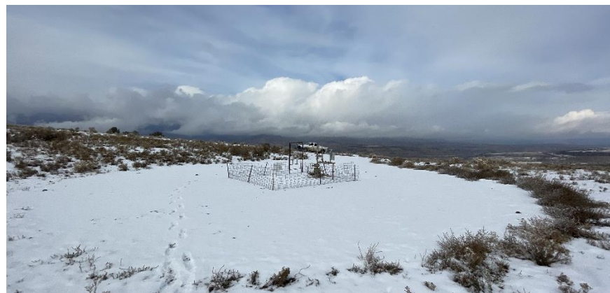
South East corner of location.