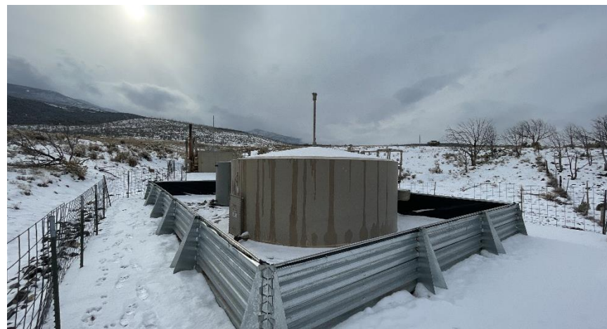
North East corner of location.