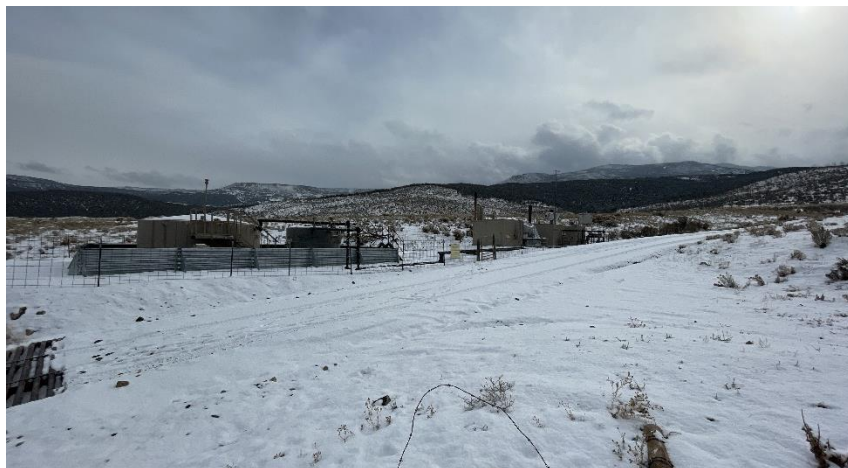
North West corner of location.