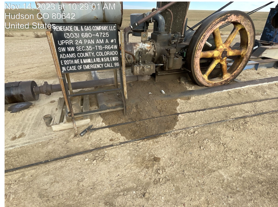
Photo 6. Photo of stained soil under wellhead engin. Photo taken facing north.

Nov 14, 2023 at 10:29:01 AM Hudson CO 80642 United States