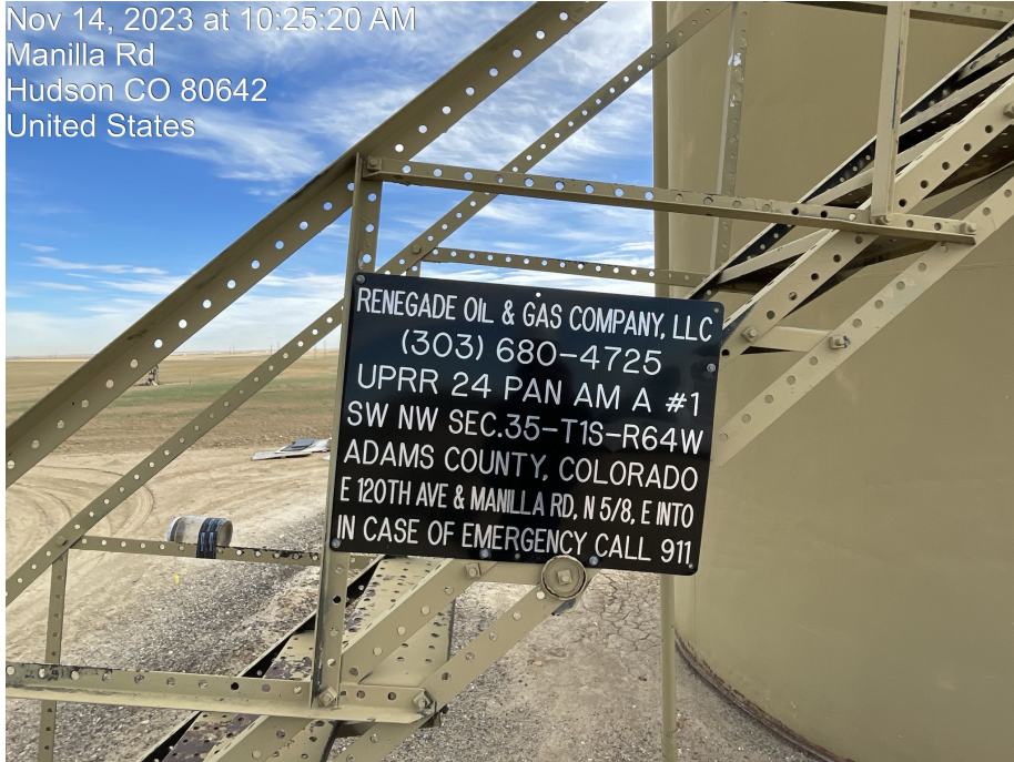
Photo 1. Photo taken of location sign at wellhead, facing east.

Nov 14, 2023 at 10:25:20 AM Manilla Rd Hudson CO 80642 United States