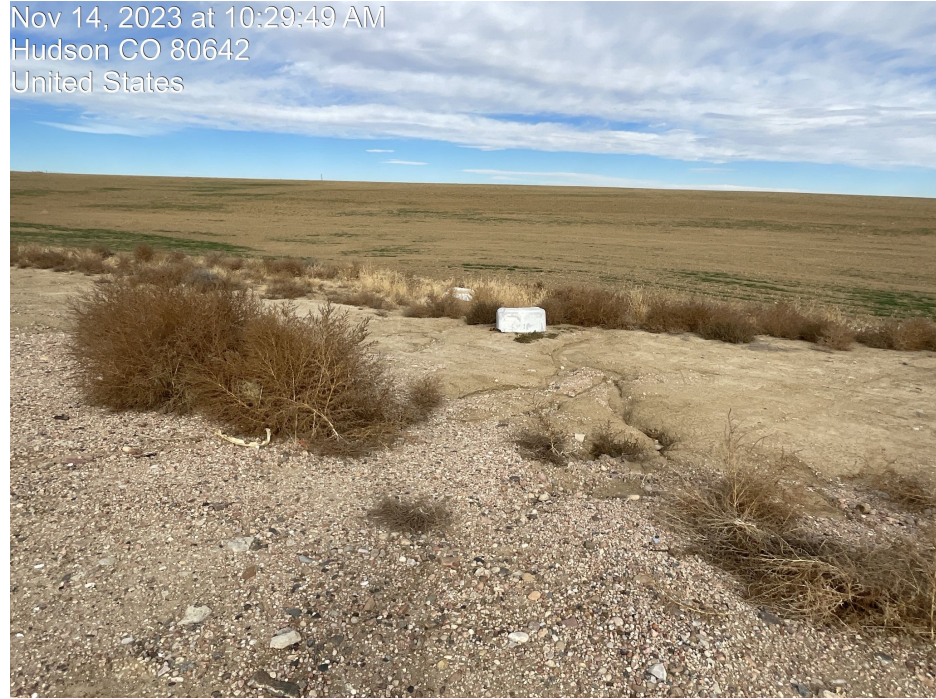
Photo 9. Photo taken of stormwater erosion along south side of well pad. Photo taken facing west.

Nov 14, 2023 at 10:29:49 AM Hudson CO 80642 United States