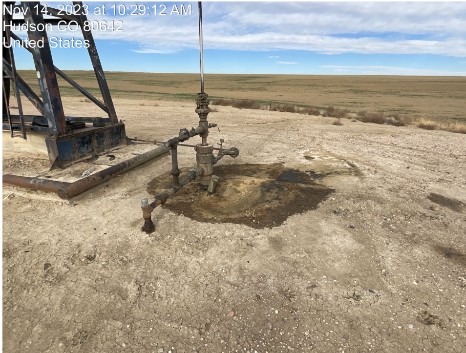
Photo 7. Photo taken of staining around wellhead. Photo taken facing north.

Nov 14, 2023 at 10:29:12 AM Hudson CO 80642 United States