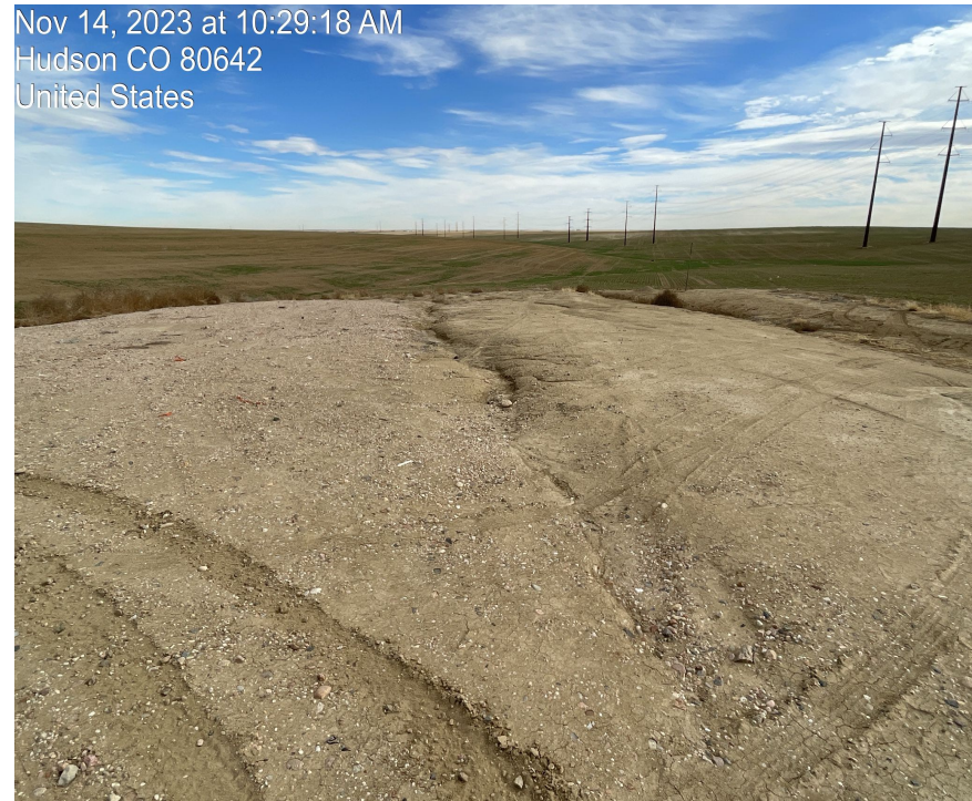
Photo 8. Photo taken of erosion from stormwater on well pad. Photo taken facing east.

Nov 14, 2023 at 10:29:18 AM Hudson CO 80642 United States