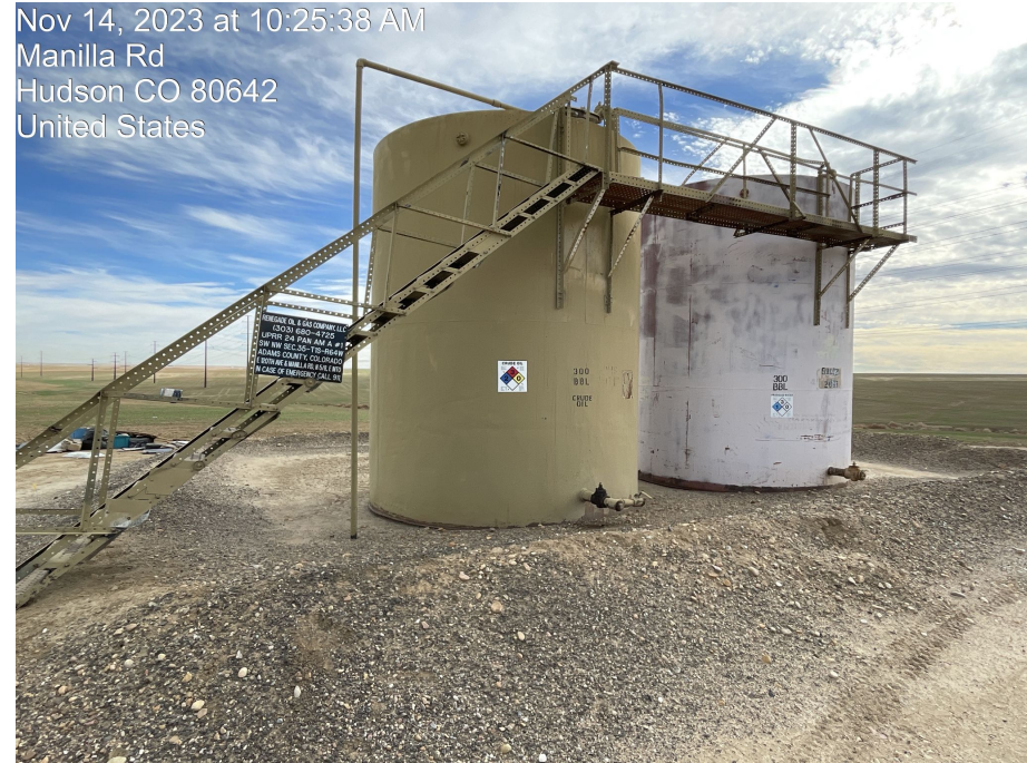
Photo 2. Photo taken of tank battery Photo taken facing southeast.

Nov 14, 2023 at 10:25:38 AM Manilla Rd Hudson CO 80642 United States