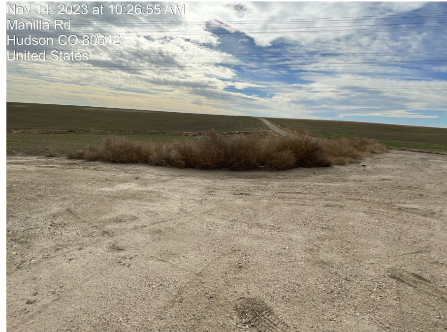
Photo 4. Photo taken of weeds (kochia) on site. Photo taken facing south.

Nov 14, 2023 at 10:26:55 AM Manilla Rd Hudson CO 80642 United States