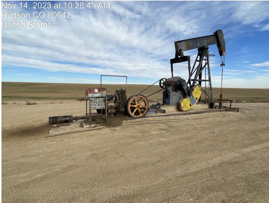
Photo 5. Photo taken of wellhead. Photo taken facing northeast.

Nov 14, 2023 at 10:28:49 AM Hudson CO 80642 United States