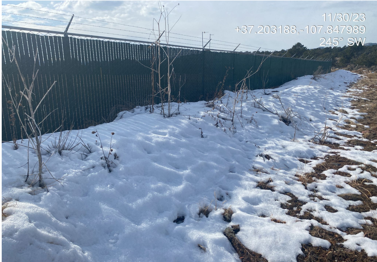
Photo 3. Interim vegetation was not fully assessed due to snowy conditions.