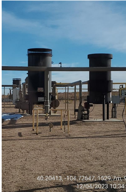
Photo 5 ECD