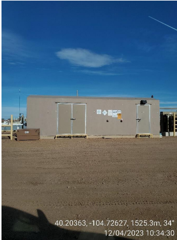
Photo 7 Lact Unit