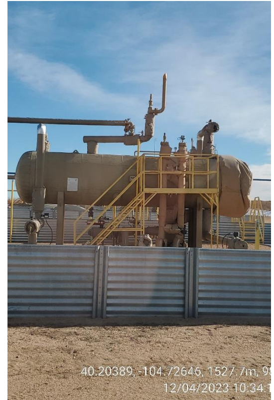
Photo 6 Horizontal Separator