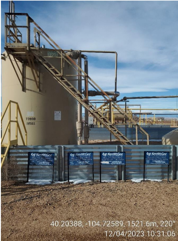
Photo 1 Battery