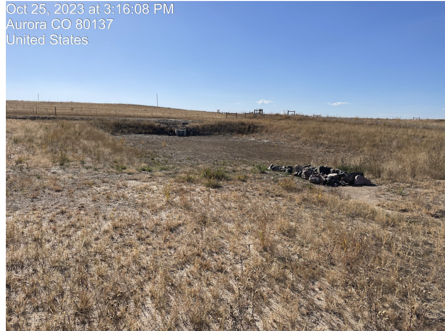
Photo 4. Photo taken of mowed vegetation in interim reclaimed area and drainage ditch leading to sediment basin.. Photo taken facing northwest.

Oct 25, 2023 at 3:16:08 PM Aurora CO 80137 United States