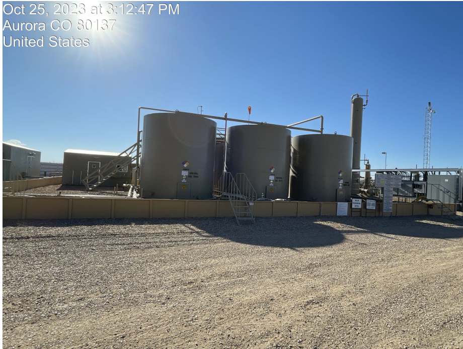
Photo 3. Photo taken of tank battery on pad. Photo taken facing east.

Oct 25, 2023 at 3:12:47 PM Aurora CO 80137 United States