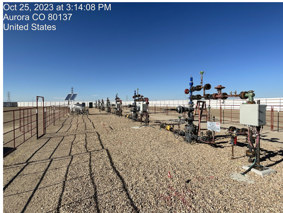
Photo 2. Photo taken of wells on site. Photo taken facing south.

Oct 25, 2023 at 3:14:08 PM Aurora CO 80137 United States