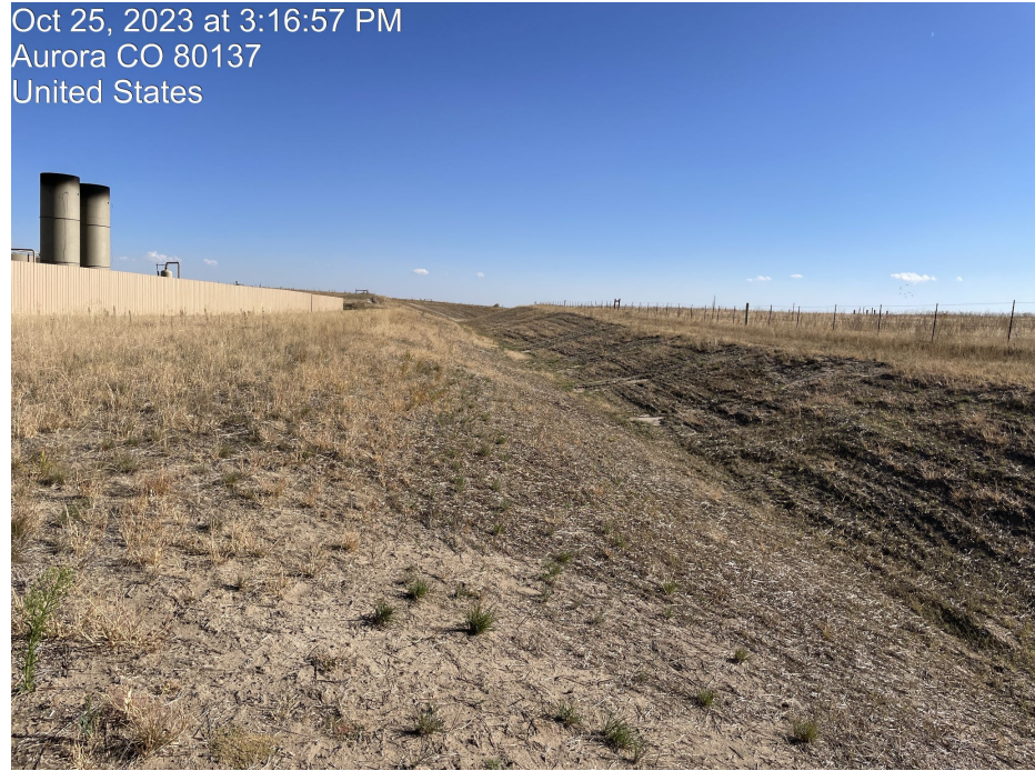
Photo 6. Photo taken of mowed interim reclamation area of perennial grasses, outer stormwater drainage ditch. Photo taken facing south.

Oct 25, 2023 at 3:16:57 PM Aurora CO 80137 United States