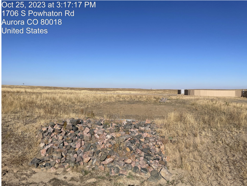
Photo 7. Photo taken of rock rundown on large sediment basin. Photo taken facing east.

Oct 25, 2023 at 3:17:17 PM 1706 S Powhatan Rd Aurora CO 80018 United States