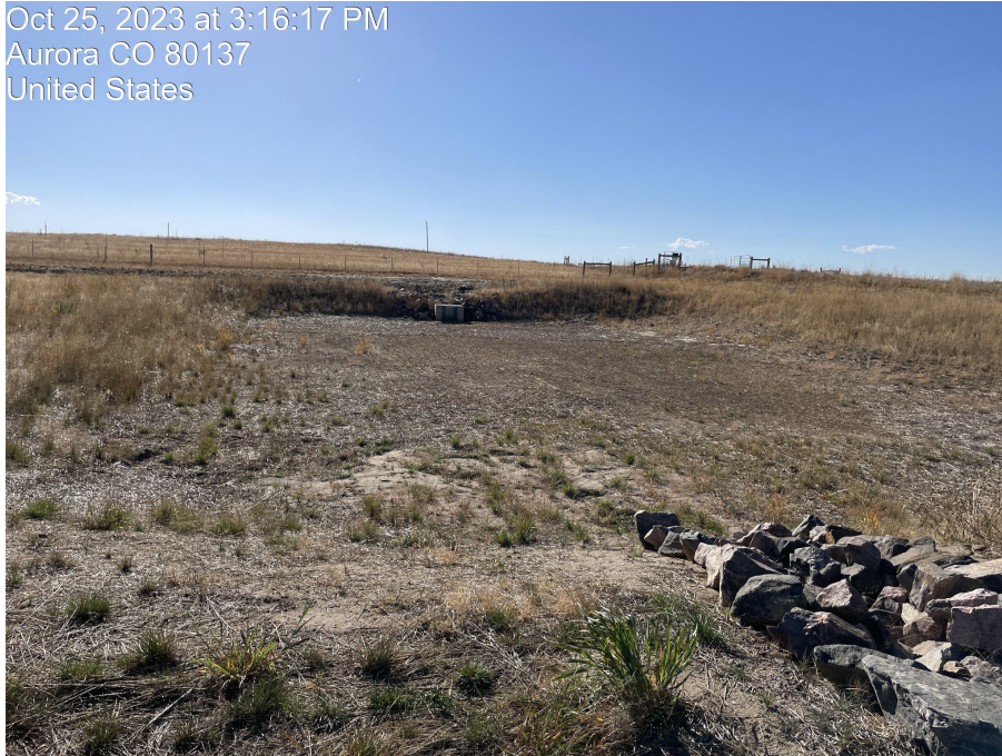
Photo 5. Photo taken of large stormwater sediment basin. Photo taken facing northeast.

Oct 25, 2023 at 3:16:17 PM Aurora CO 80137 United States