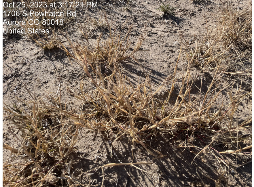
Photo 8. Photo taken of Longspine sandbur an undesirable plant species found throughout the reclaimed area. Photo taken facing south.

Oct 25, 2023 at 3:17:21 PM 1706 S Powhatan Rd Aurora CO 80018 United States