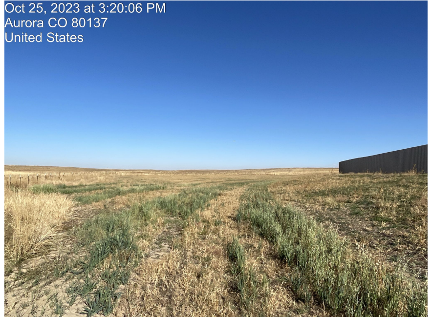
Photo 10. Photo taken of wheat planted in interim reclaimed area as a nurse crop.. Photo taken facing east.

Oct 25, 2023 at 3:20:06 PM Aurora CO 80137 United States