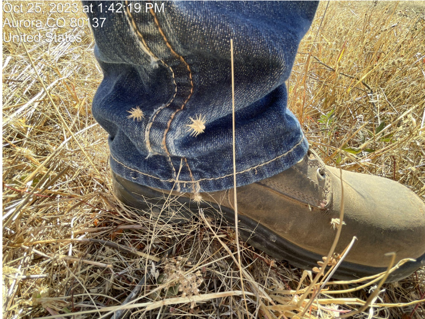
Photo 9. Photo of Longspine sandbur burs in pant cuff, demonstrating mowing is not sufficient to prevent spread of seeds.

Oct 25, 2023 at 1:42:19 PM Aurora CO 80137 United States