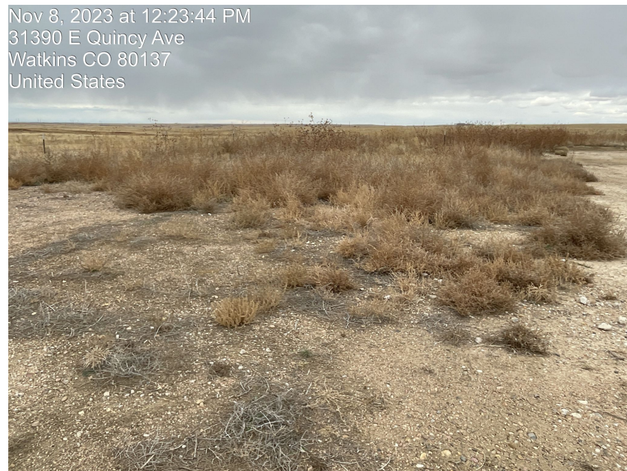
Photo 12. Photo taken of weeds (russian thistle & kochia) in interim reclaimed area. Photo taken facing west.