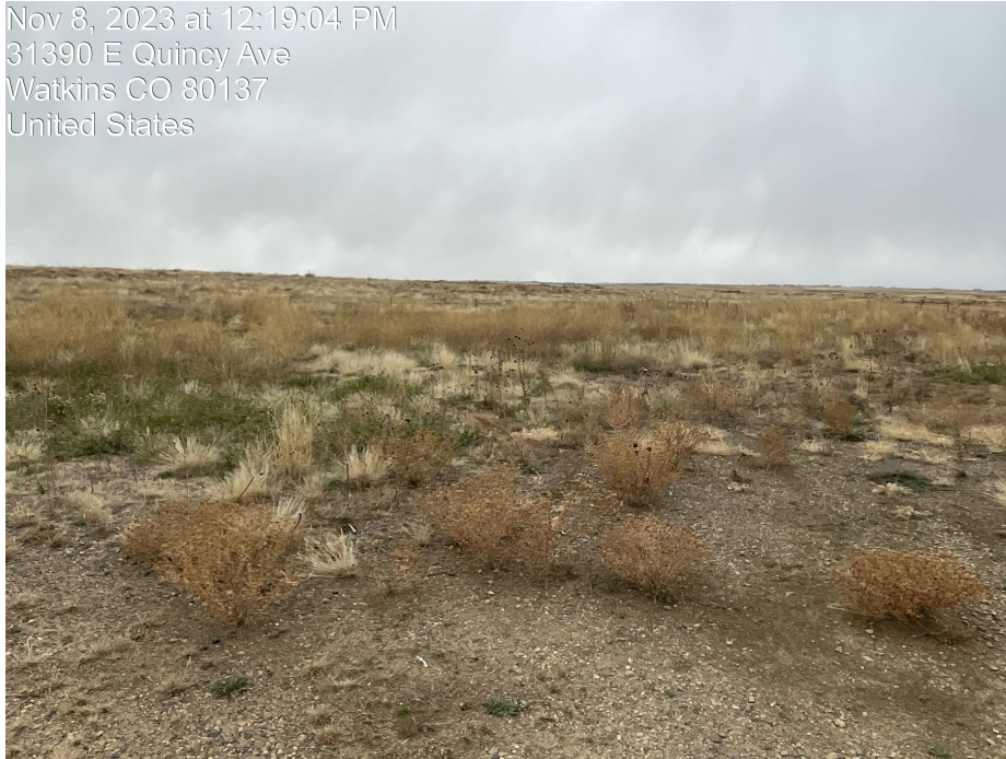
Photo 5. Photo taken of interim reclaimed area of perennial grasses and forbes. Photo taken facing east.

Nov 8, 2023 at 12:19:04 PM 31390 E Quincy Ave Watkins CO 80137 United States