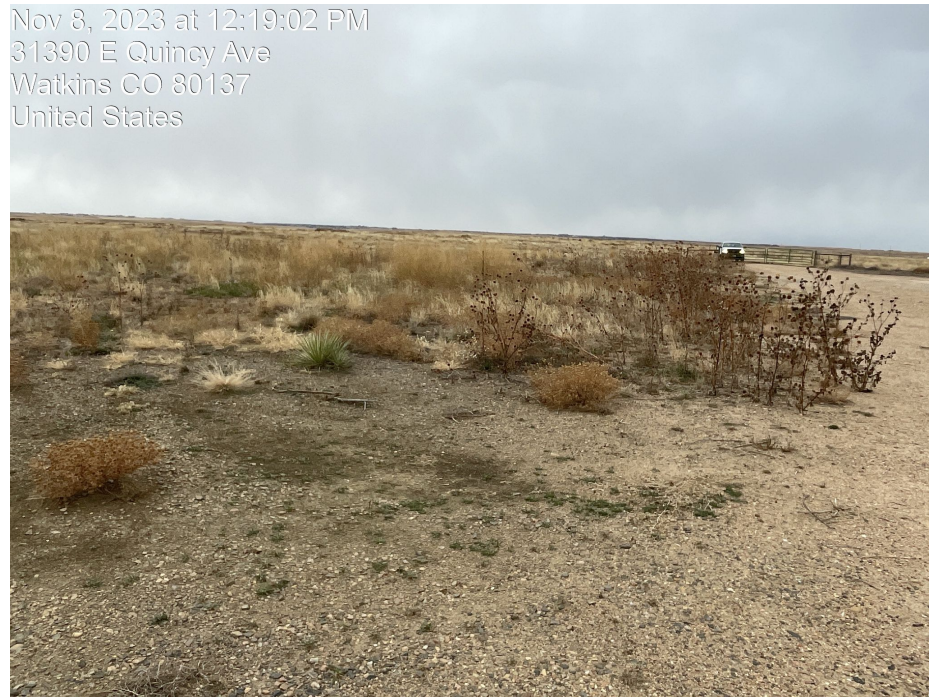
Photo 4. Photo taken of interim reclaimed area of perennial grasses and forbes. Photo taken facing southeast.

Nov 8, 2023 at 12:19:02 PM 31390 E Quincy Ave Watkins CO 80137 United States