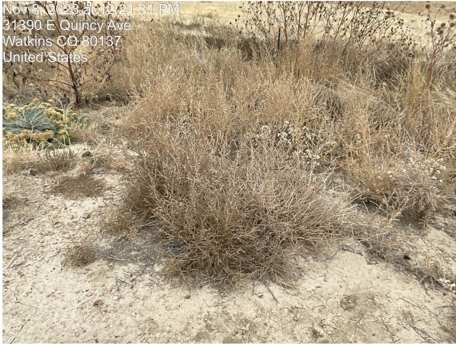
Photo 9. Photo taken of weeds (kochia) on site. Photo taken facing west.

Nov 8, 2023 at 12:21:31 PM 31390 E Quincy Ave Watkins CO 80137 United States