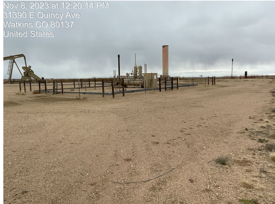
Photo 6. Photo of equipment on site. Photo taken facing northeast.

Nov 8, 2023 at 12:20:14 PM 31390 E Quincy Ave Watkins CO 80137 United States