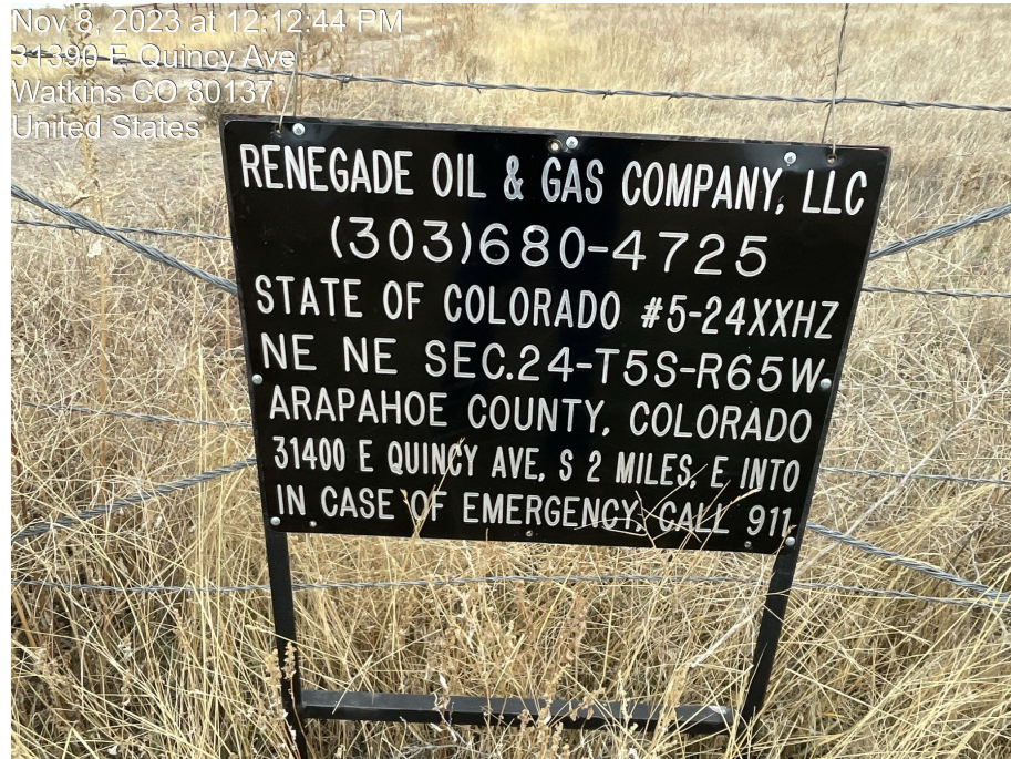
Photo 1. Photo taken of location sign at wellhead, facing northeast.

Nov 8, 2023 at 12:12:44 PM 31390 E Quincy Ave Watkins CO 80137 United States