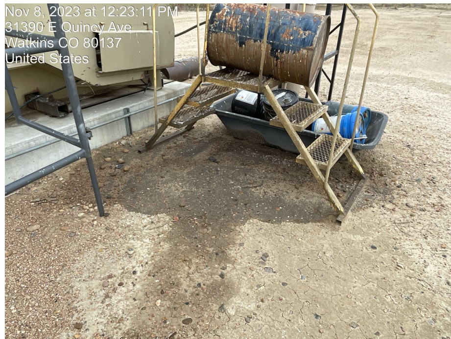
Photo 11. Photo taken of stained soil under equipment next to well head. Photo taken facing northwest.