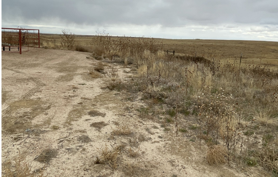
Photo 7. Photo taken of interim reclaimed area of perennial grasses and forbes. Photo taken facing west.

Nov 8, 2023 at 12:21:14 PM 31390 E Quincy Ave Watkins CO 80137 United States