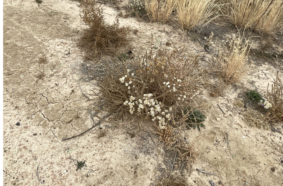
Photo 8. Photo taken of weeds (russian thistle). Photo taken facing north.

Nov 8, 2023 at 12:21:26 PM 31390 E Quincy Ave Watkins CO 80137 United States