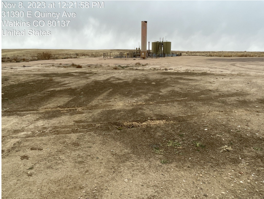
Photo 3. Photo taken of tank battery on pad and separator. Photo taken facing south.

Nov 8, 2023 at 12:21:58 PM 31390 E Quincy Ave Watkins CO 80137 United States