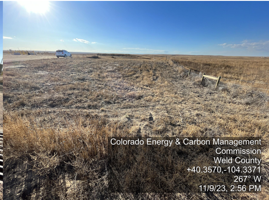
Colorado Energy & Carbon Management Commission Weld County +40.3570,-104.3371 267° W 11/9/23, 2:56 PM

Photo 1. The photo was taken at the entrance to the location of the location sign facing Southeast.