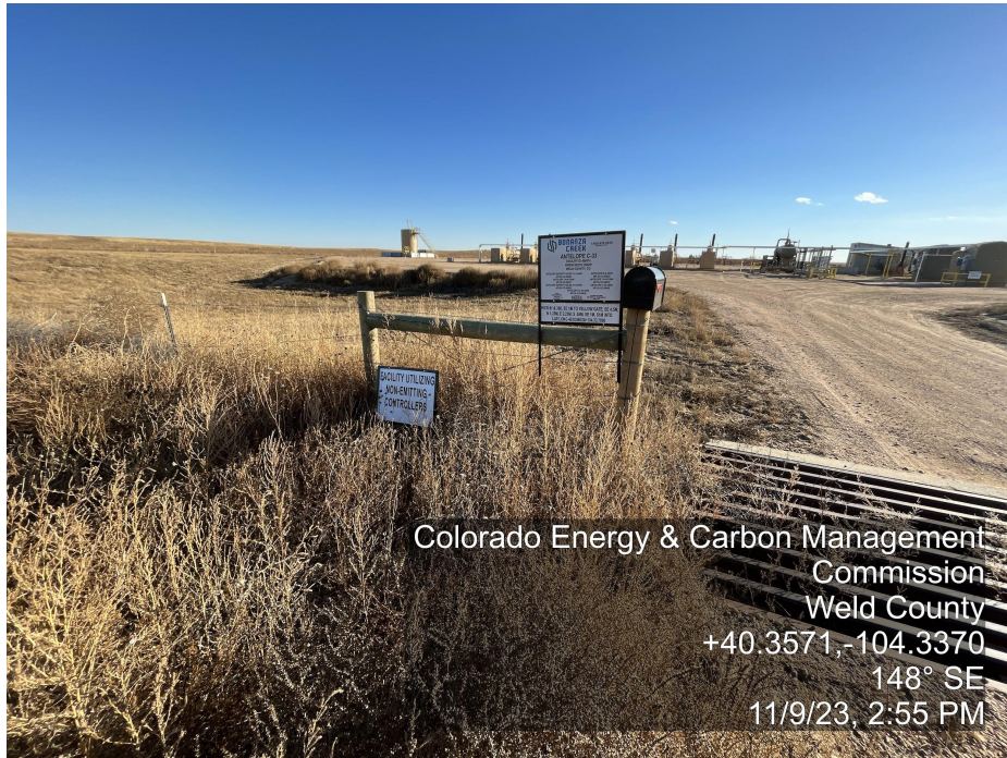
Colorado Energy & Carbon Management Commission Weld County +40.3571,-104.3370 148° SE 11/9/23, 2:55 PM