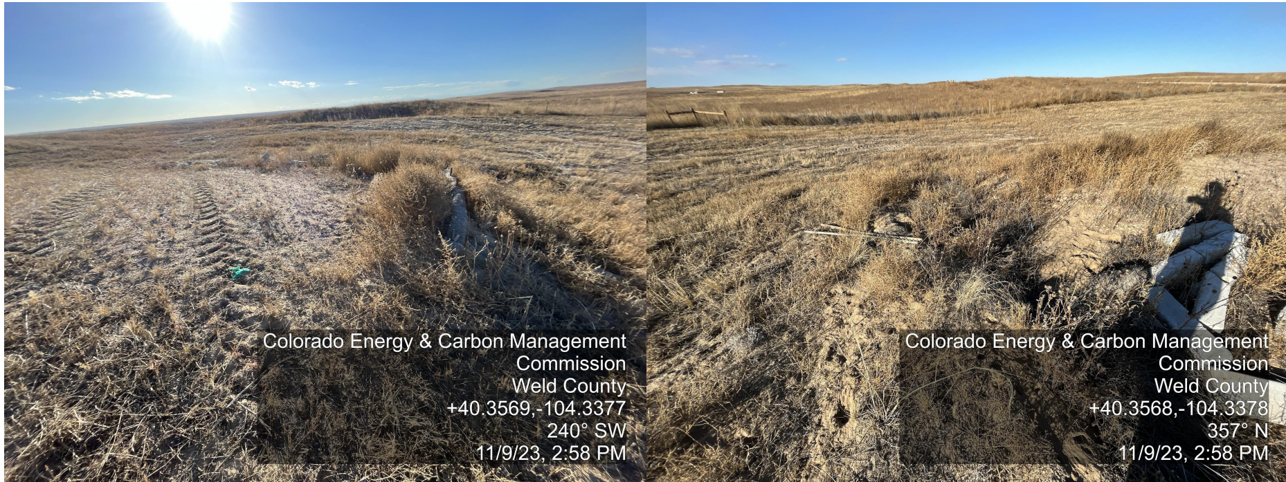
Photo 3. The photo was taken at the well location facing Southwest. The photo illustrates debris including straw wattle, concrete blocks and stakes as well as some accumulation of undesirable vegetation.

Photo 4. The photo was taken at the well location facing North. Refer to the comment for photo 3.