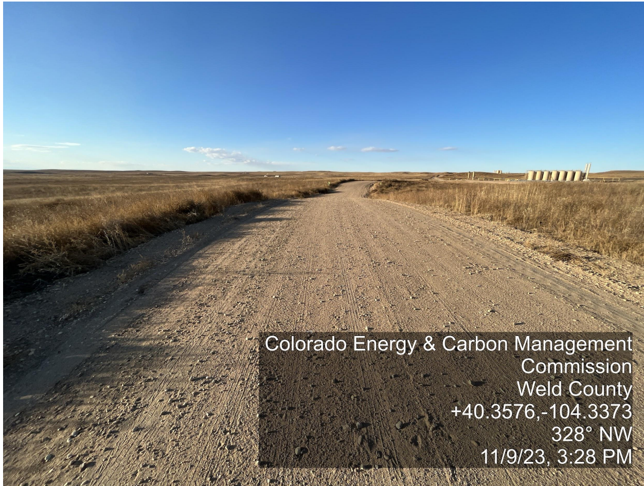
Photo 7. The photo was taken at the entrance to the well location facing Northwest of the access road.