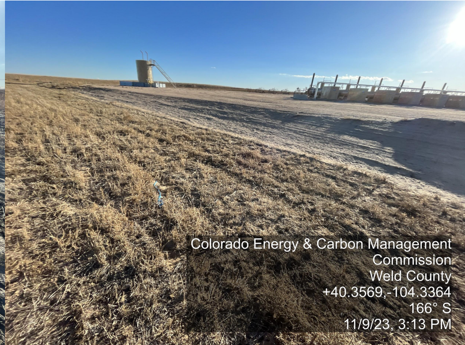
Photo 5. The photo was taken at the well location facing South. The photo illustrates areas of bare soil being torn up by wheel tracking in the interim areas.

Photo 6. The photo was taken at the well location facing South. The photo illustrates the slope off the active pad is unprotected from erosion by vegetation or BMP's.