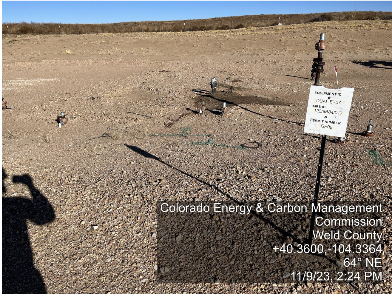
Photo 10. The photo was taken from the location facing Northeast. The photo illustrates stained soil where oil and gas equipment appeared to be previously.