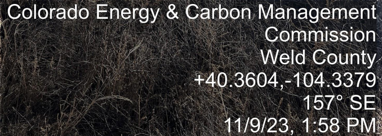
Photo 1. The photo was taken from the location entrance facing Southeast and illustrates the location sign.