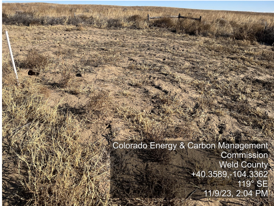
Photo 2. The photo was taken from the location facing Southeast. The photo illustrates tumbleweeds piling against the Southeast corner fence.