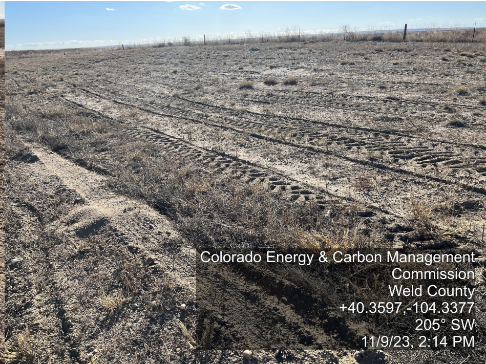
Photo 6. The photo was taken from the location facing South. The photo illustrates personal tire tracks running throughout the interim areas.

Photo 7. The photo was taken from the location facing Southwest. The photo illustrates a large area of bare soil along the interim reclamation area on the West of the location.