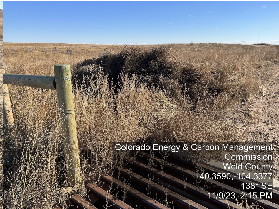
Photo 9. The photo was taken from the location exit facing Southeast. The photo illustrates tumbleweeds being piled just outside the location boundary fence and not being disposed of.