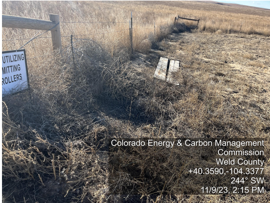
Photo 8. The photo was taken from the location exit facing Southwest. The photo illustrates debris left on location.