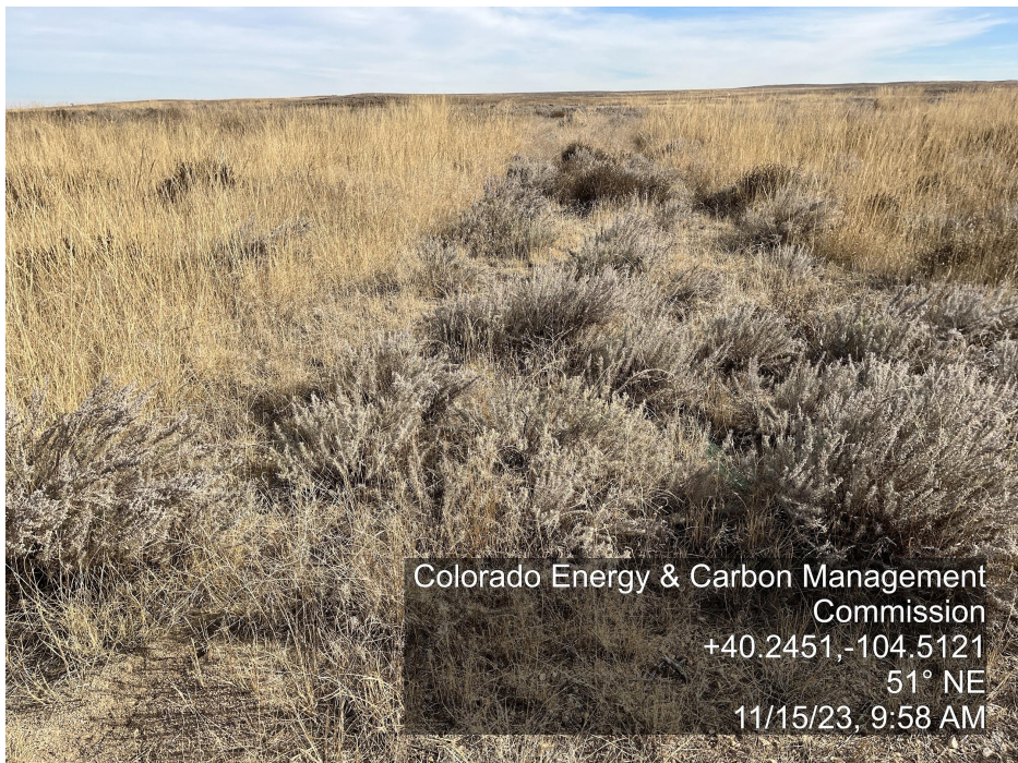
Photo 1. The photo was taken at the entrance to the access road facing Northeast. The photo illustrates the access road to the location dominated by sand sagebrush and blue grama.