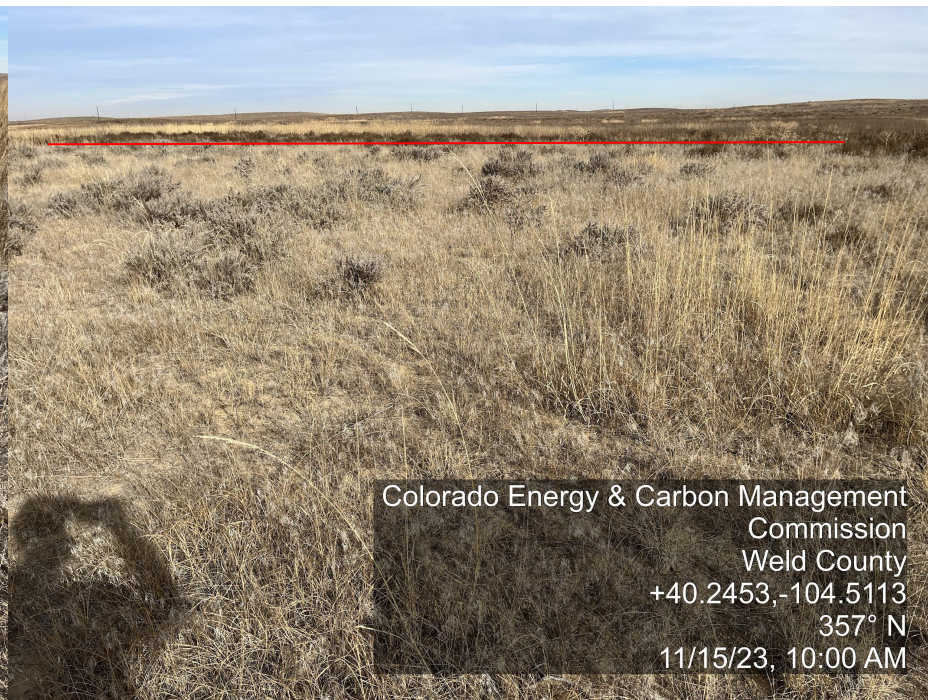
Photo 2. The photo was taken from the center of the location facing North. The photo illustrates dominant cheatgrass with bunches of sand sagebrush and reed canary grass as well as russian thistle dominating the Northwestern boundary seen by the red line.