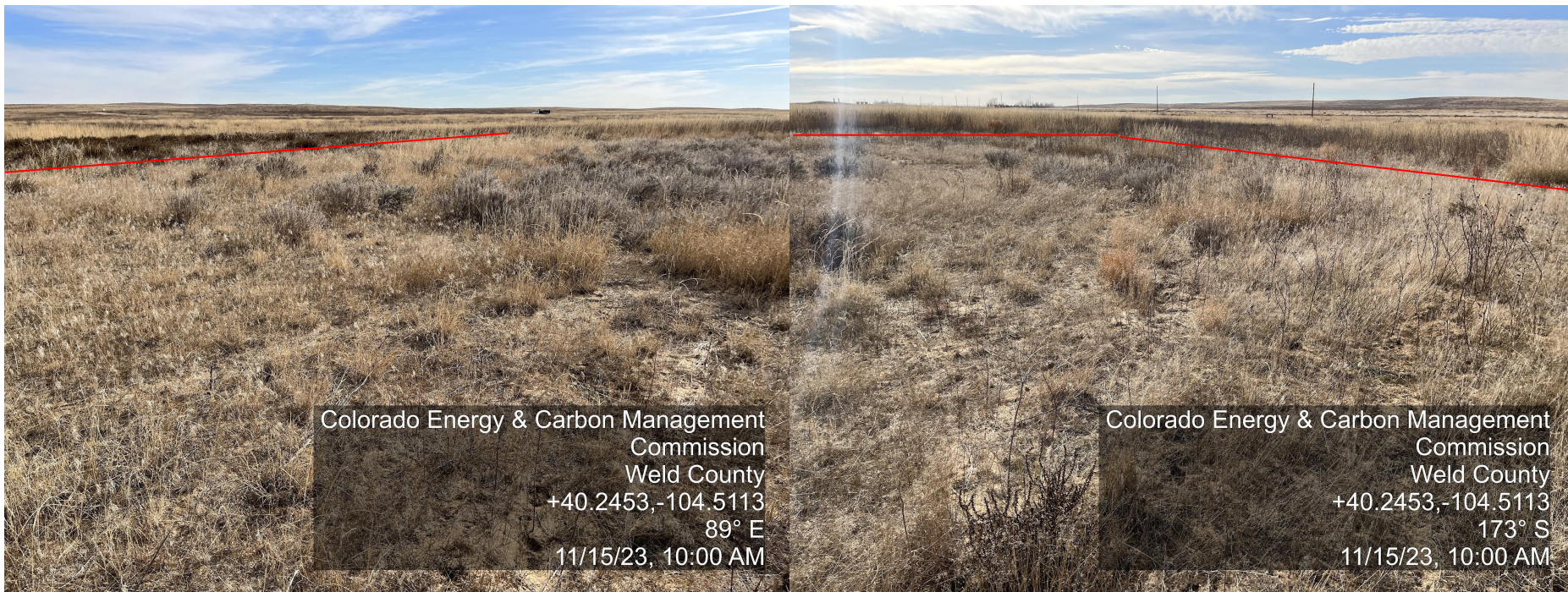
Photo 3. The photo was taken from the center of the well location facing East. Refer to the comment for photo 2.