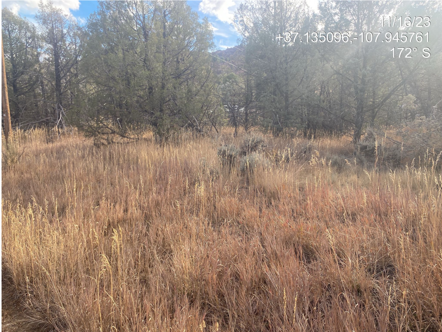
Photo 4. Reference area comprised of sagebrush, smooth brome and poa secunda.

Inspection Photos Location Name : Jacques 1 Location ID: 325319