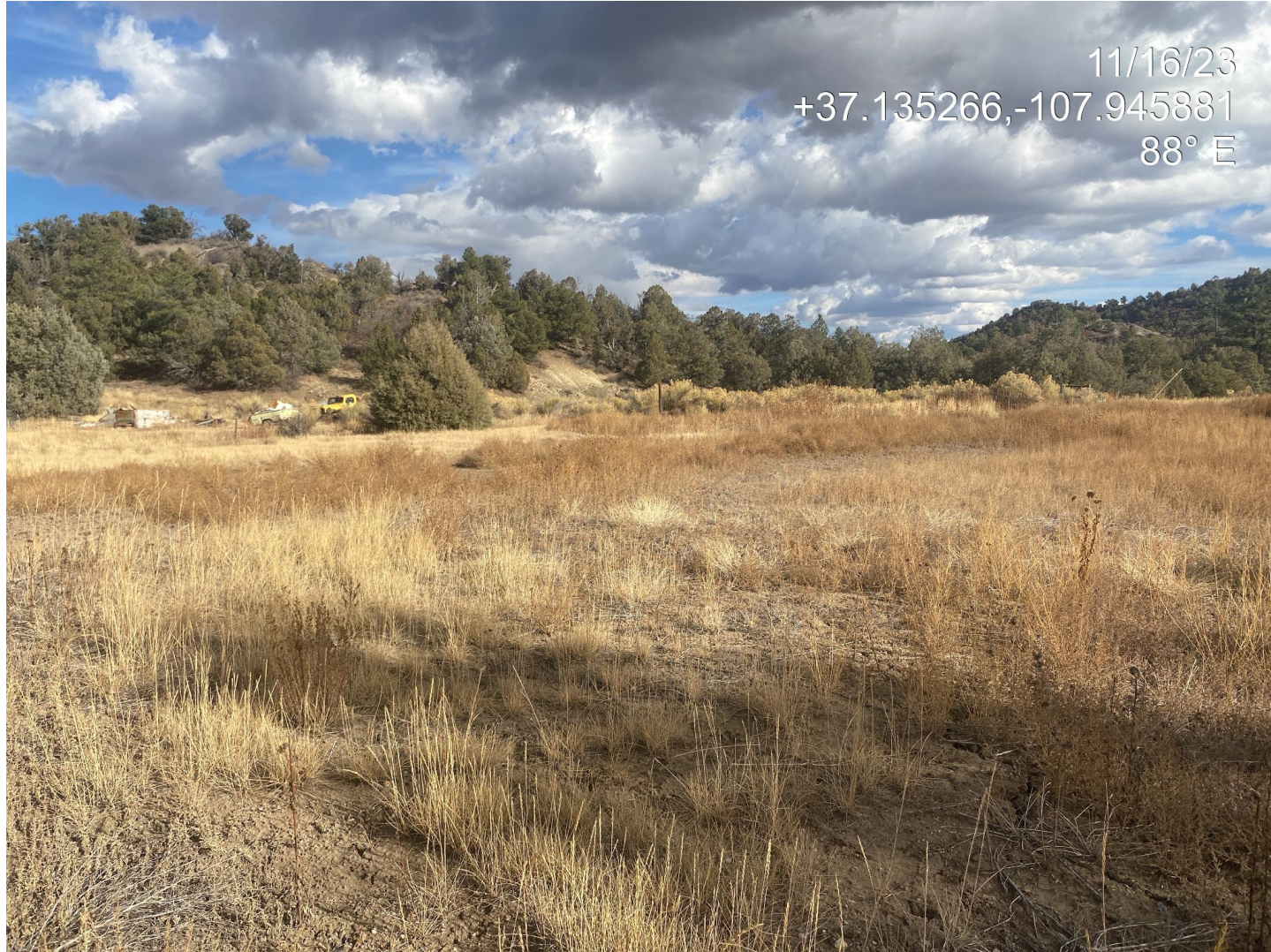
Photo 1. View of the project area taken from the western edge facing east.

Inspection Photos Location Name: Jacques 1 Location ID: 325319