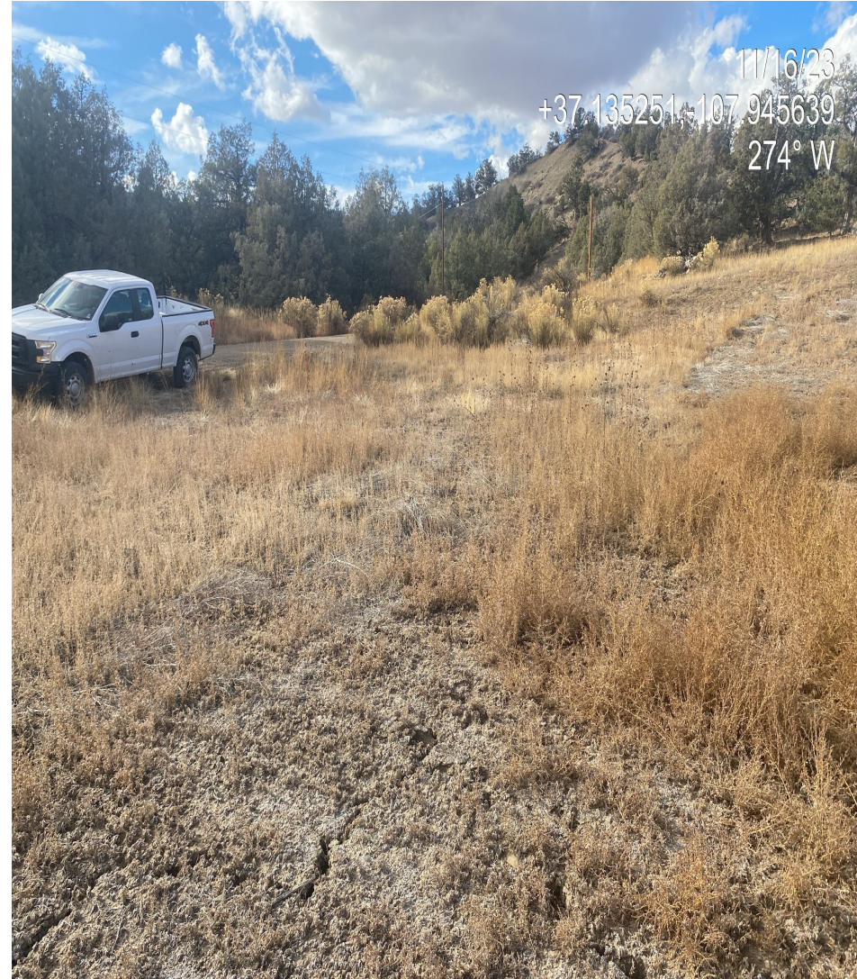
Photo 3. Cardinal photos taken from the center of the project area. Left photo facing south, right photo facing west. Note: project area is dominated by an undesirable plant species Kochia, and does not appear consistent with the adjacent reference area.