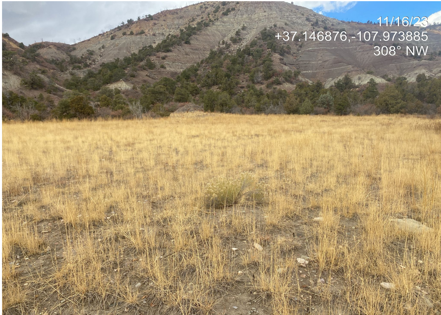
Photo 1. View of the project area taken from the entrance facing center.

Inspection Photos Location Name: Argenta 34-10 31-1 Location ID: 385889