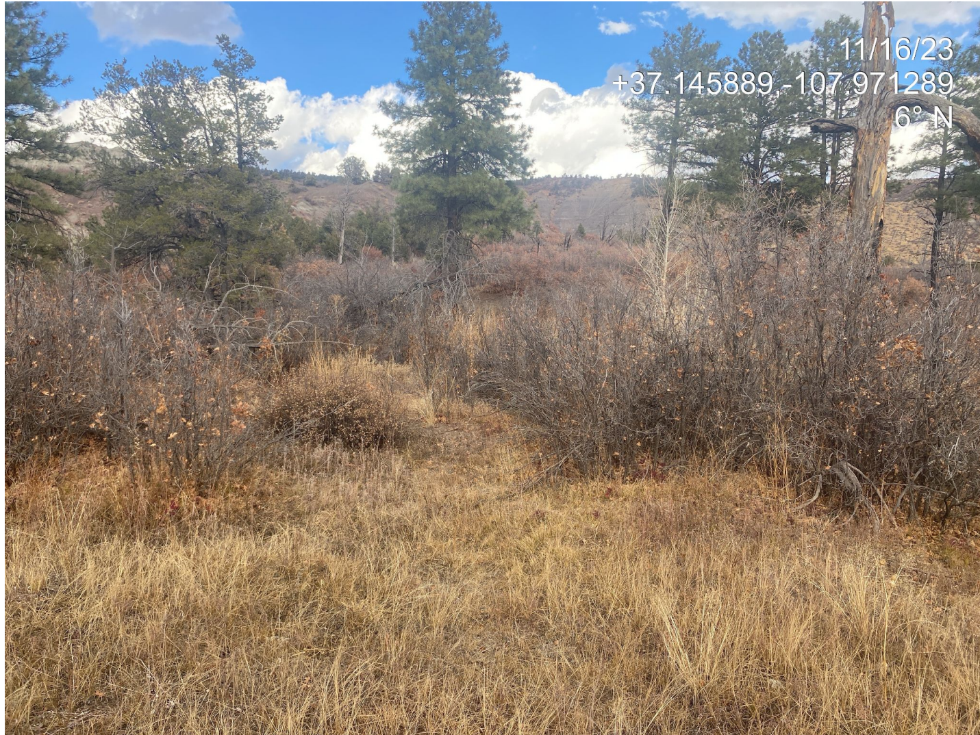
Photo 6. Reference area comprised of gambel oak and smooth brome.