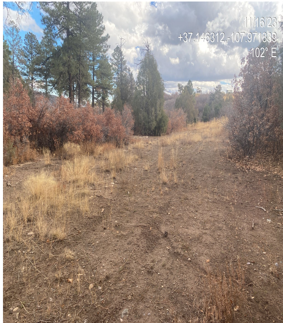
Photo 5. View of several bare patches observed along the access road that need additional reclamation.