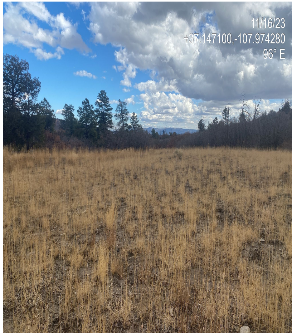
Photo 2. Cardinal photos taken from the center of the project area. Left photo facing north, right photo facing east.