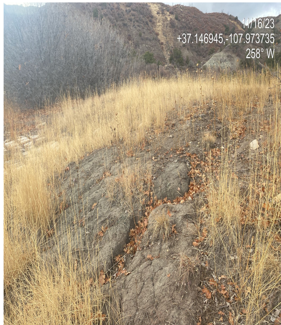
Photo 4. View of rill erosion forming along the access road at the entrance point of the well disturbance.