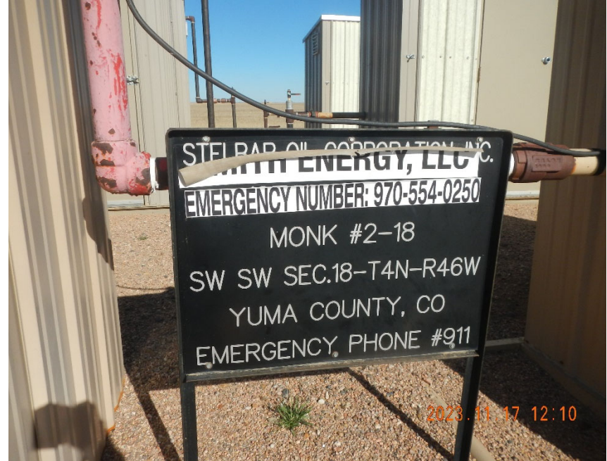
4. Well sign at remote gas meter run.