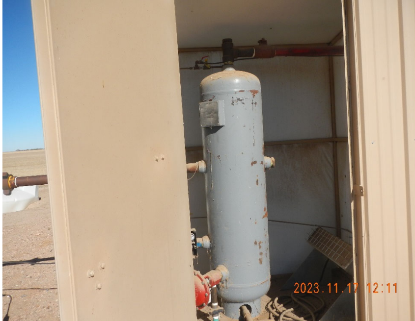
5. Vertical separator inside separator shed at remote gas meter run.