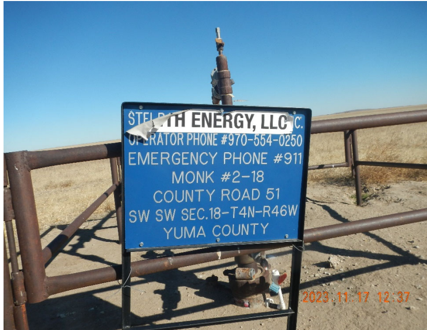
1. Well sign at well location.