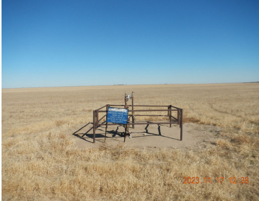
3. Well location overview.