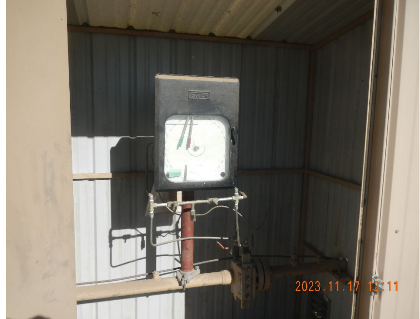
6. Gas meter inside meter shed at remote gas meter run.