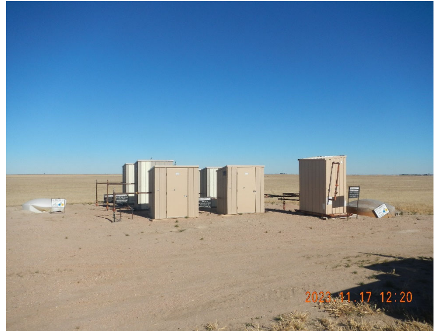
8. Shared remote location overview.