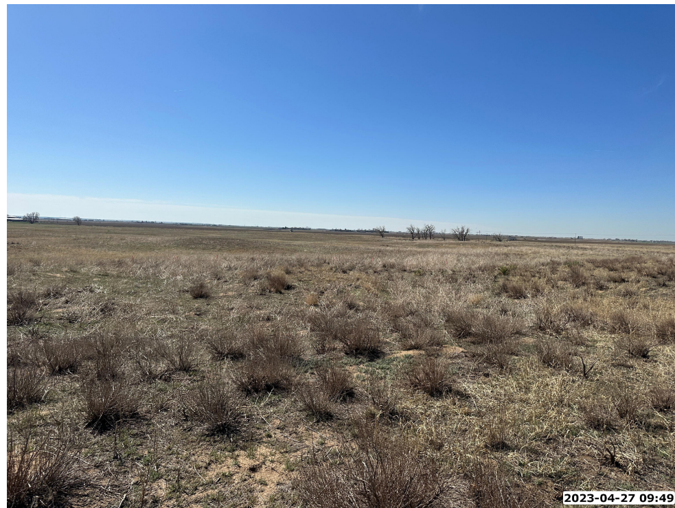
LOCATION PICTURE OF ALDER 23-16HZ WELL PAD - CAMERA VIEW SOUTH