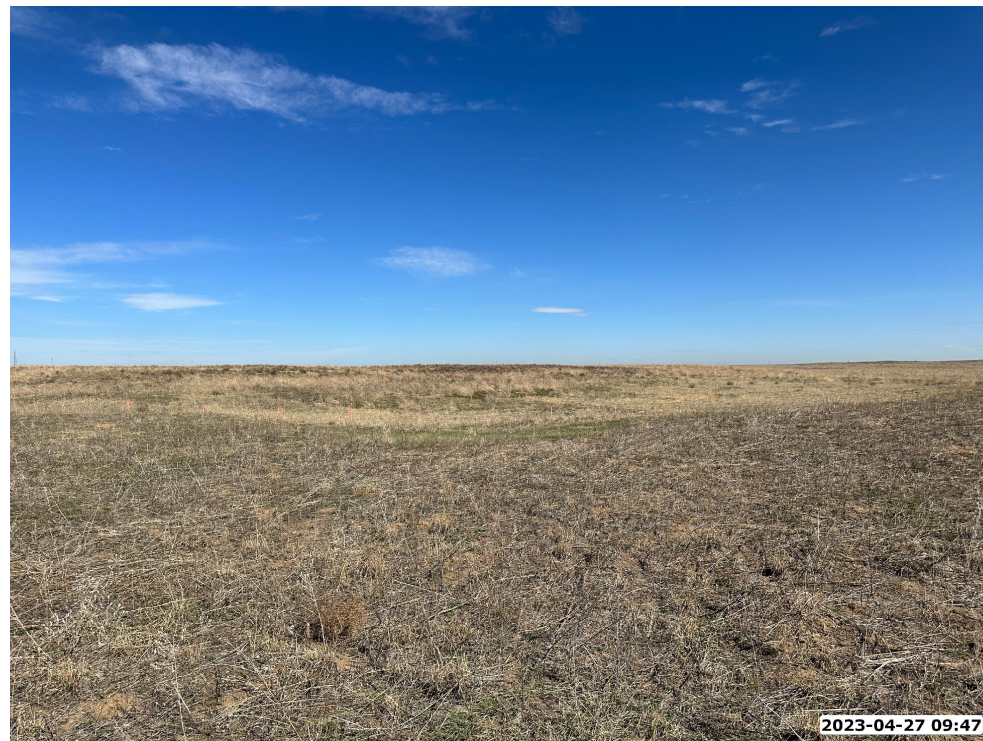
LOCATION PICTURE OF ALDER 23-16HZ WELL PAD - CAMERA VIEW NORTH

S1/2 SECTION 16, TOWNSHIP 2 NORTH, RANGE 63 WEST, 6TH P.M., WELD COUNTY, COLORADO