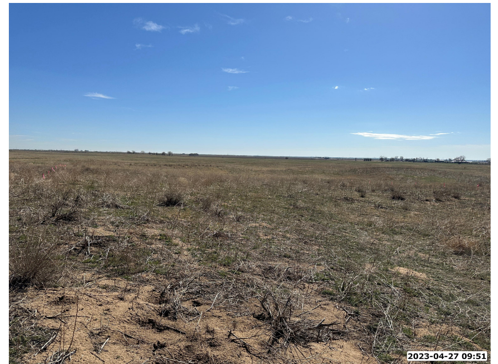
LOCATION PICTURE OF ALDER 23-16HZ WELL PAD - CAMERA VIEW EAST