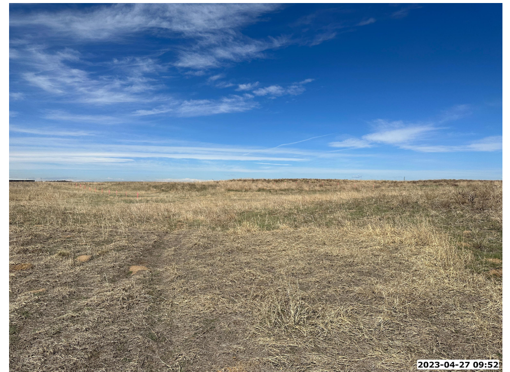
LOCATION PICTURE OF ALDER 23-16HZ WELL PAD - CAMERA VIEW WEST

K:\AMDRK\2021\2022_124_ALDER_T2N_R63W_SEC_16\DWG\COLORADO_T2N_R63W_SEC_16.dwg, 7/3/2023 3:00:50 PM, skundberg