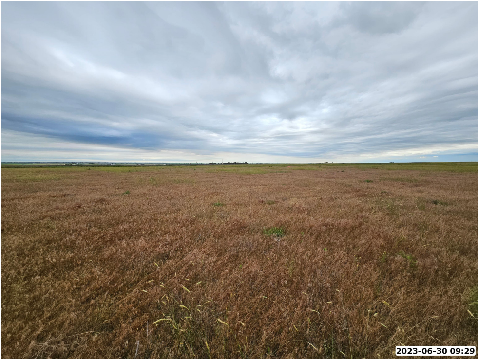
LOCATION PICTURE OF ACACIA 13-17HZ WELL PAD - CAMERA VIEW SOUTH