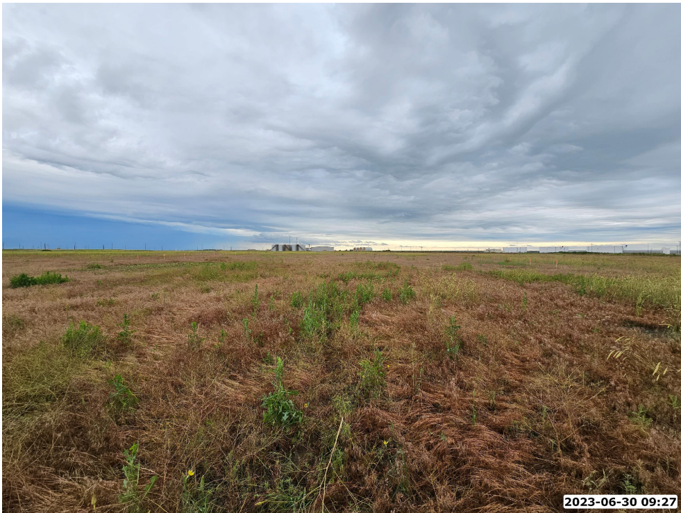
LOCATION PICTURE OF ACACIA 13-17HZ WELL PAD - CAMERA VIEW NORTH