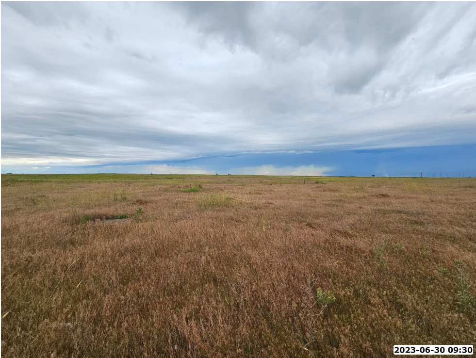
LOCATION PICTURE OF ACACIA 13-17HZ WELL PAD - CAMERA VIEW WEST

K:\ANADARKO\2022\2022_135_ACACIA_T2N_R63W_SEC_17\DWG\ACACIA_T2N_R63W_SEC_17.dwg, 8/14/2023 5:03:54 PM, sundberg