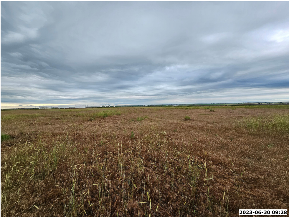
LOCATION PICTURE OF ACACIA 13-17HZ WELL PAD - CAMERA VIEW EAST