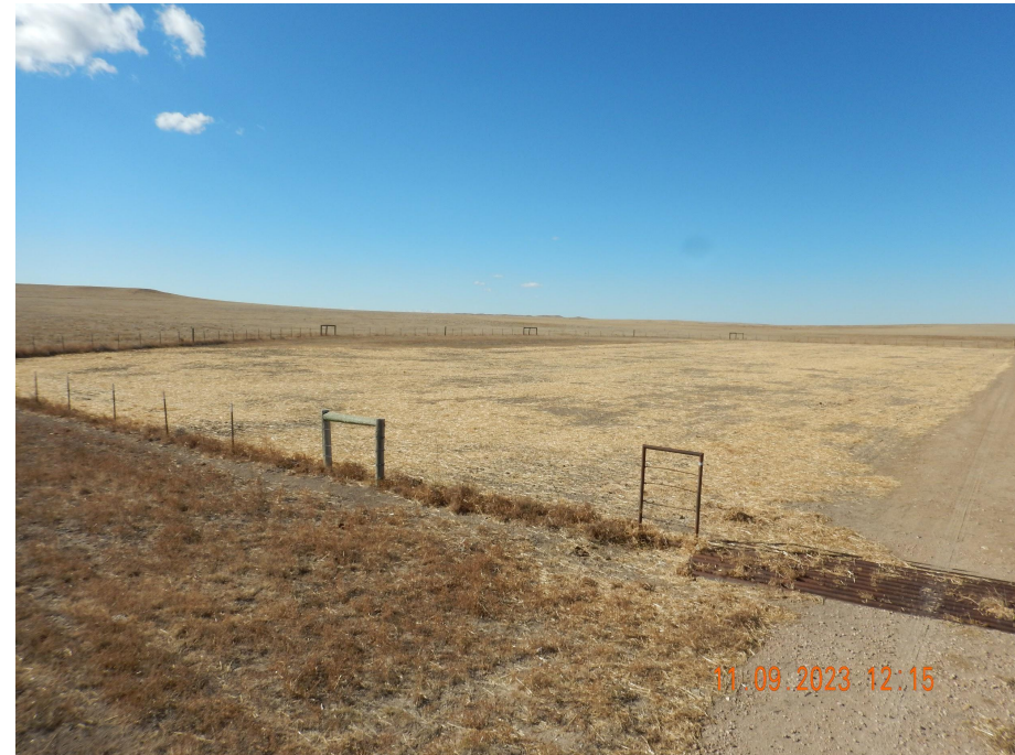
Photo 3. Photo taken from the entrance of location, facing Southwest. See comments under Photo 2.

Note- the access road that travels through the location has been left in place, along with the cattle guards.