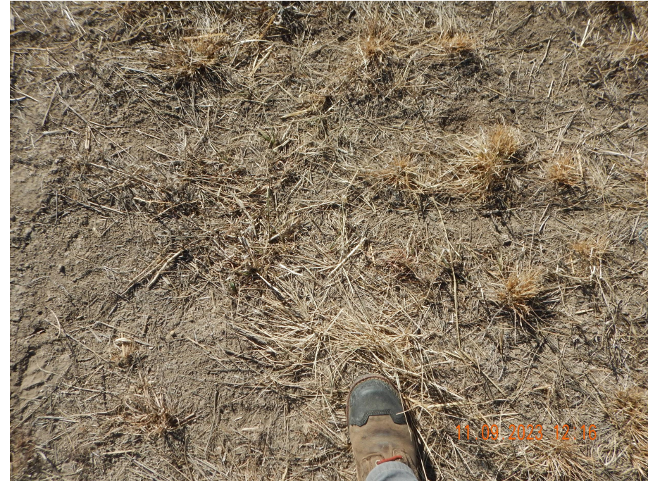
Photo 7. Close up photo taken from the location illustrating the current establishment.