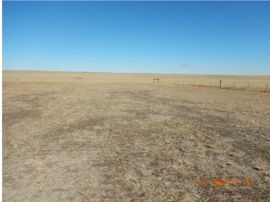
Photo 6. Photo taken from the northeastern location, facing North. See comments under Photo 2.