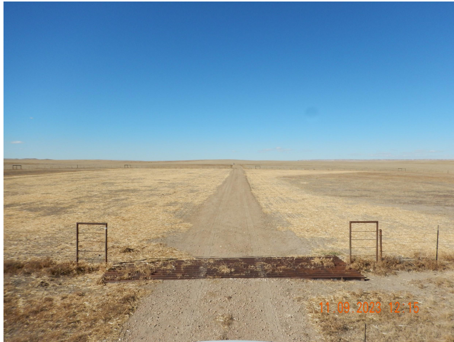
Photo 2. Photo taken from the entrance of location, facing West. Photo illustrates the Operator has performed final reclamation activities to reseed the location with the evidence of straw crimped mulch.