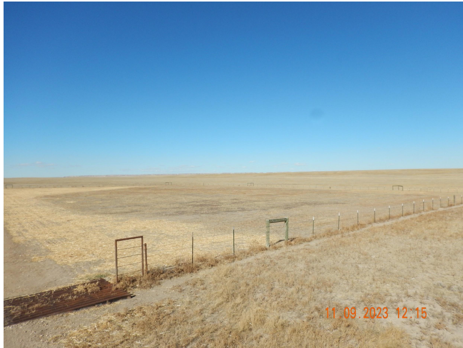
Photo 4. Photo taken from the entrance of location, facing Northwest. See comments under Photo 2.