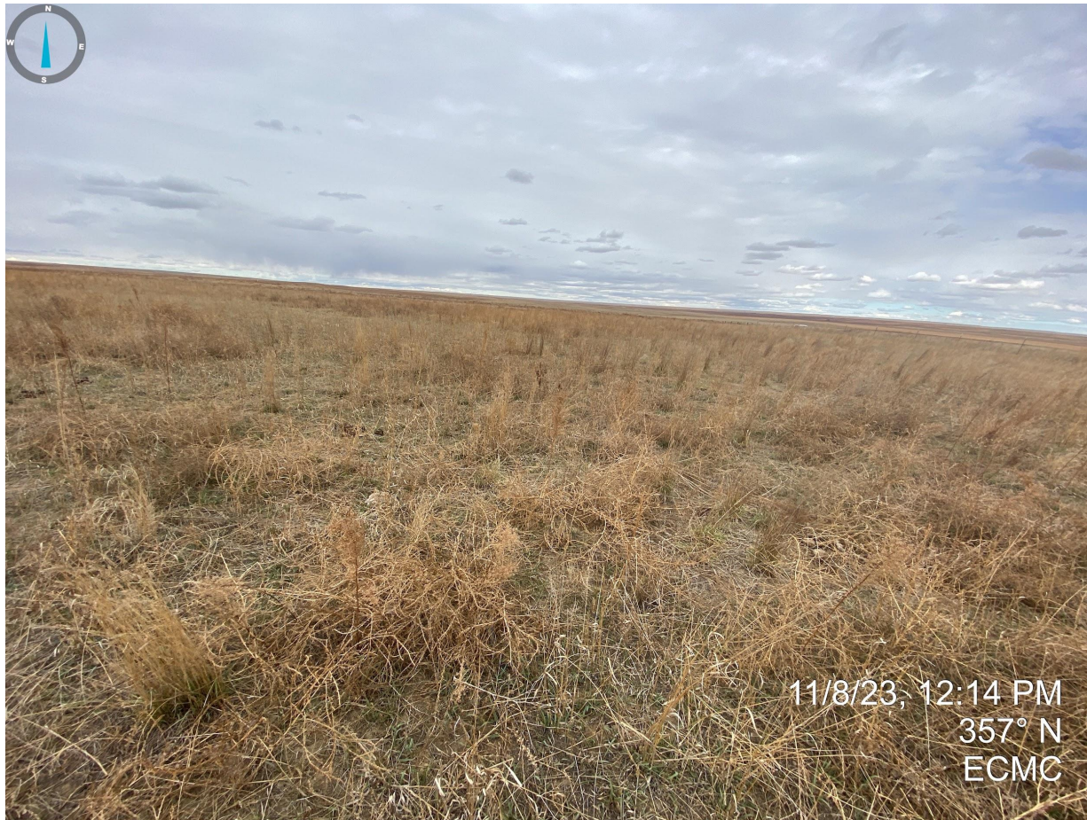
Photo 11. Undesirable vegetation (e.g. russian thistle and crested wheatgrass) observed throughout the former drilling pit. Additional reclamation activities are required.