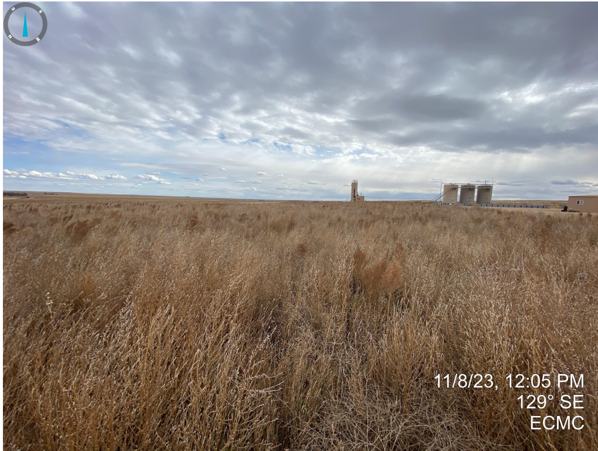
Photo 2. Continued from Photo 1; eastern portion of the location within the interim areas.