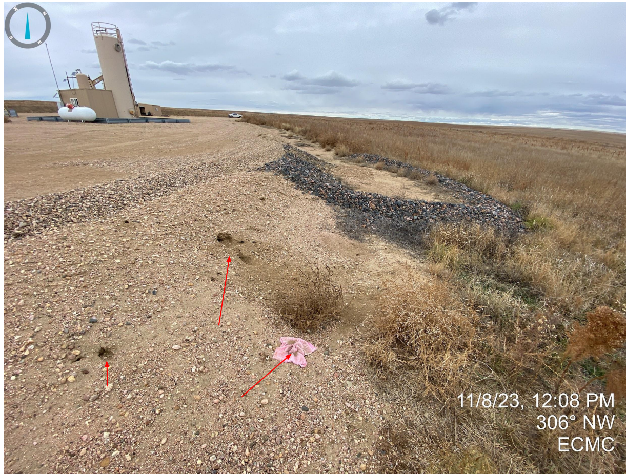
Photo 6. Debris and animal burrows observed on the eastern portion.