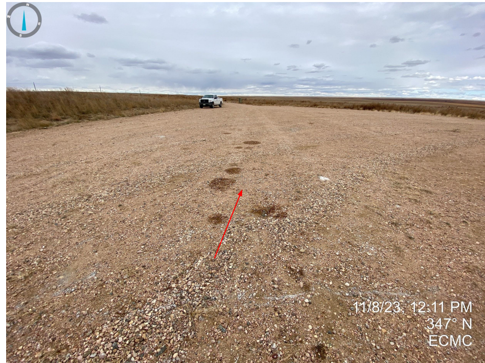
Photo 9 & 10. Stained soil at wellhead and just north of wellhead within production areas.