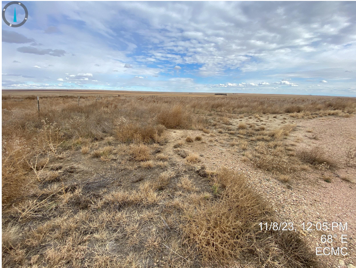
Photo 1. Undesirable vegetation (e.g. russian thistle, kochia, crested wheatgrass) observed near the entrance to the location. Additional reclamation activities are required in order to comply with Rule 1003.