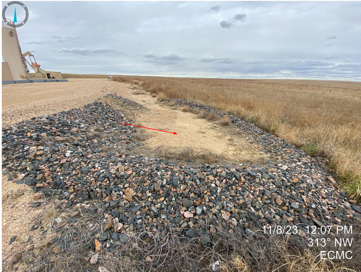
Photo 5. Sediment trap on the east side of the production areas; maintenance is required as it is beginning to fill with sediment.