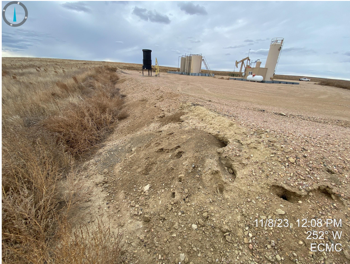
Photo 7. Continued from Photo 6; unstabilized soils originating from animal burrows.