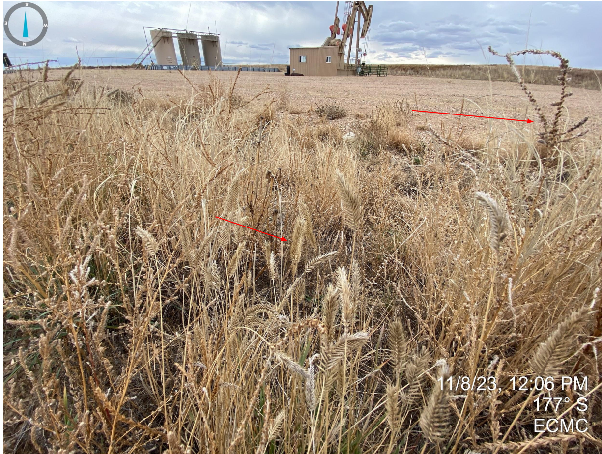
Photo 3. Close up of crested wheatgrass and kochia.