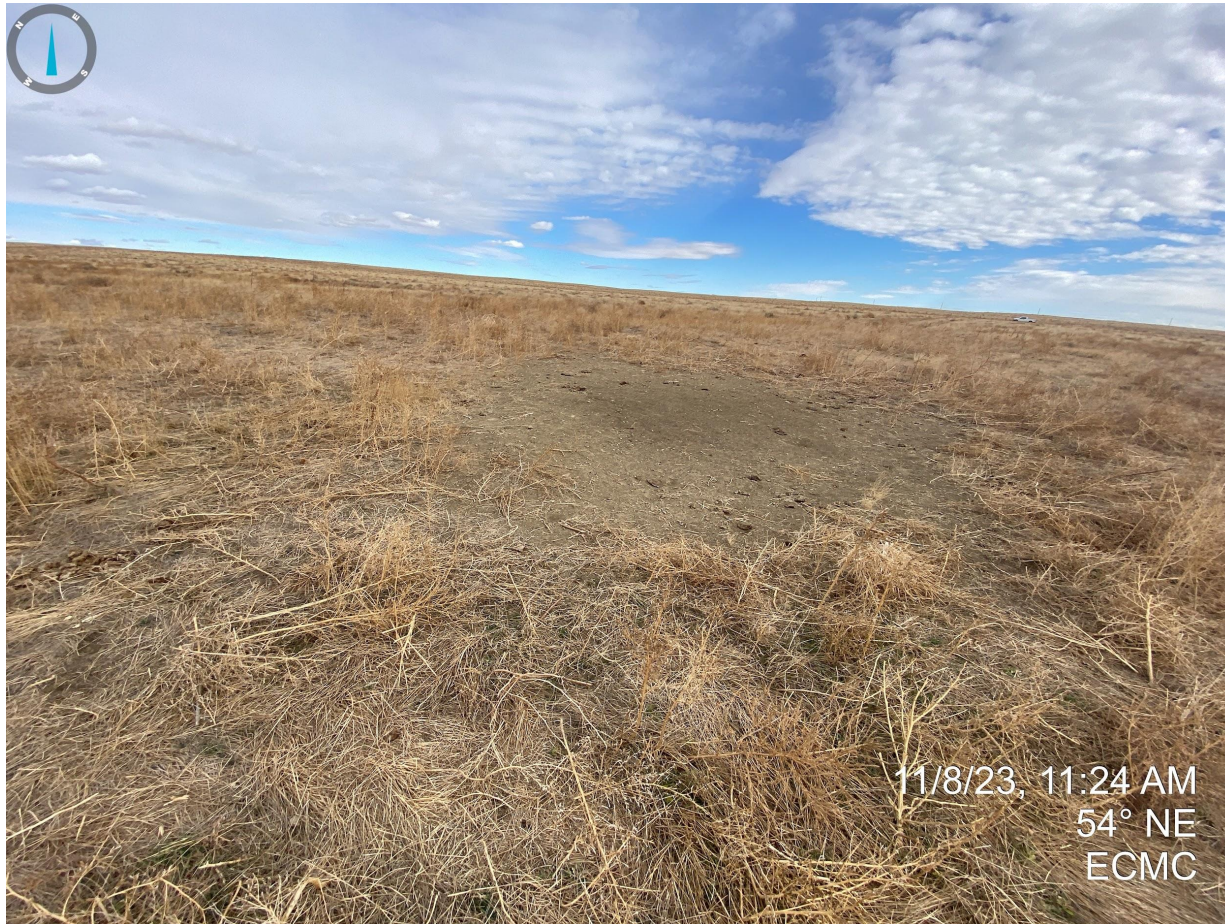
Photo 8. Taken near the center portion of the location; see comments in Photo 7.