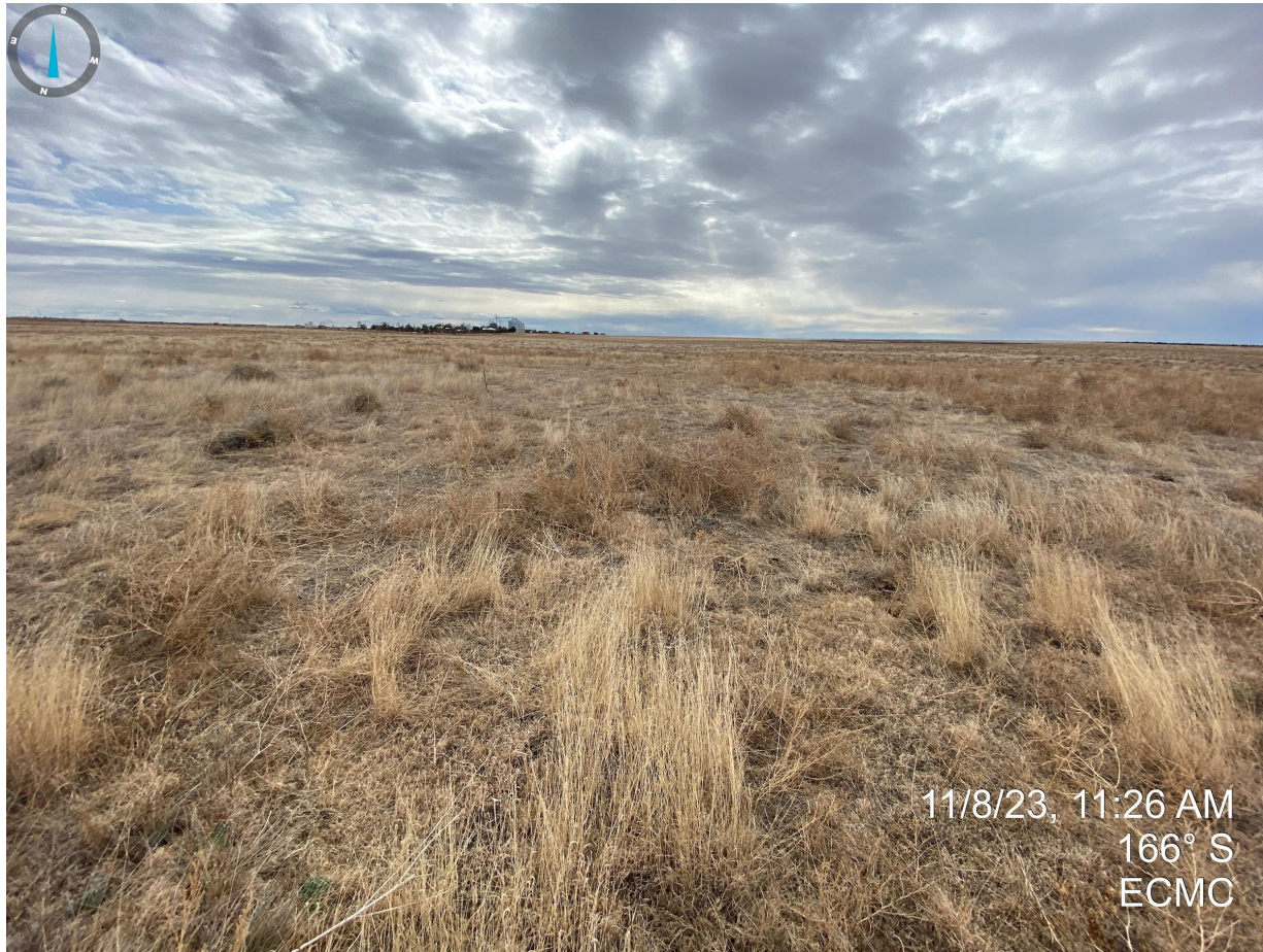
Photo 10. Taken from the northern portion of the location, facing south. See comments in Photo 6.