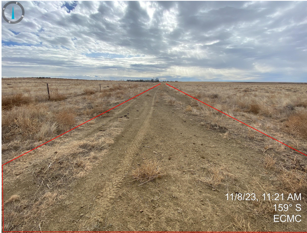
Photo 2. Taken east of the location, facing south along the access road. See comments in Photo 1.