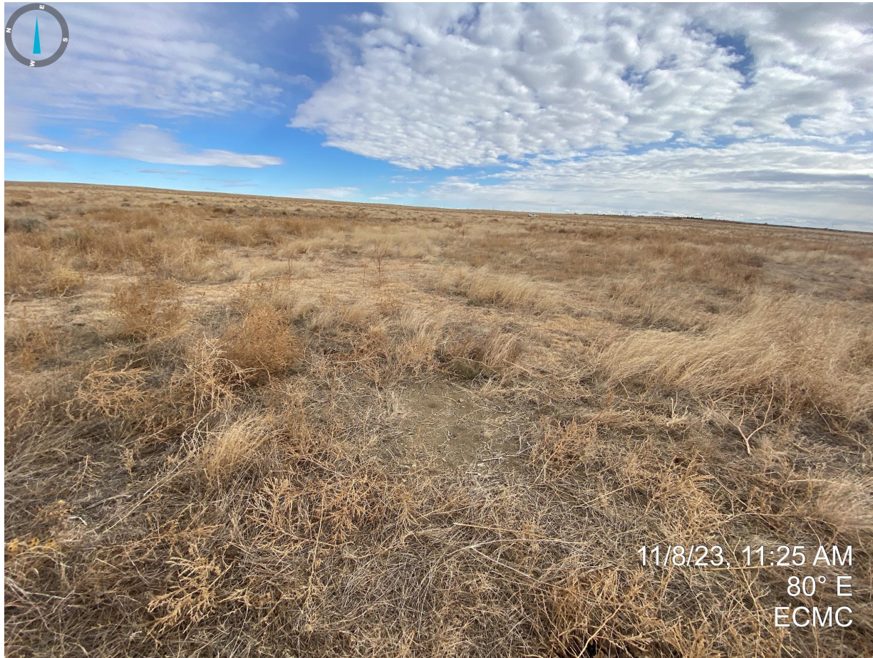
Photo 9. Taken from the western portion of the location, facing east. See comments in Photo 6.