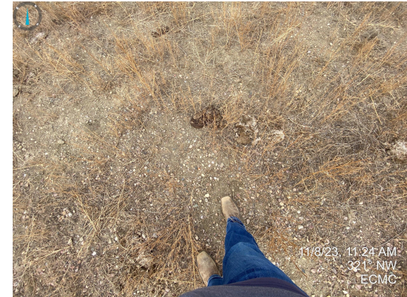
Photo 7. Taken near the southwestern portion of the location. road base and gravel remain, in addition to weedy debris.