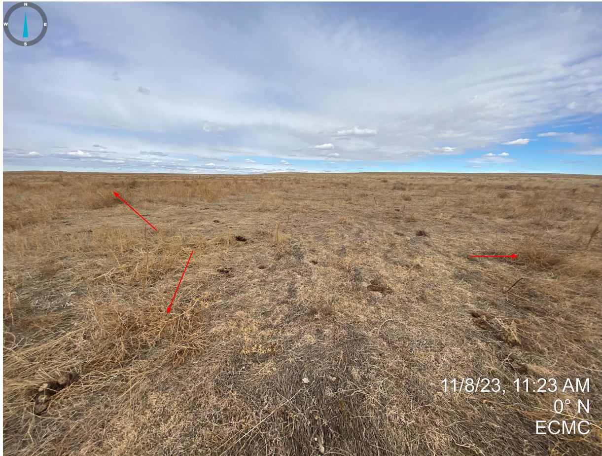
Photo 6. Taken from the southern portion of the location. Photo illustrates the presence of annual weedy vegetation (e.g. kochia and russian thistle). Some desirable vegetation (e.g. buffalo grass) was observed, however, the location overall is not progressing towards Rule 1004 standards.