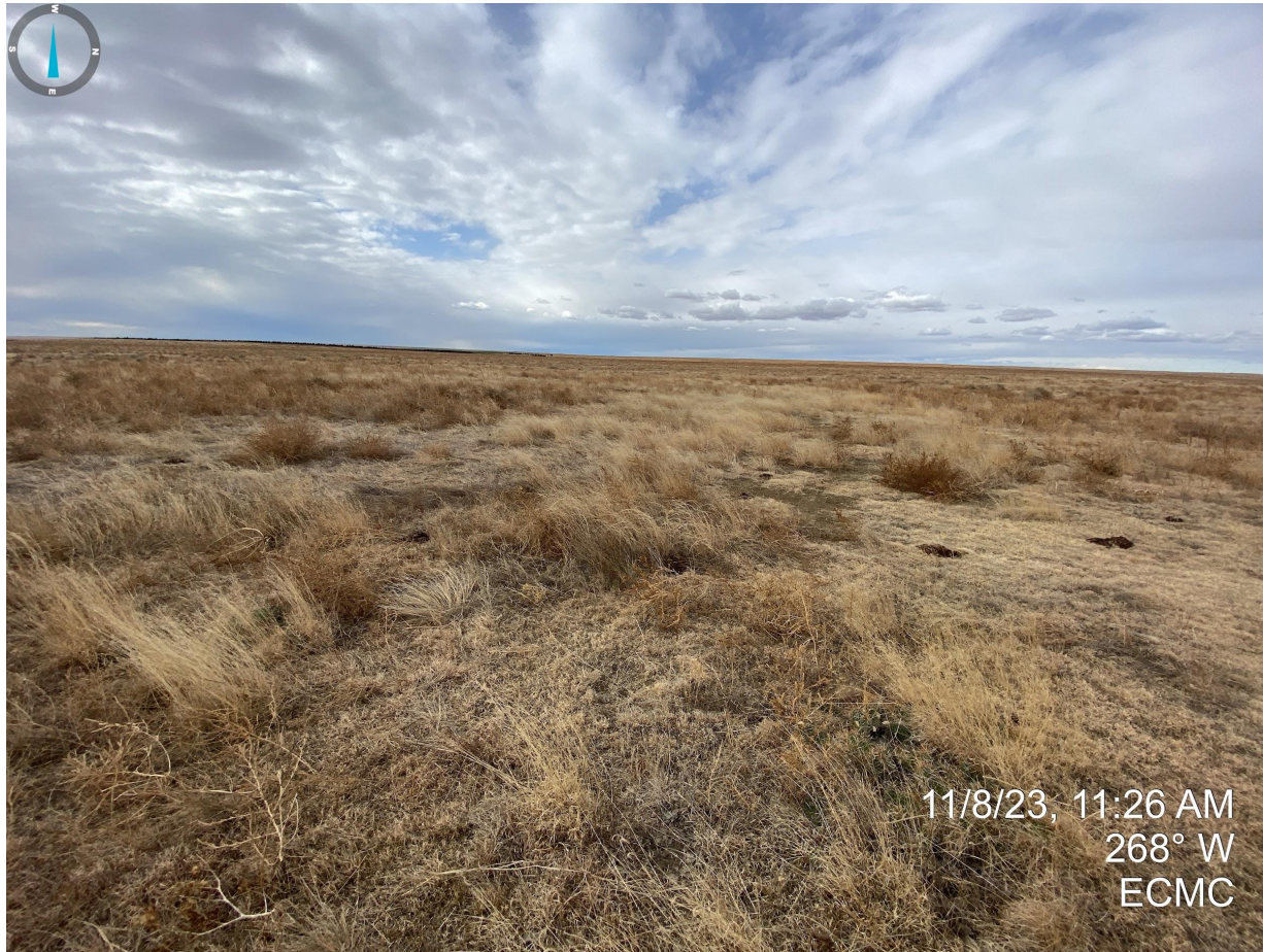
Photo 11. Taken from the eastern portion of the location, facing west. See comments in Photo 6.