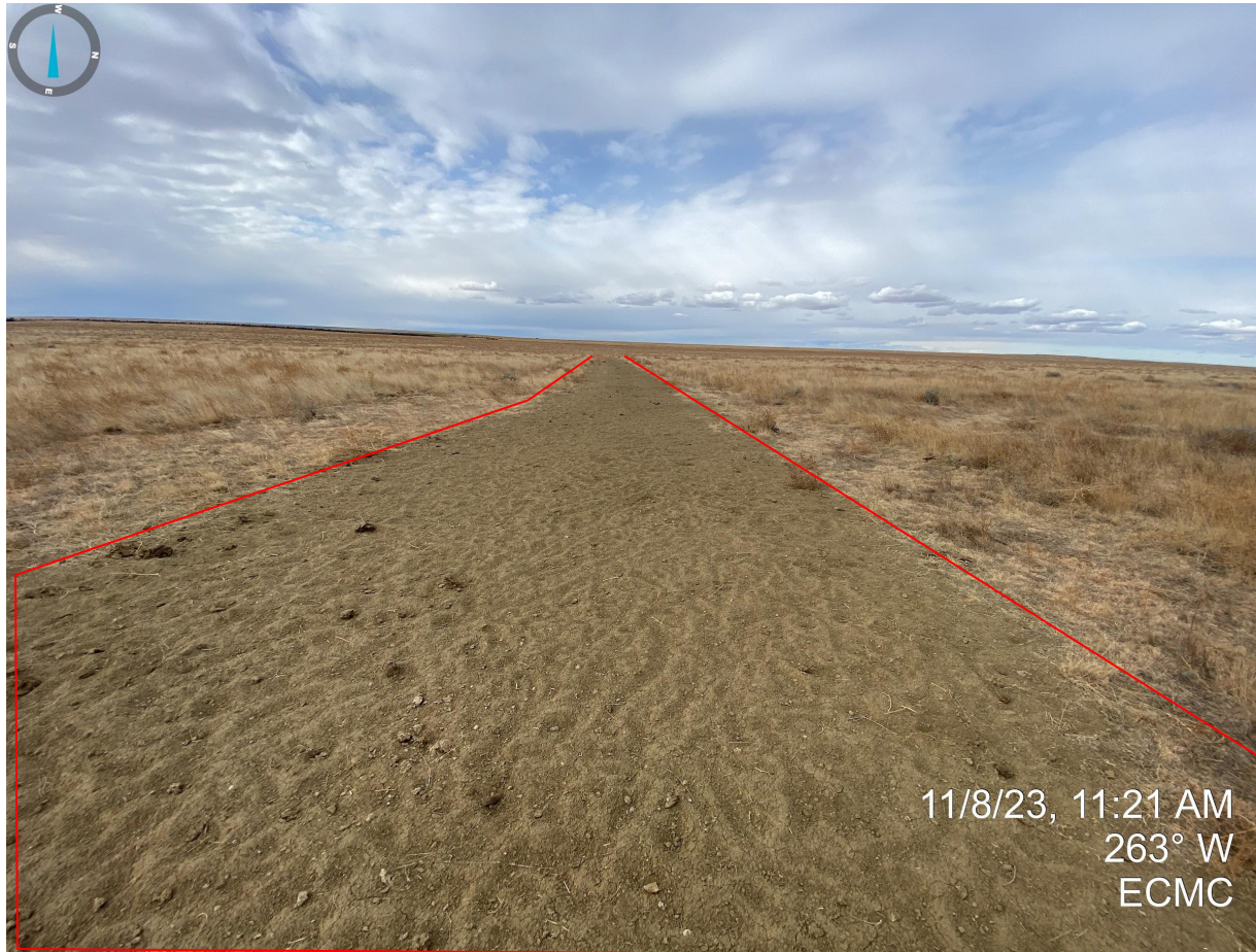
Photo 3. Taken from the access road east of the location. See comments in Photo 1.