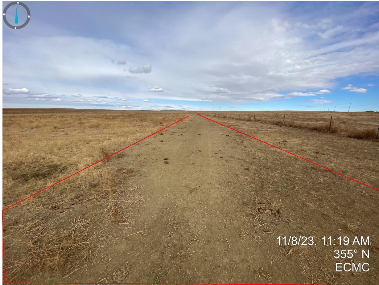
Photo 1. Taken southeast of the location at the start of the location's access road. The former access road has not been reclaimed with evidence of exposed soils. Additional reclamation work is required to comply with Rule 1004 and stabilize the soil.